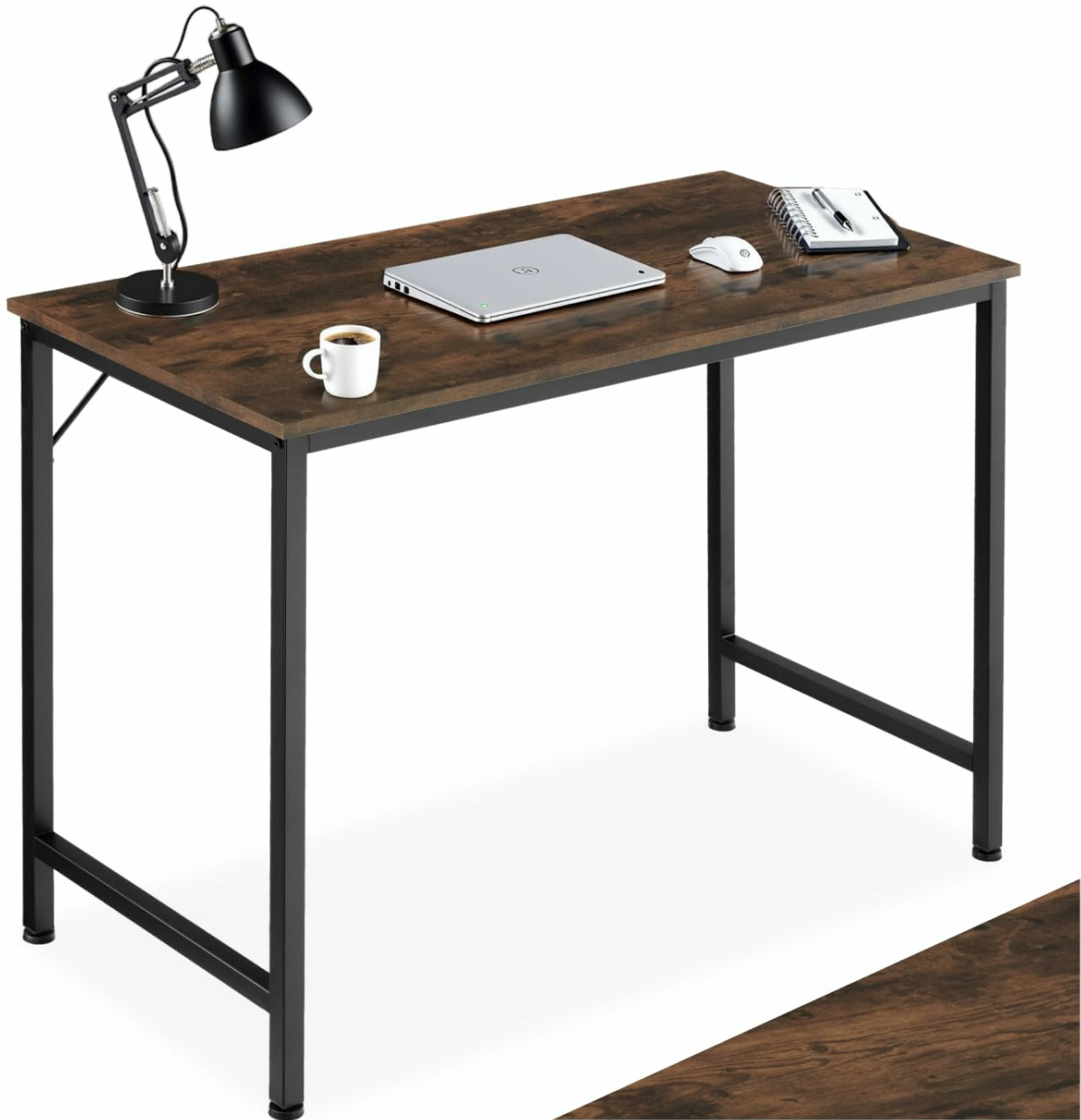
Image 1.1: The tectake Jenkins 100 Desk, showcasing its dark brown wooden top and black metal frame.