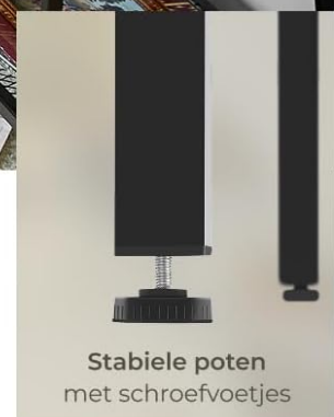
Image 4.1: Detail of the stable steel frame and adjustable feet for leveling.