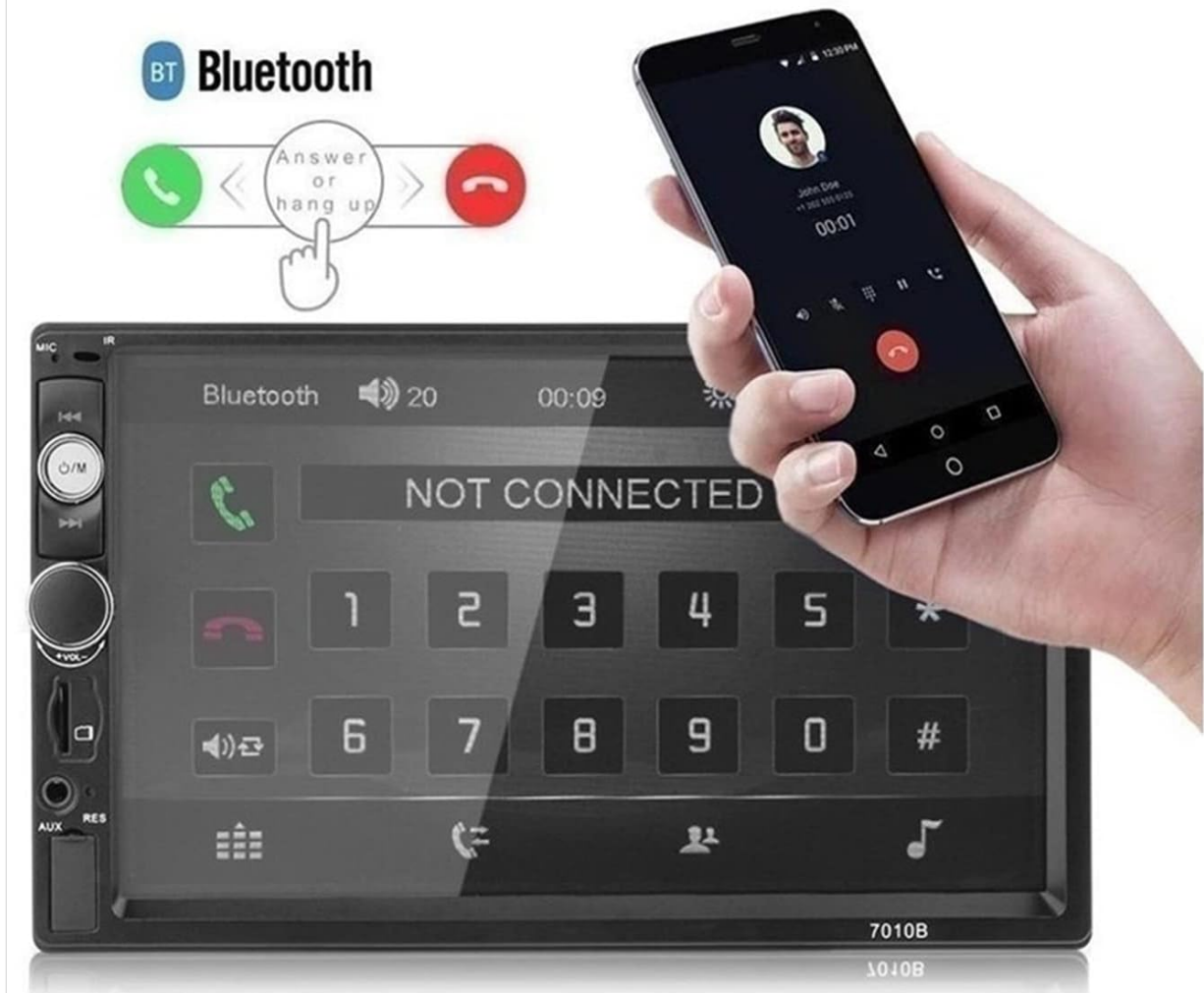
Image 6.1: The Bluetooth hands-free calling interface on the HAMFIT 7010B screen, demonstrating how to answer or hang up calls wirelessly.

Bluetooth wireless connection, set aside data lines, Bluetooth hands-free calling, voice navigation, mobile songs, enjoy.