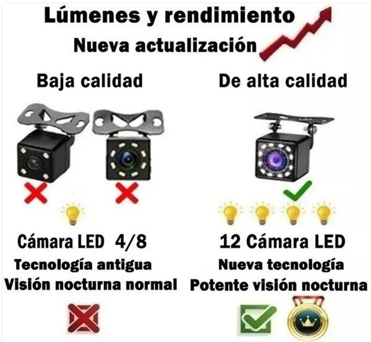
Image 5.2: A visual comparison highlighting the enhanced performance of the 12 LED camera included with the HAMFIT 7010B, offering superior night vision compared to older 4/8 LED camera technology.