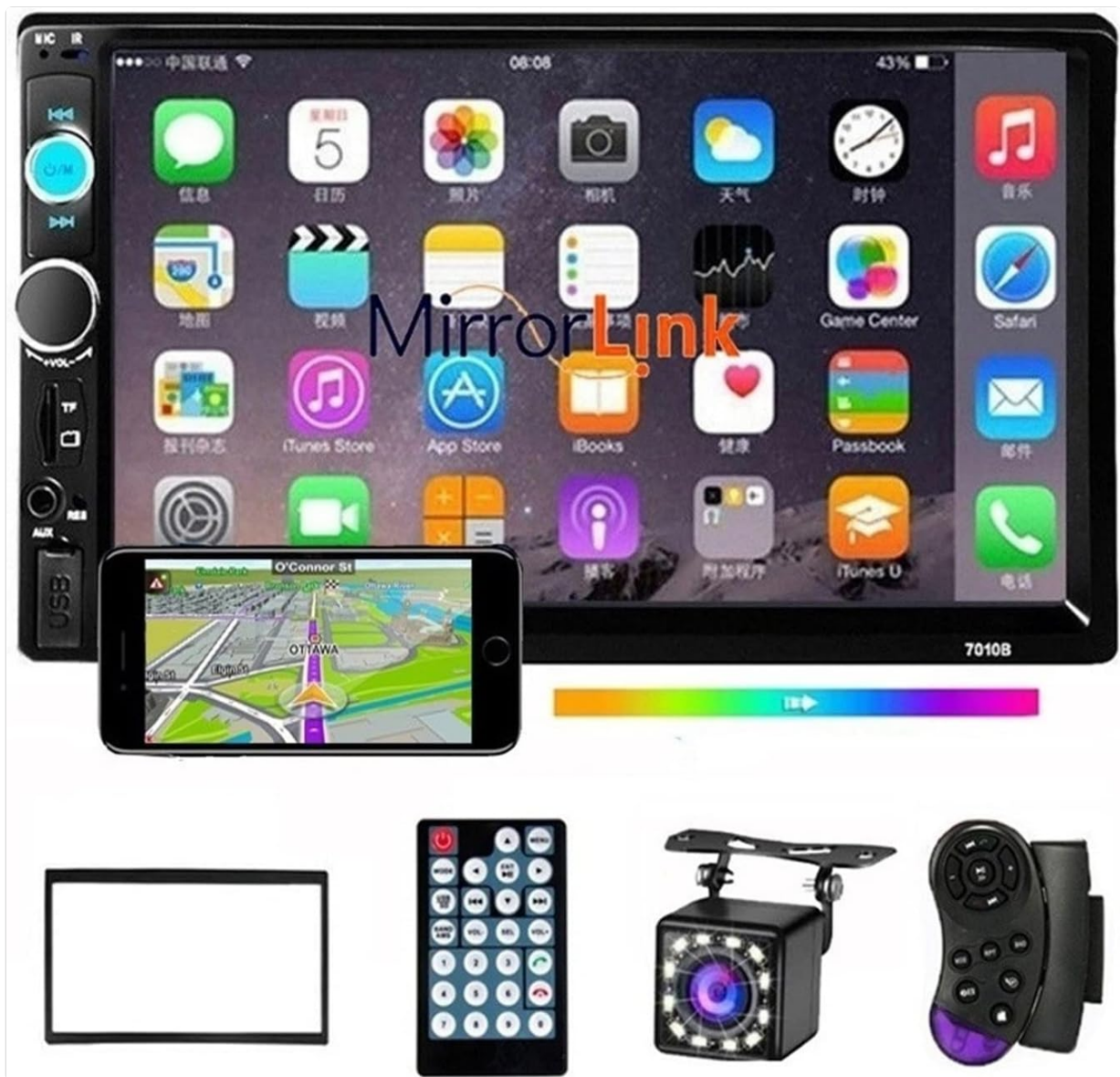
Image 3.1: The HAMFIT 7010B Car Stereo unit shown with its included accessories, including a remote control, a rear view camera, and mounting frame.