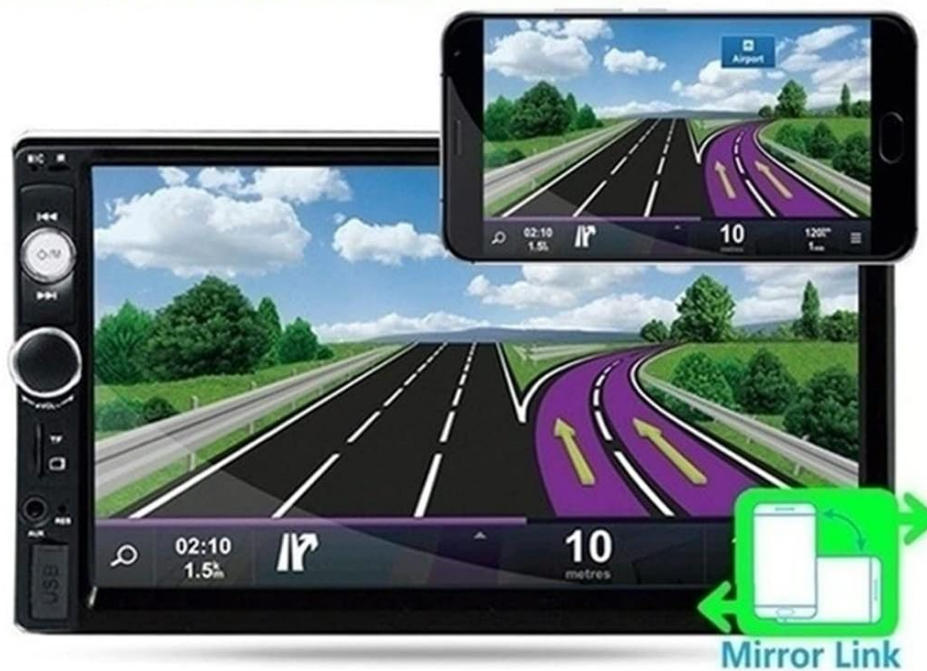
Image 6.2: A visual representation of the Mirror Link function, showing a smartphone screen mirrored onto the HAMFIT 7010B display, enabling navigation and other apps to be viewed on the larger screen.

(Notas: cuando un teléfono Android está usando el modo espejo, es posible que se le solicite que descargue la aplicación, puede hacer clic en descargar directamente en el teléfono y usar la aplicación para controlar el estéreo.)