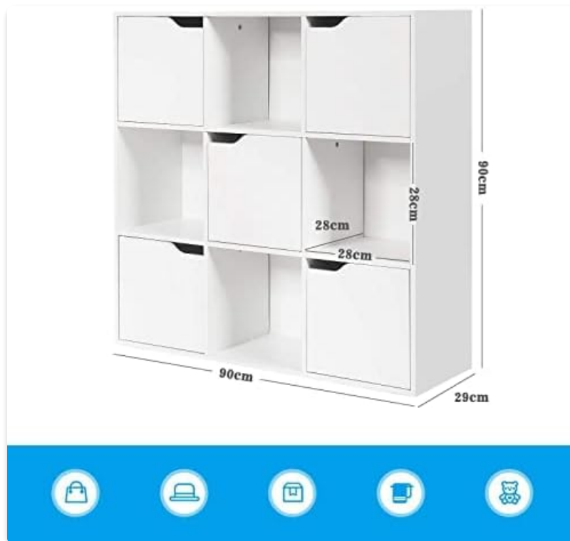
Image: Dimensional diagram of the cabinet, indicating overall and internal cube measurements.