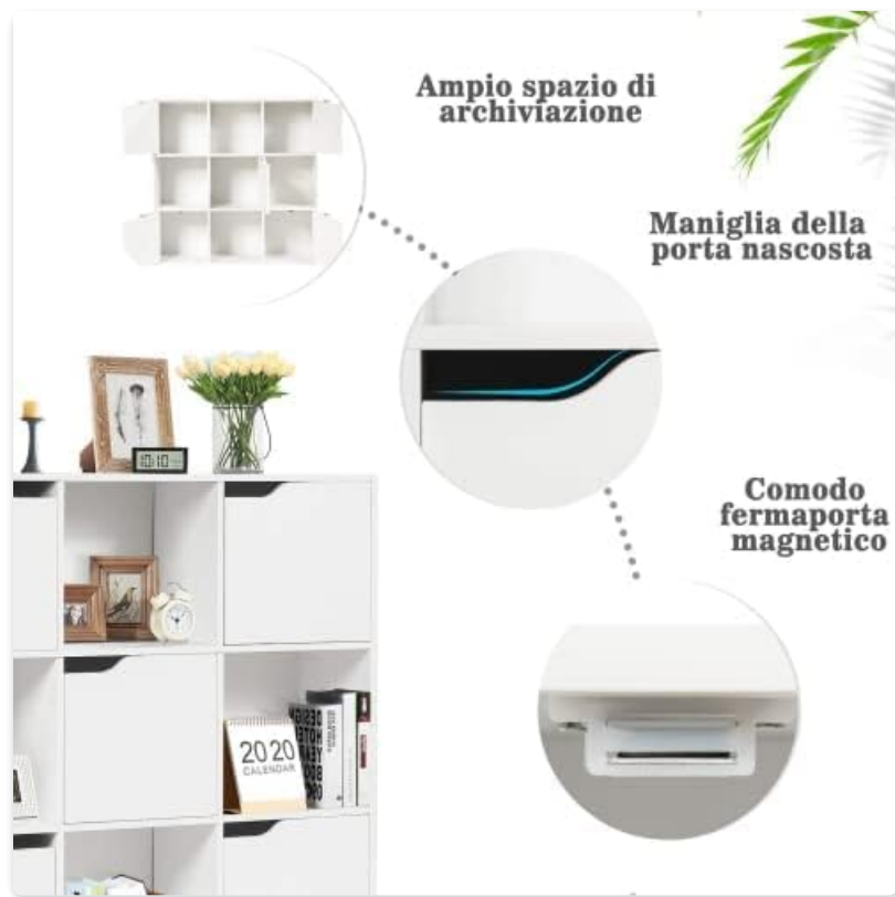
Image: Details of the hidden door handle and magnetic door catch for secure and convenient use.