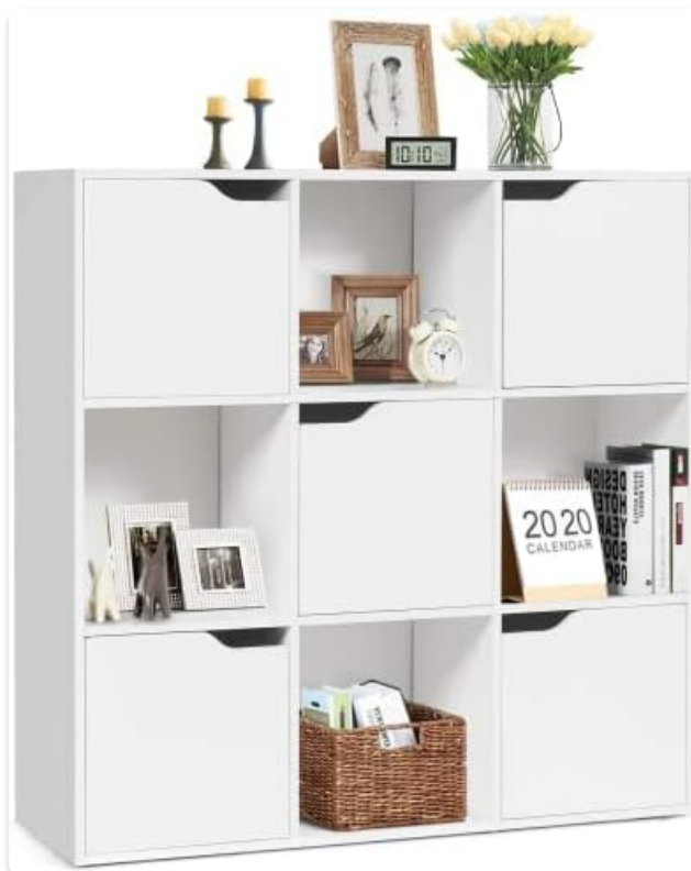
Image: The GYMAX Low Bookcase Cabinet, a white 9-cube storage unit, showcasing its versatile use for books and decor.

Thank you for choosing the GYMAX Low Bookcase Cabinet. This manual provides essential information for the safe assembly, proper use, and maintenance of your new furniture. Please read these instructions carefully before assembly and retain them for future reference.