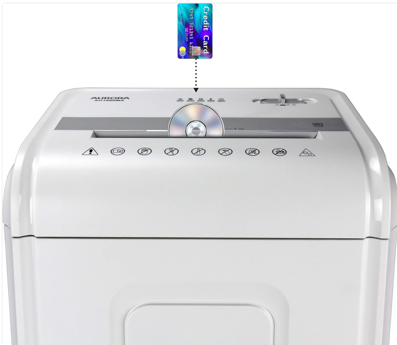
Figure 2.2: Top view of the shredder head, highlighting the separate entry slots for paper and for CDs/DVDs/credit cards, along with control icons.