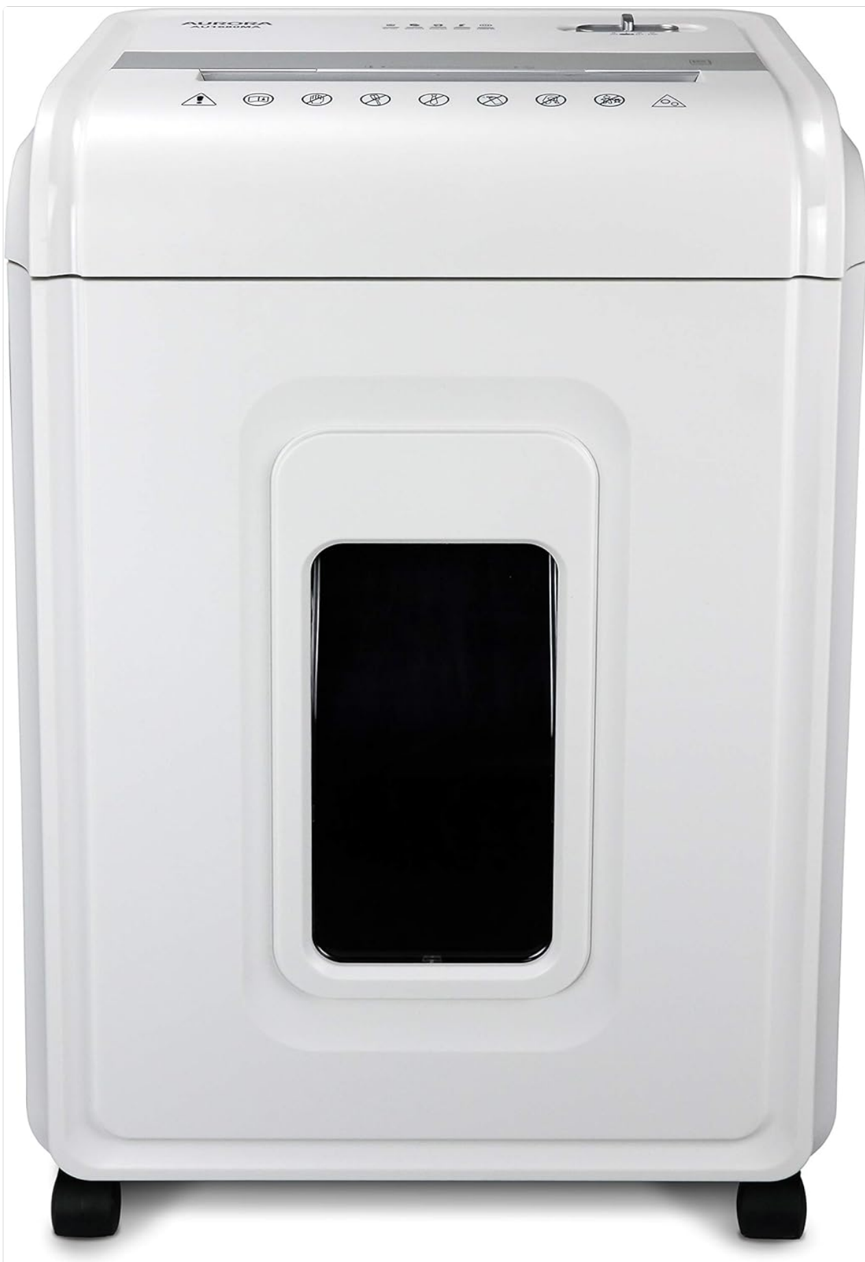
Figure 2.1: Front view of the Aurora AU1680MZ shredder, showing its sleek white design and waste bin window.