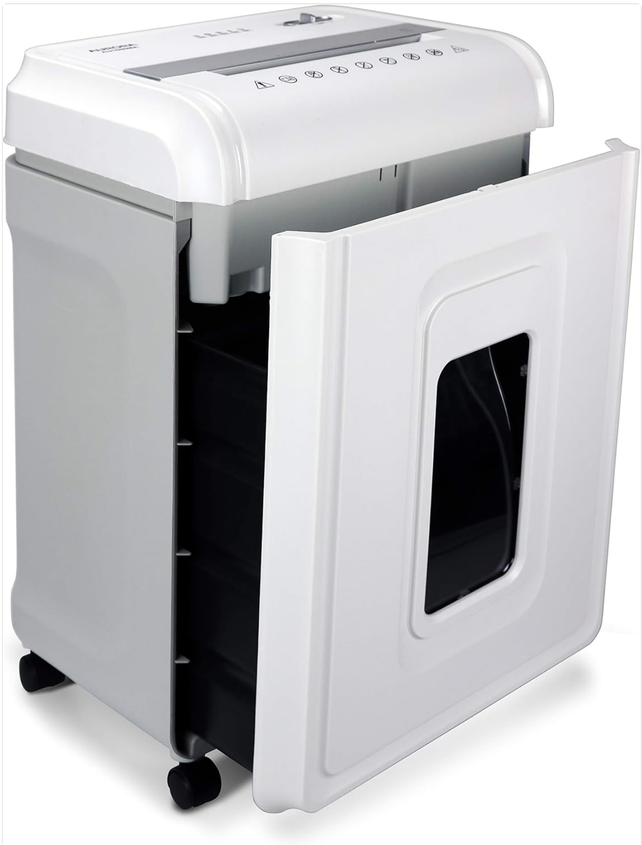
Figure 2.3: The shredder with its 7-gallon pullout waste basket extended, demonstrating ease of access for emptying.