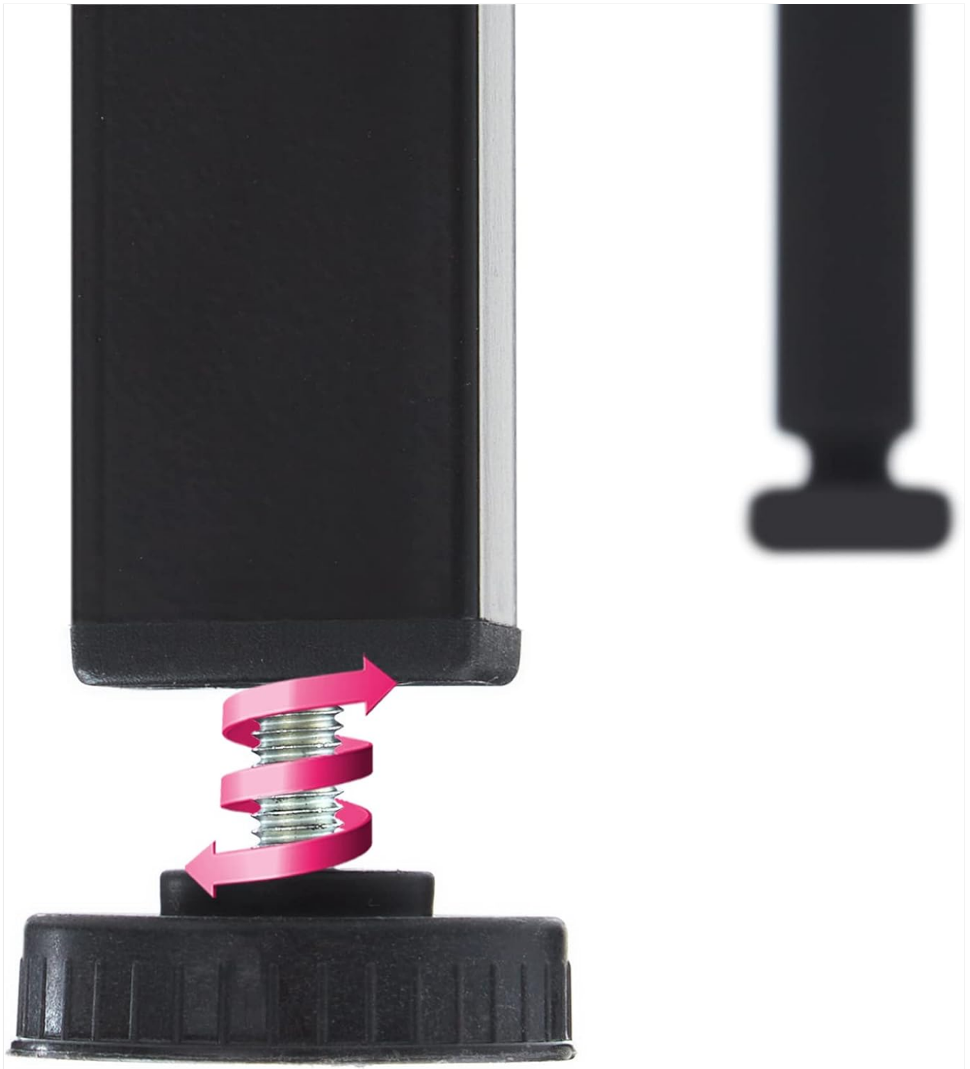
Figure 3: Detail of adjustable feet for leveling.