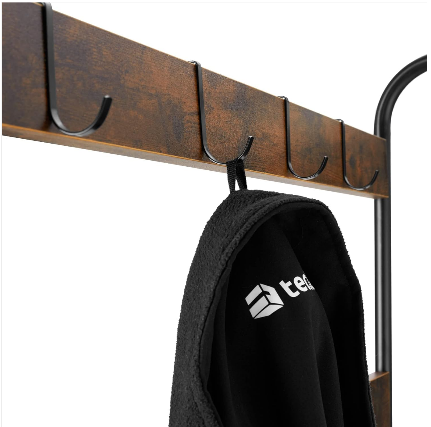
Figure 4: Robust hooks for hanging various garments and accessories.