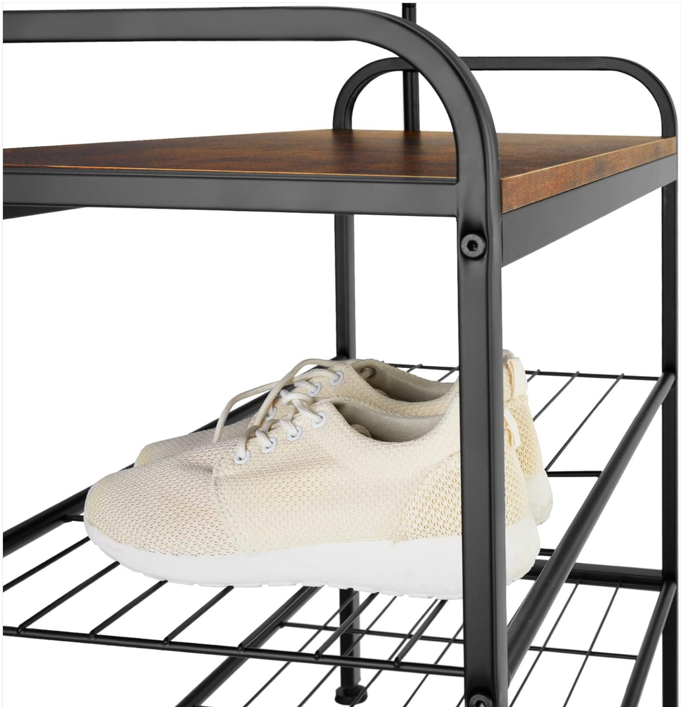
Figure 5: Metal mesh shelves for shoe storage.