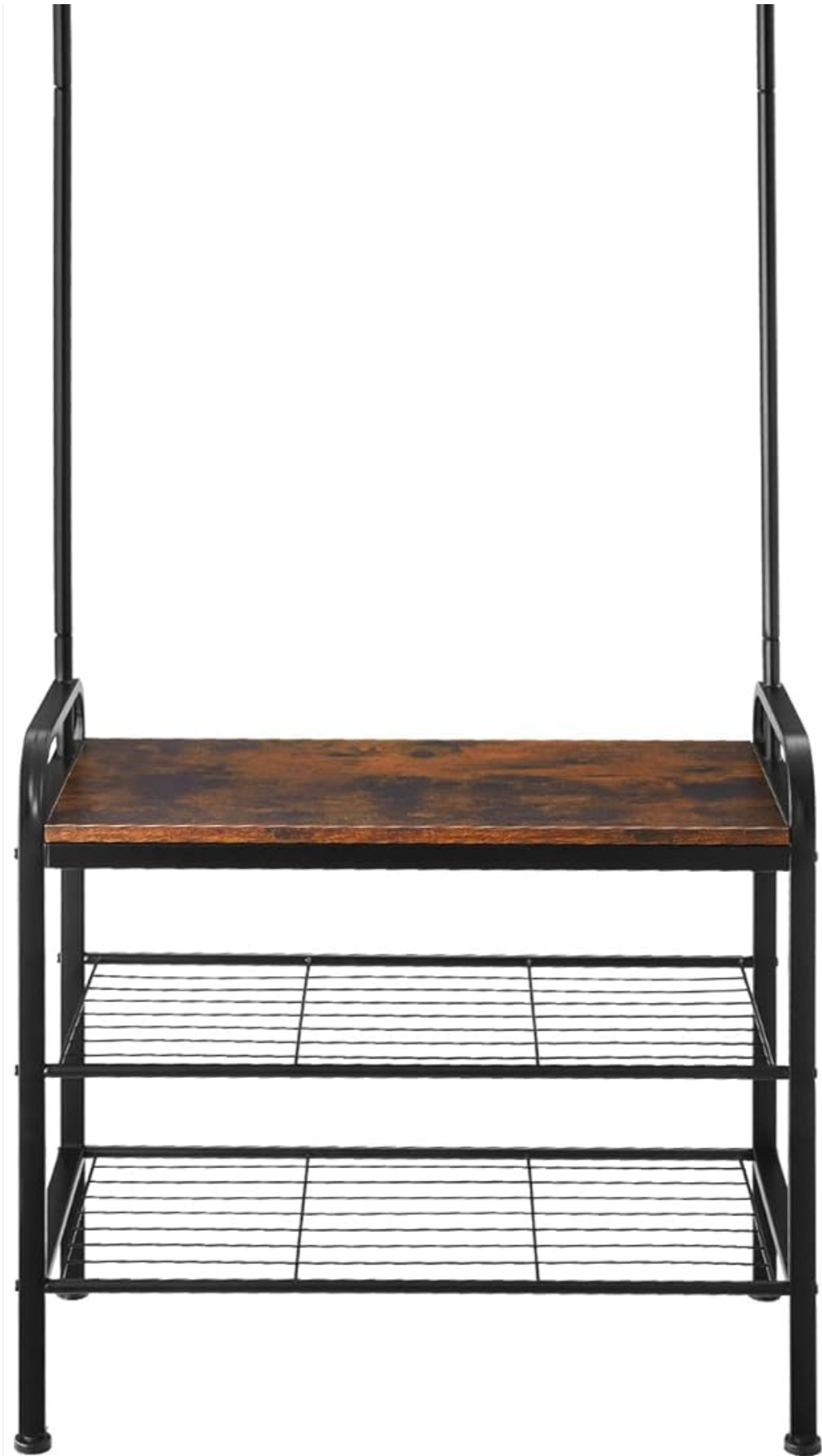
Figure 1: Front view of the tectake hall tree with shoe bench.