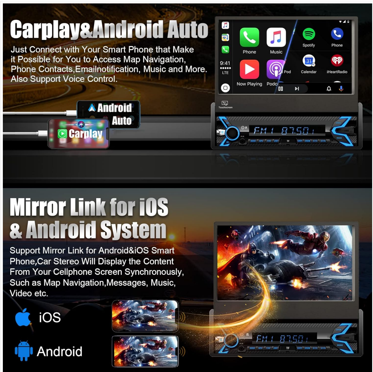
Figure 5.1: Apple CarPlay and Android Auto Interface.