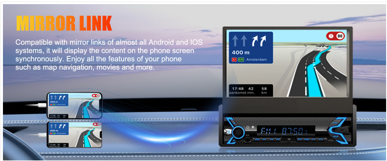
Figure 5.2: Mirror Link Functionality.