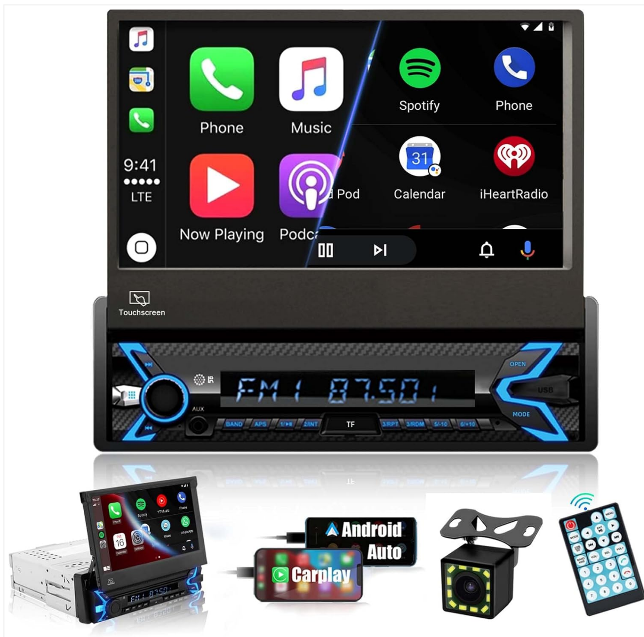
Figure 3.1: Front view of the SEMAITU Single Din Car Stereo.