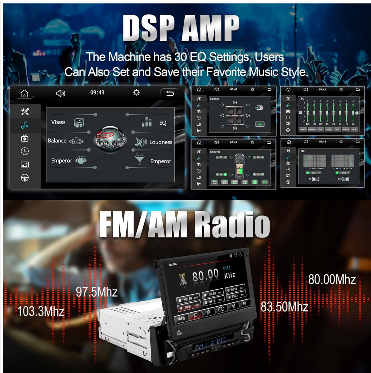
Figure 5.5: FM/AM Radio Interface.