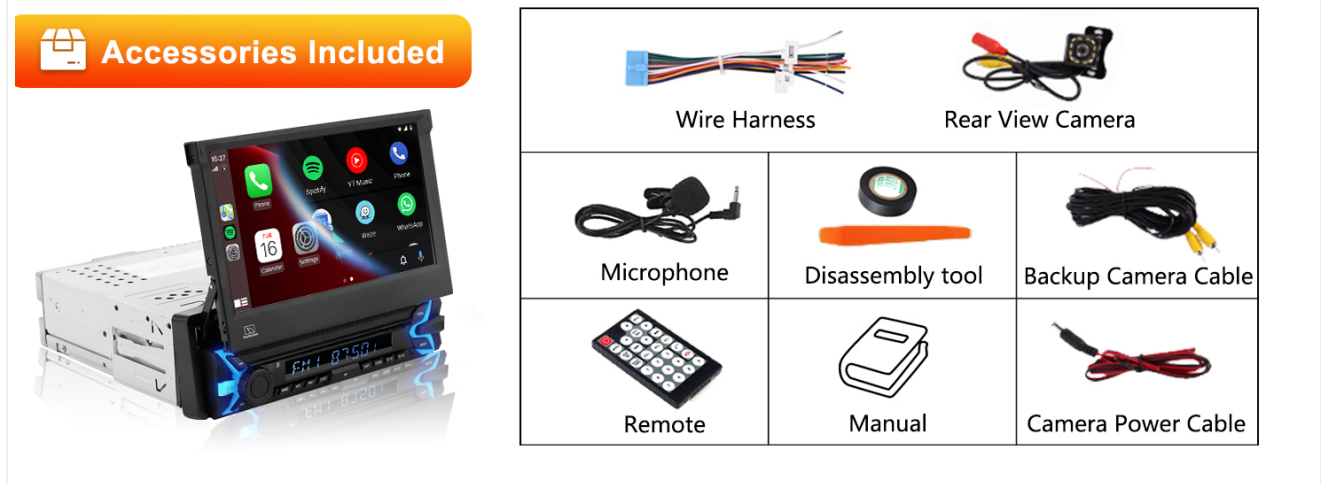
Figure 2.1: Included Accessories and Main Unit.