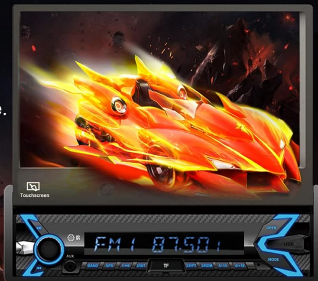
Figure 5.3: Bluetooth Hands-free Calls and Music.

Delicately Restore Every Detail, 7-inch High-definition Screen, Make You Feel More Comfortable.