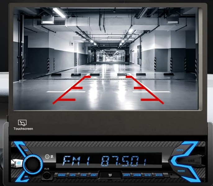
Figure 5.4: Supported Media Inputs.