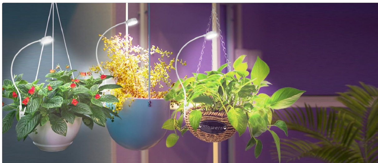
Figure 1: SANSI Pot Clip LED Grow Light in use with indoor plants.

Welcome to your new SANSI Pot Clip LED Grow Light. This manual provides essential information for the proper setup, operation, and maintenance of your grow light to ensure optimal growth for your indoor plants. Please read these instructions carefully before use and retain them for future reference.