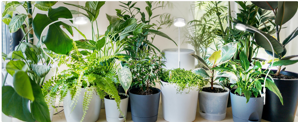
Figure 6: Full Spectrum light distribution for plant growth.