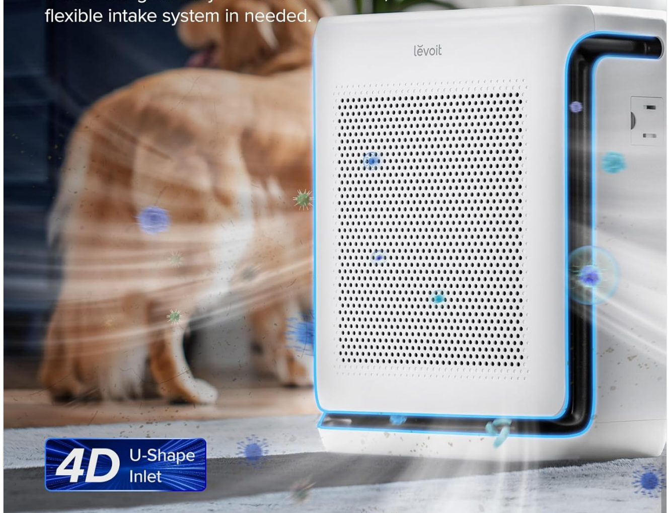
Figure 3: Illustration of the air purifier's comprehensive protection system, highlighting the U-shaped air inlet for enhanced intake.

Indoor allergens vary in size and direction, so a flexible intake system is needed.