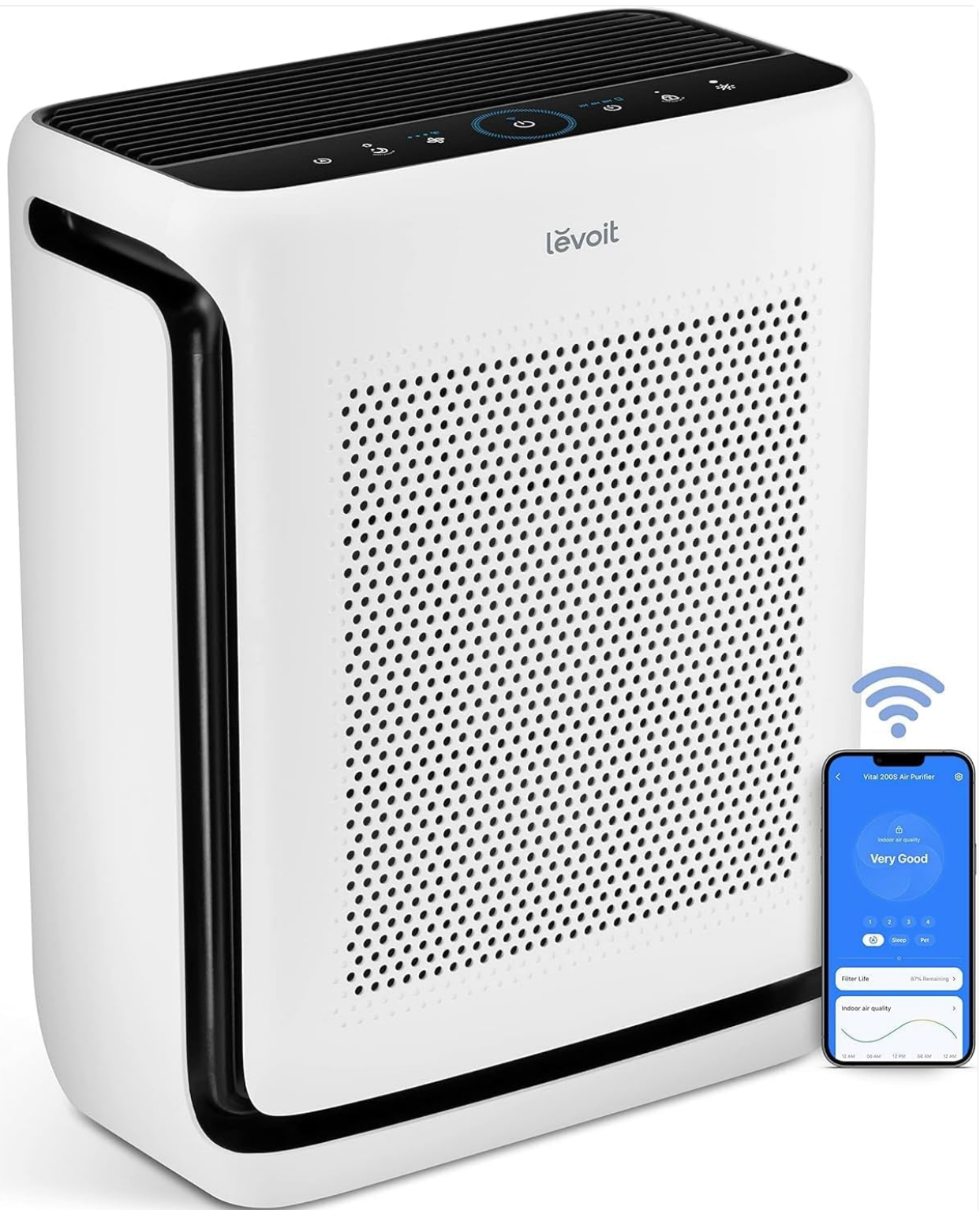
Figure 1: Front view of the LEVOIT Vital 200S-P Air Purifier, showcasing its sleek white design and perforated air intake.