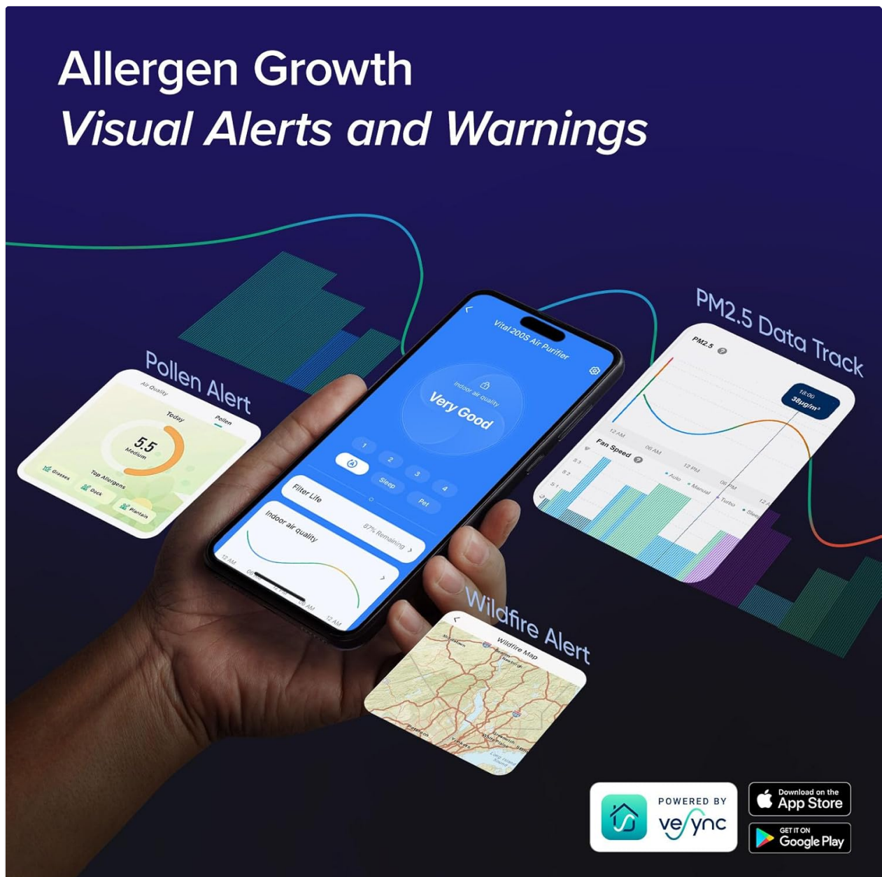
Figure 6: The VeSync app displaying air quality, pollen alerts, and PM2.5 data tracking, offering smart control and monitoring.