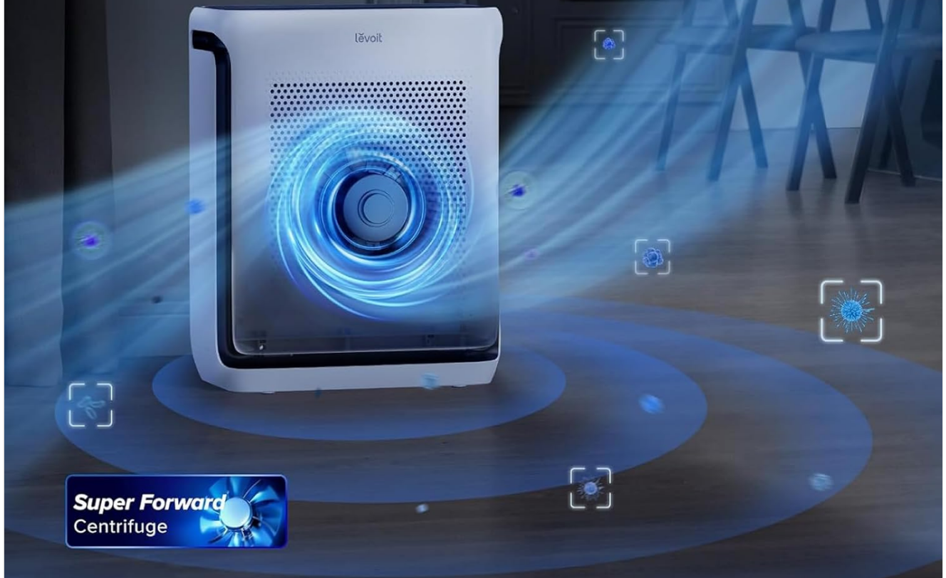
Figure 2: The air purifier demonstrating its powerful airflow, designed to freshen homes and eliminate allergens.

Upgrade to the superforward 55-blade centrifugal fan for over 30% 1 more airflow, Covers up to 1875 ft 2 .