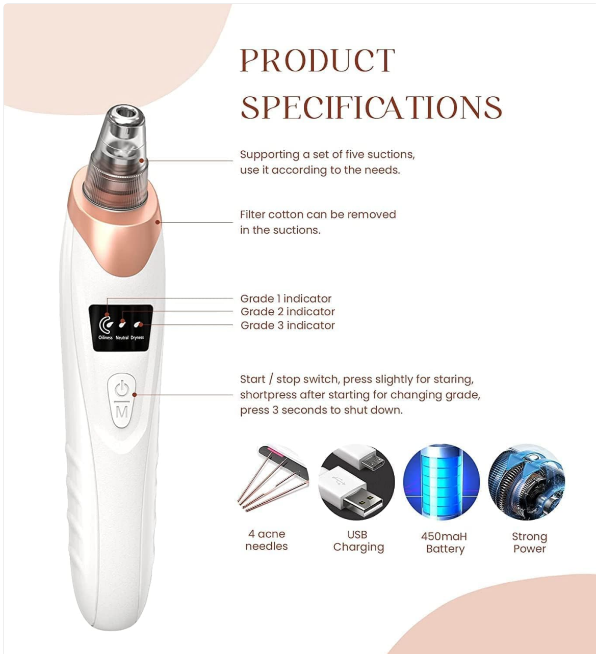
Figure 2.1: Gackoko HY9 Device Components and Features