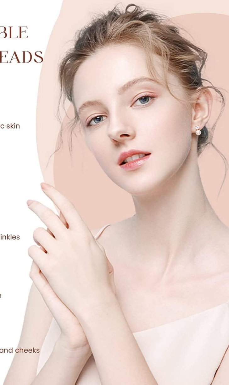
Figure 2.2: Replaceable Suction Heads and Their Recommended Uses