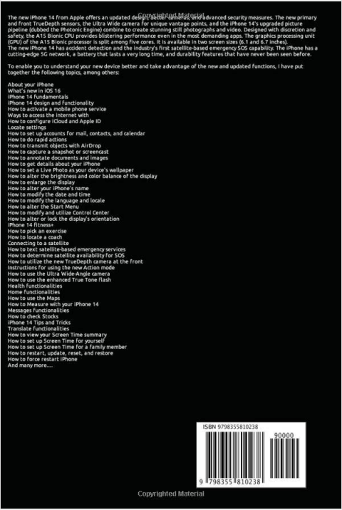
Image: Back cover of the "iPhone 14 User Guide" book. It features a detailed list of topics covered within the guide, including various functionalities and tips, along with the ISBN-13 barcode (979-8355810238).