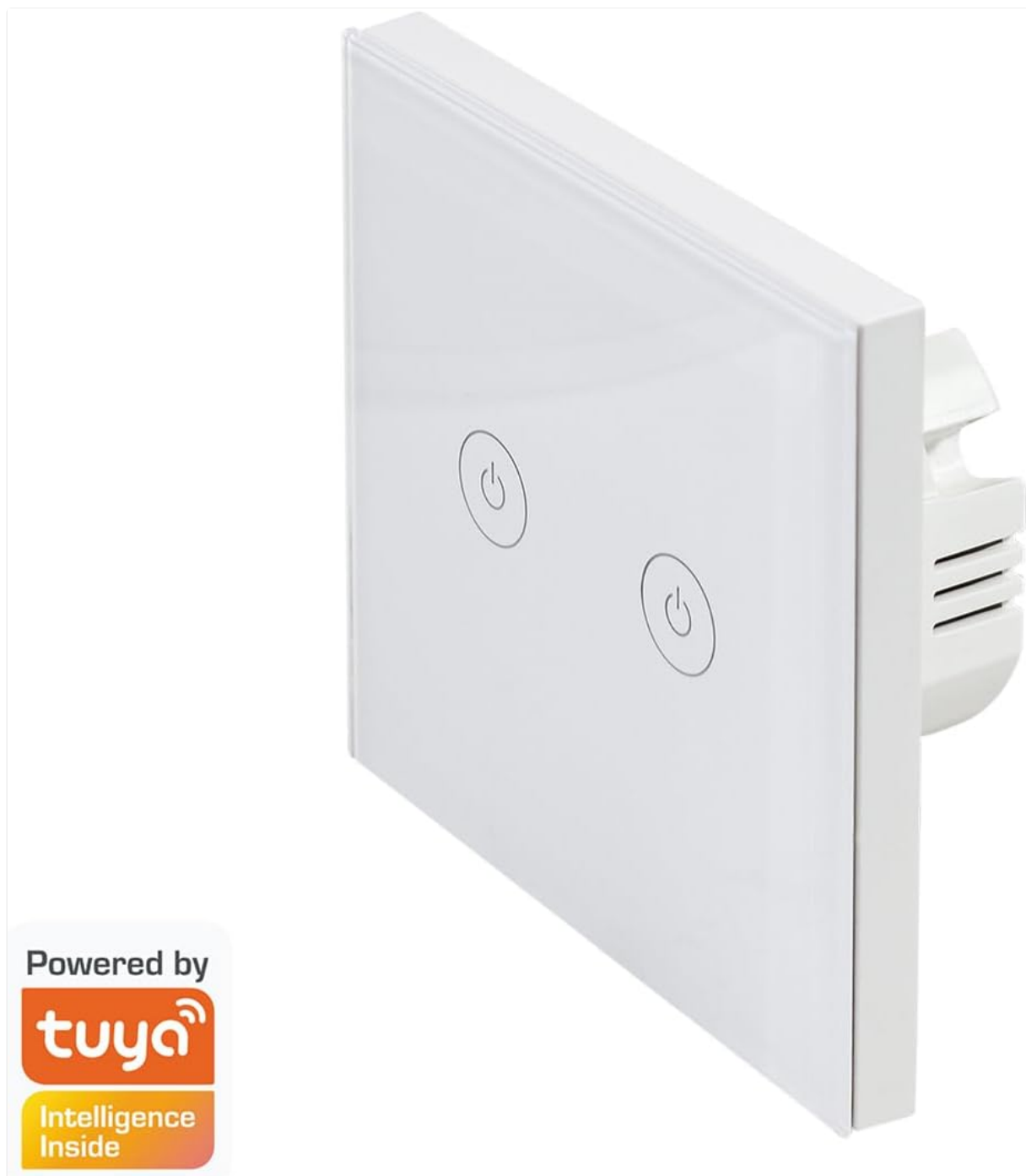
Figure 1: Front view of the LogiLink SH0125 Smart Home Wi-Fi Wall Switch. It features a white glass panel with two circular touch buttons, each marked with a power symbol. The 'Powered by Tuya' logo is visible in the bottom left corner.