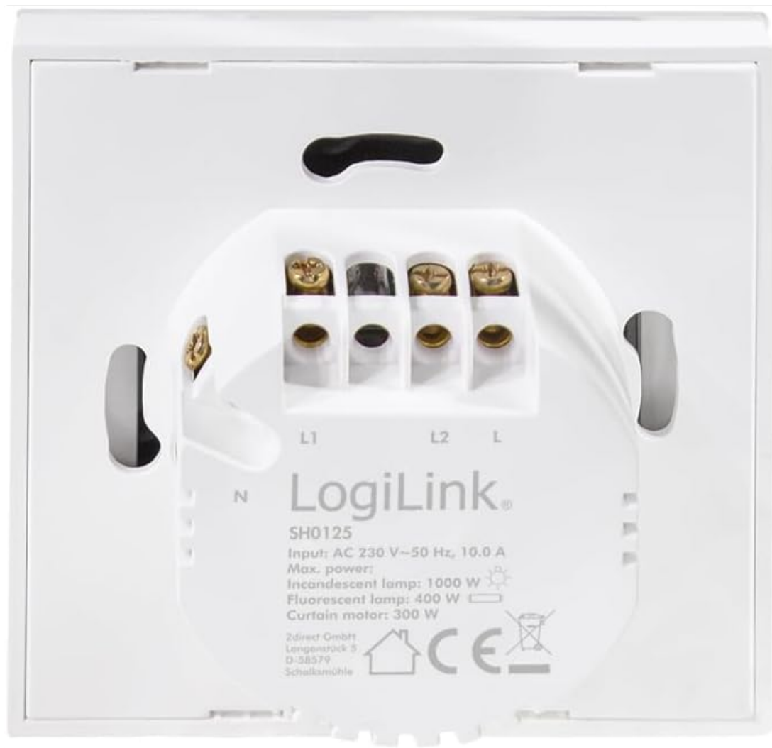
Figure 2: Back view of the LogiLink SH0125 Smart Home Wi-Fi Wall Switch. This image displays the wiring terminals labeled L1, L2, L, and N, along with product specifications such as input voltage (AC 230V), frequency (50 Hz), and maximum power ratings for different lamp types.