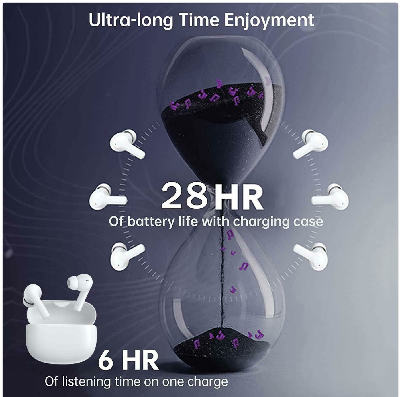
Image: An hourglass graphic illustrating the battery life of the Honor Choice Earbuds X3 Lite. It shows "28 HR of battery life with charging case" and "6 HR of listening time on one charge," with multiple earbuds circling the hourglass.