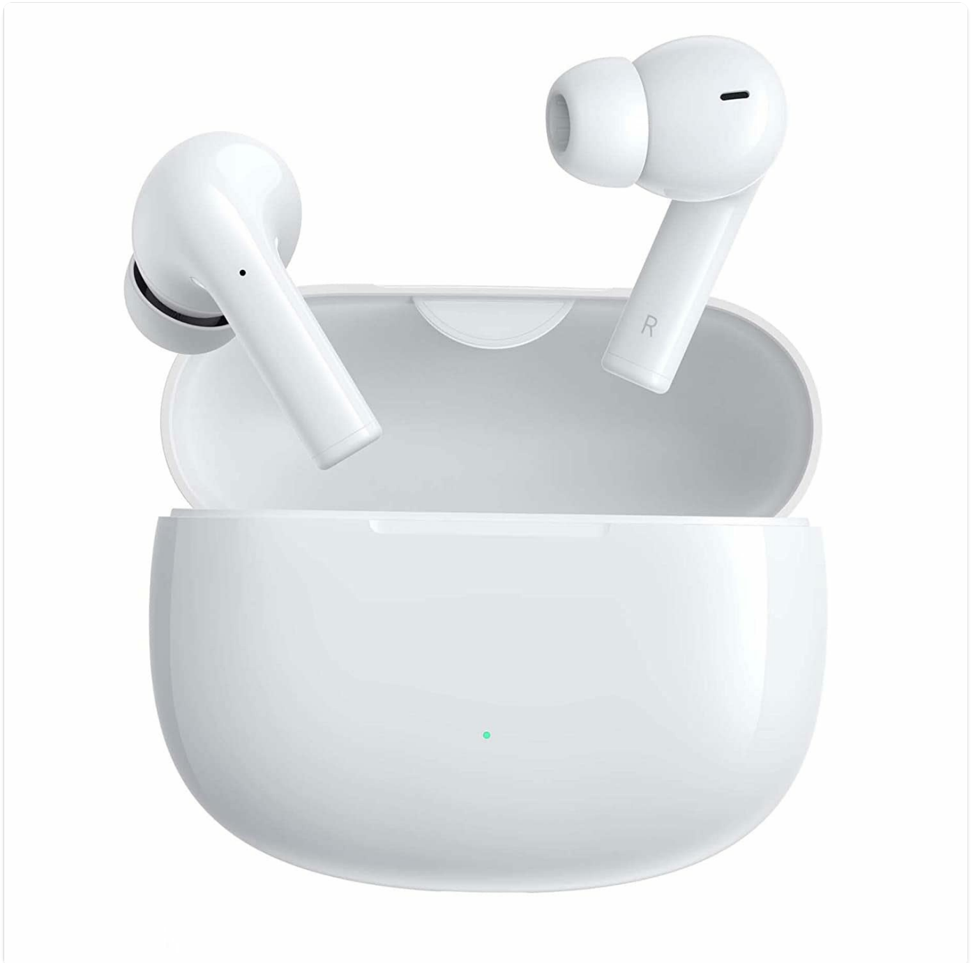
Image: Honor Choice Earbuds X3 Lite, white, resting in their open charging case. The earbuds are visible, showing their in-ear design and stems.