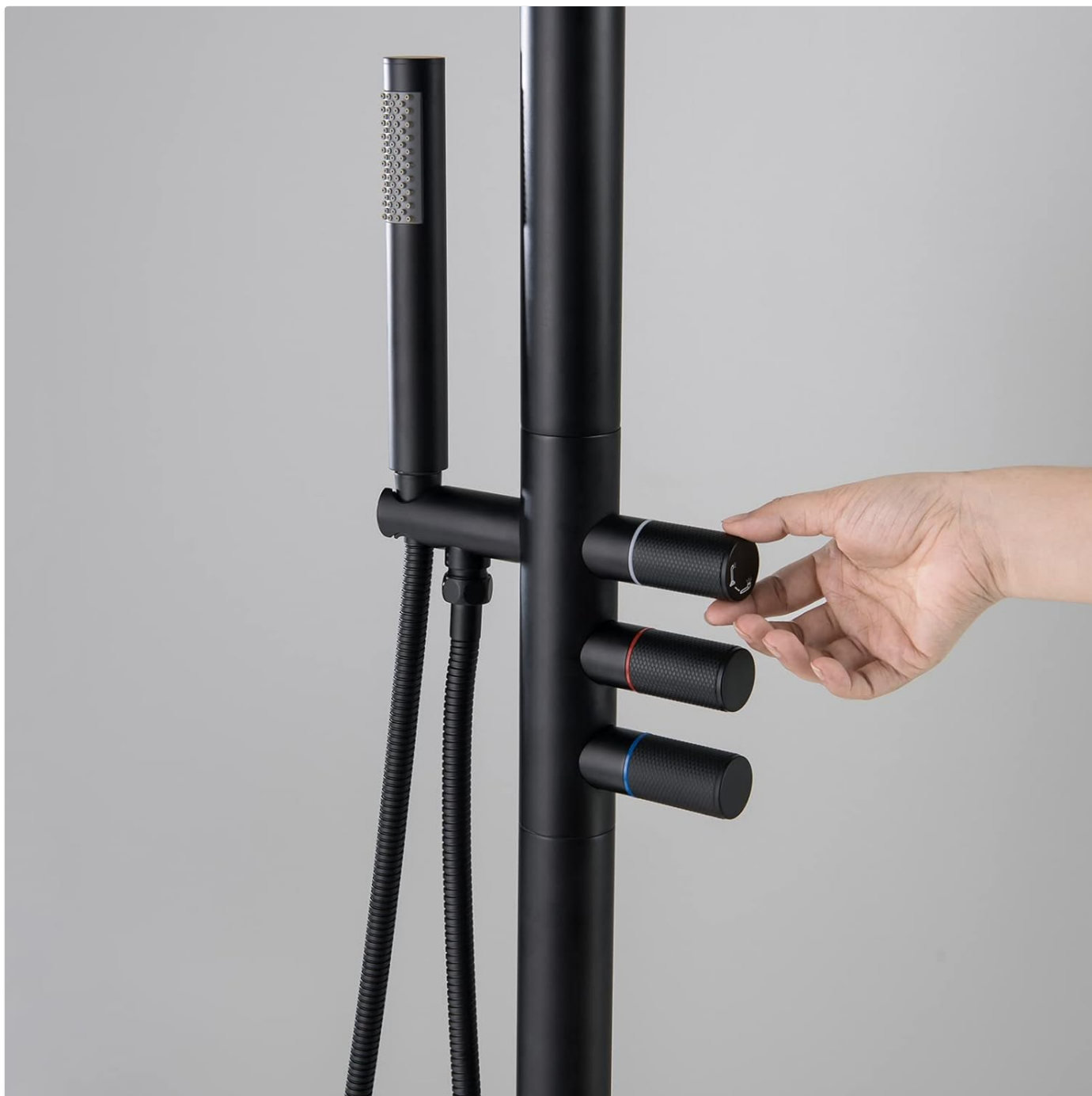
Image: A hand demonstrating the operation of the control knobs on the RBROHANT Outdoor Shower, showing the ease of adjusting settings.