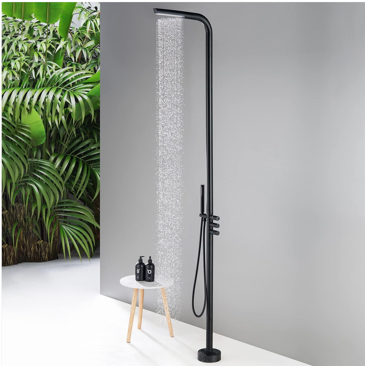
Image: The RBROHANT Outdoor Shower in operation, with water cascading from the overhead shower head, illustrating its rain shower function.