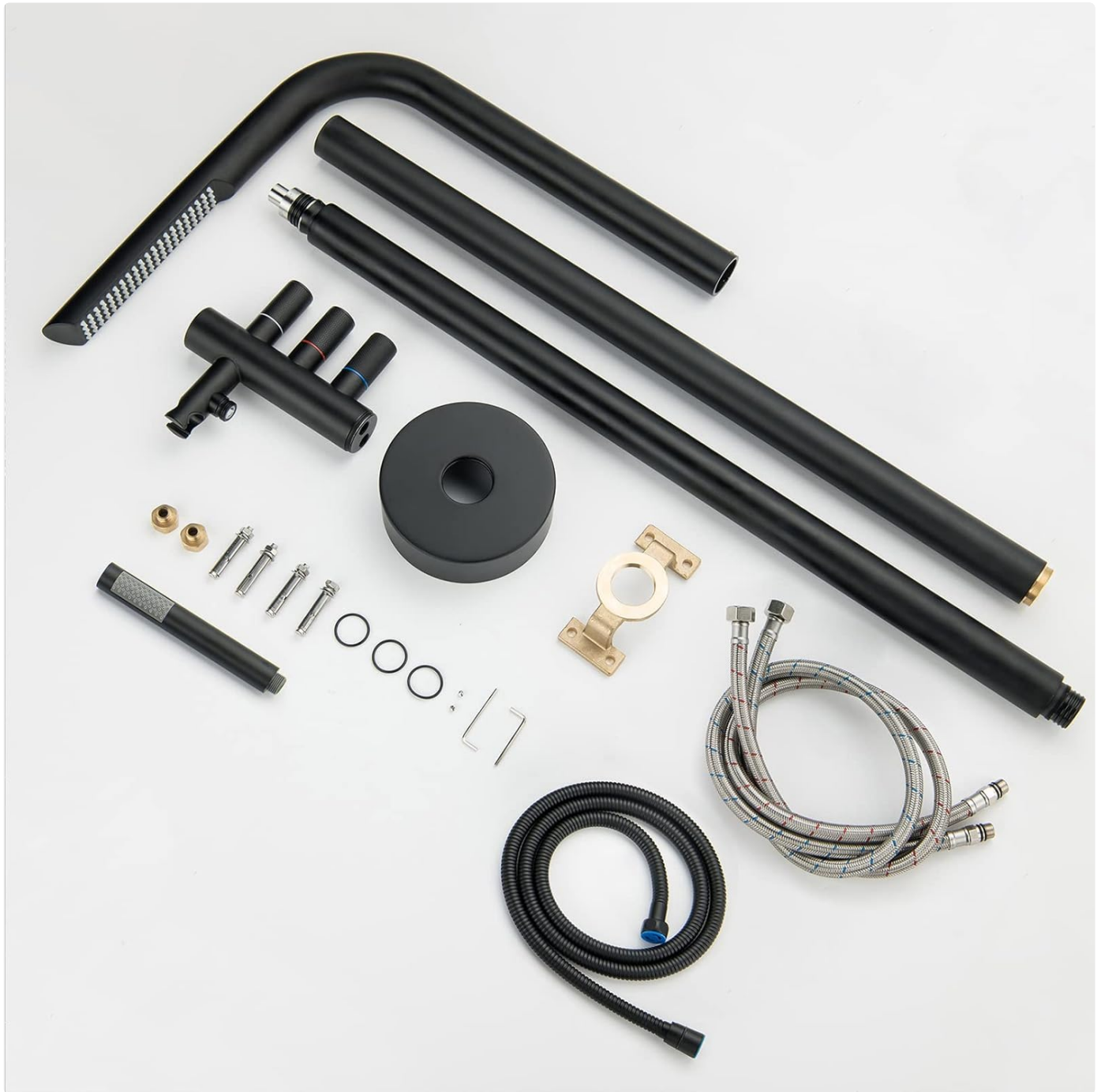
Image: All parts of the RBROHANT Outdoor Shower kit, including the main body, shower head, handheld shower, hoses, base, and installation hardware, neatly arranged on a white surface.

Verify that all components are present and undamaged before proceeding with installation.