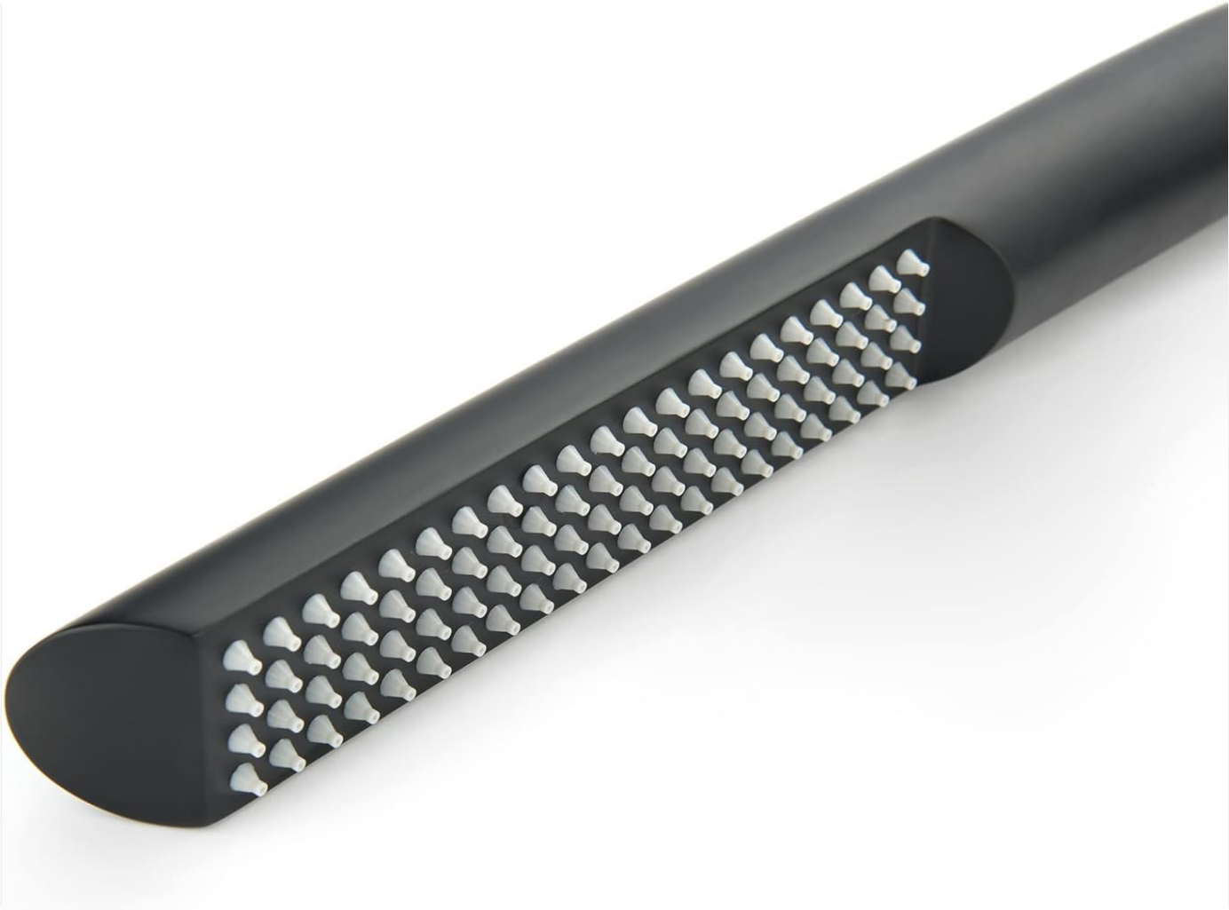
Image: A close-up view of the flexible silicone nozzles on the RBROHANT shower head, designed for easy cleaning and mineral deposit removal.