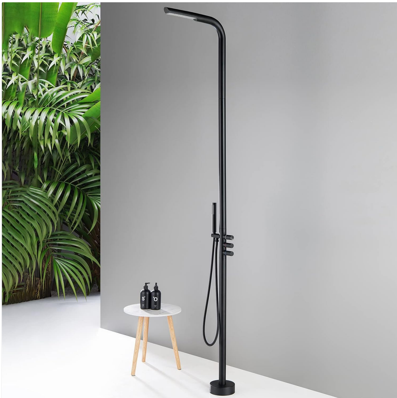
Image: The RBROHANT Outdoor Shower, matte black, positioned in a lush garden environment, showcasing its freestanding design.