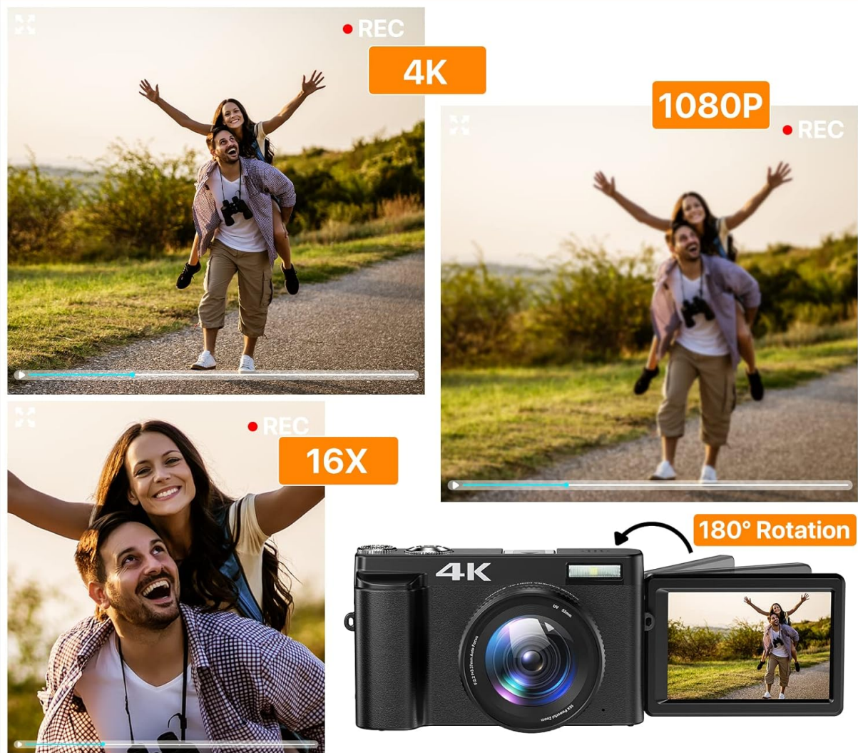
Figure 5: UHD 4K and 16X Digital Zoom capabilities.