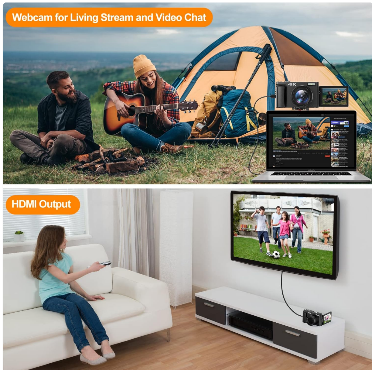
Figure 7: Webcam functionality and HDMI output.

Connect the camera to your computer using the USB cable and switch to "webcam" mode to use it for live streaming, video calls, or online teaching. For larger displays, connect the camera to a TV or projector via the HDMI cable.