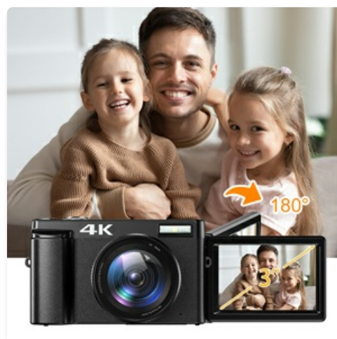
Figure 6: The 180° flip screen for easy self-recording.

The 3-inch touchscreen can be rotated 180 degrees, making it ideal for vlogging and self-portraits, allowing you to see yourself while recording or framing shots.