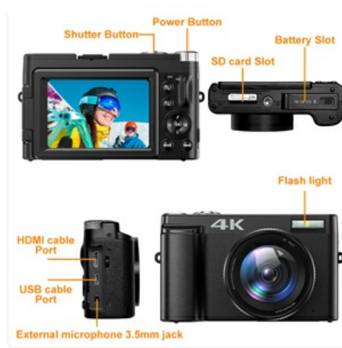
Figure 3: Location of battery and SD card slots.