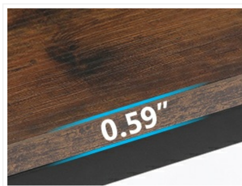
Figure 7: Detail of the desk's tabletop thickness (0.59 inches).