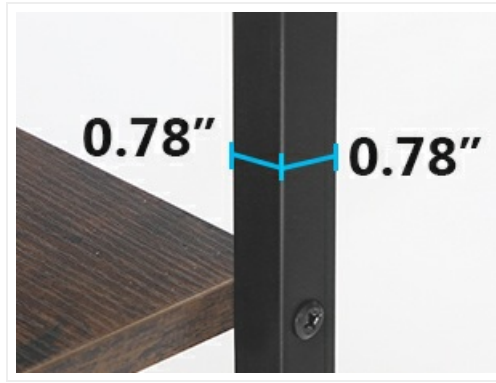
Figure 8: Detail of the desk's metal frame thickness (0.78 inches).