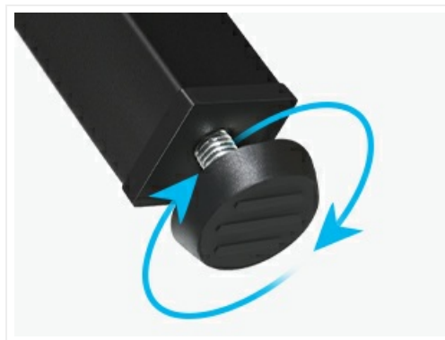
Figure 4: Adjustable foot pads ensure stability and prevent floor scratches.