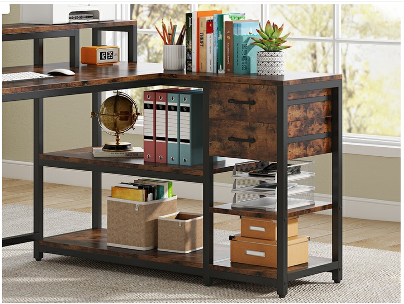
Figure 6: The long monitor stand provides ample space for screens and accessories, maintaining a clear work surface.