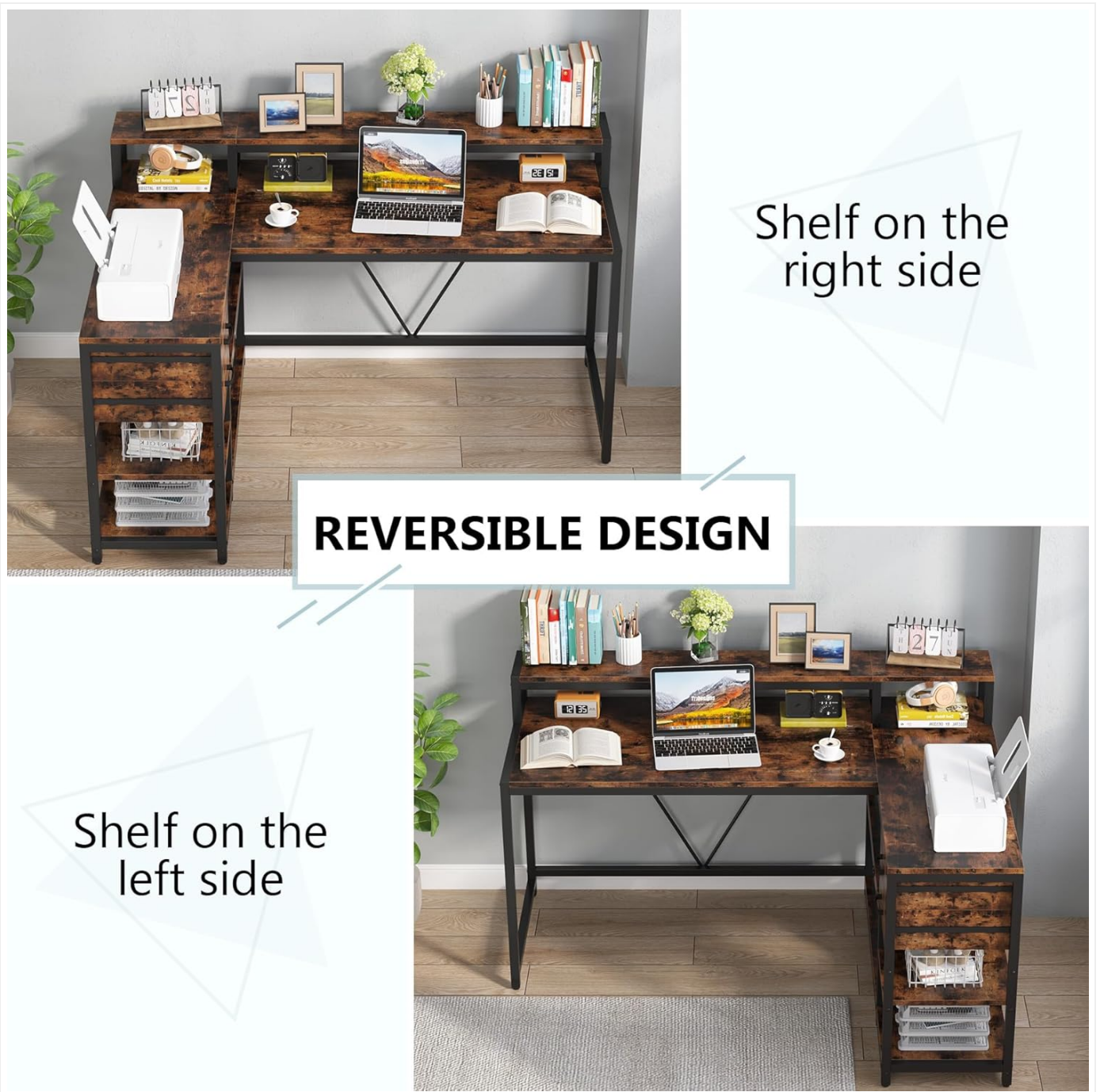
Figure 3: The desk's reversible design allows the storage shelves and drawers to be configured on either the left or right side to fit your space.