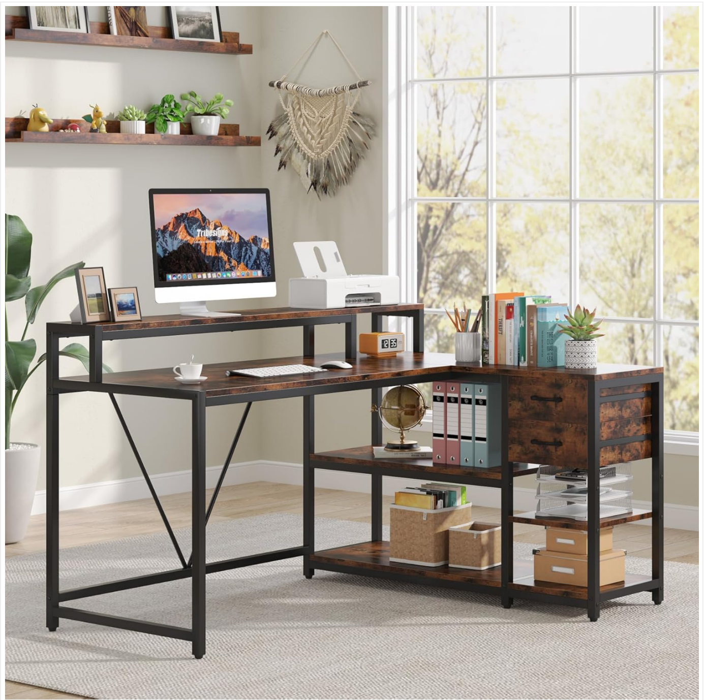
Figure 1: Tribesigns Reversible L Shaped Desk (Rustic finish) in a typical home office setup.