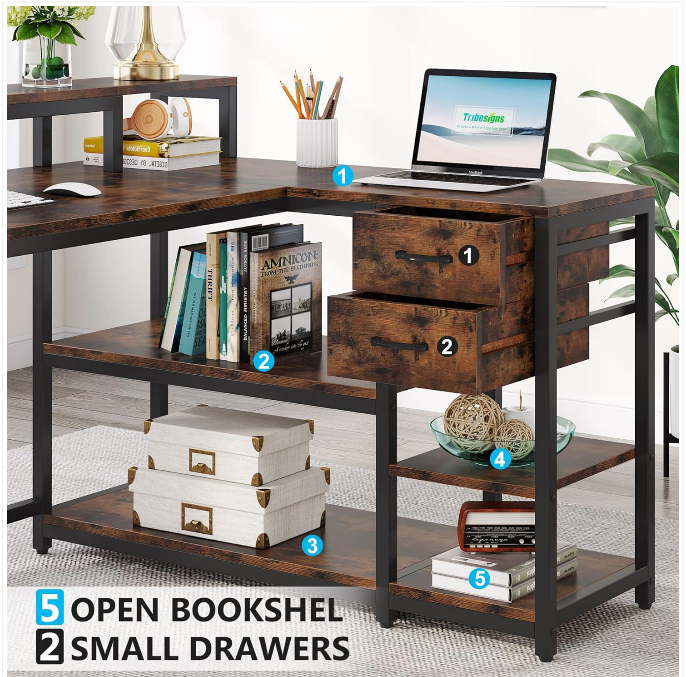
Figure 5: The desk features five open bookshelves and two small drawers for organized storage.