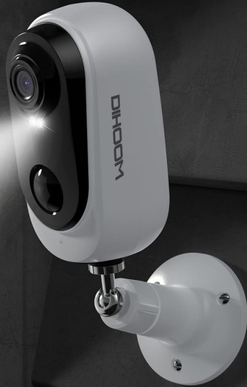
Image: The DIHOO camera with its spotlight illuminated, demonstrating its 2K color night vision capability in a dark environment, with a smartphone showing a clear, colored night view.