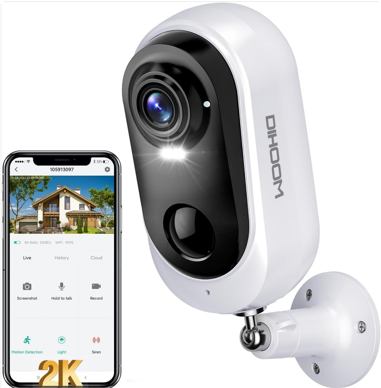
Image: The DIHOOM camera alongside a smartphone displaying the live view interface of the camera app, showing options for screenshot, talk, record, motion detection, light, and siren.

Open the DIHOOM app to access the live feed from your camera. You can view real-time video, take screenshots, and initiate manual recordings. To review past events, navigate to the 'History' or 'Cloud' section within the app.