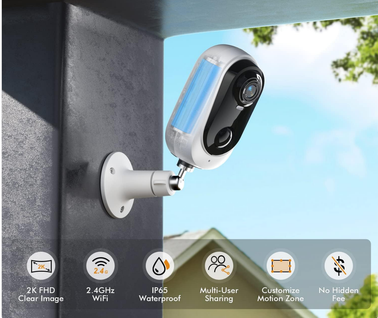
Image: The DIHOOOM camera mounted outdoors, with text indicating "180 days battery life" and various feature icons like 2K FHD Clear Image, 2.4GHz WiFi, IP65 Waterproof, Multi-User Sharing, Customize Motion Zone, and No Hidden Fee.

No need frequently to take down to charge after a full charge