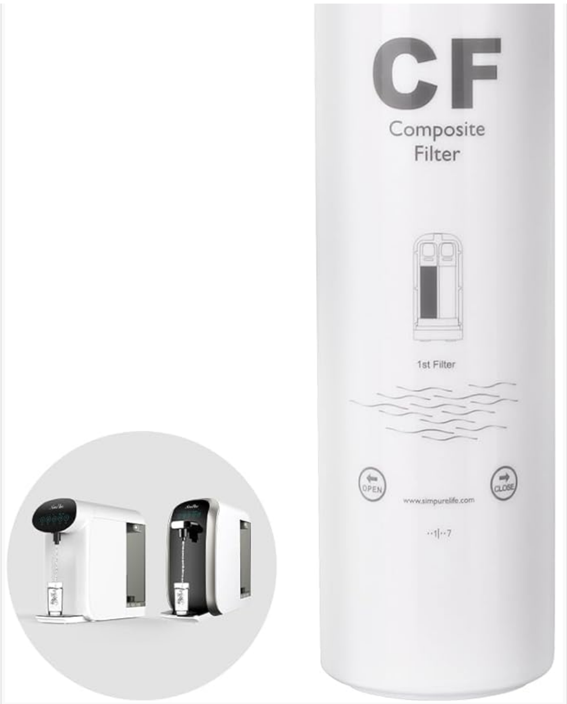
Image 1: SimPure Y7/Y7P Series CF Filter Replacement Cartridge. This image shows the filter itself, highlighting its design and compatibility with the SimPure Y7/Y7P system.