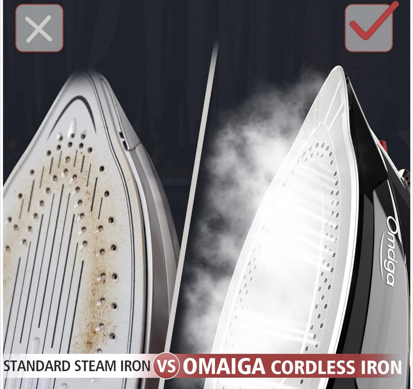
Image: A visual representation contrasting a standard steam iron with limescale buildup against a clean OMAIGA Cordless Iron, illustrating the effectiveness of the anti-calc and self-clean features.

Prevents limescale build-up and protects clothes from staining