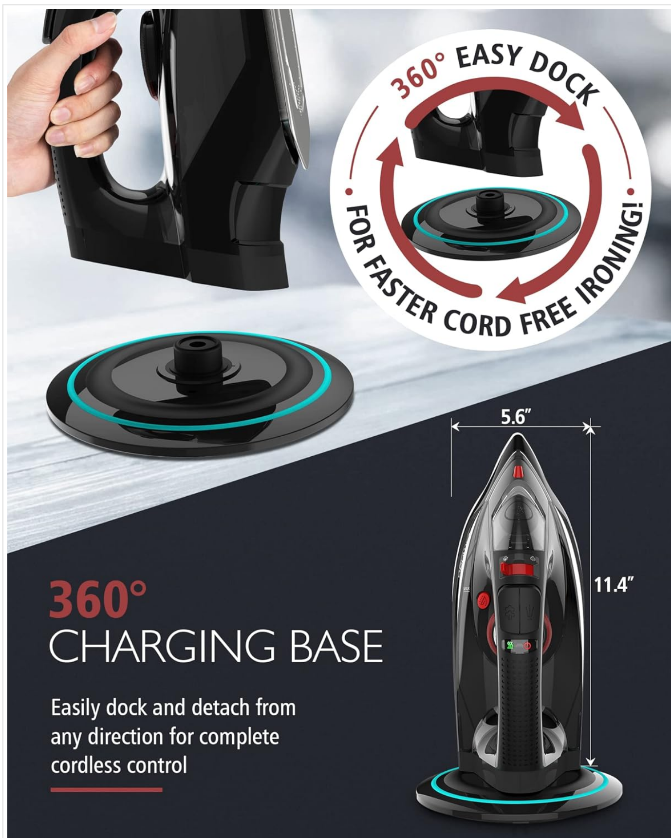
Image: OMAIGA Cordless Steam Iron (black) on its 360-degree charging base, highlighting key features like ceramic soleplate and powerful steam output.