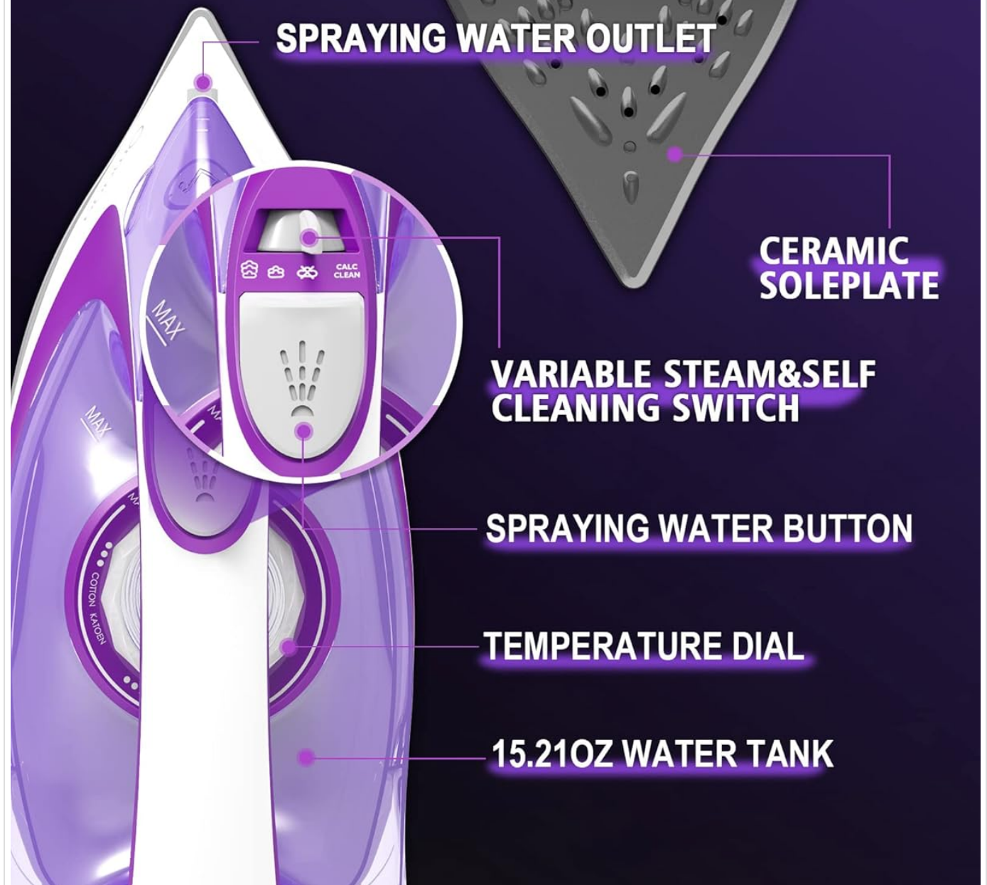
Image: Diagram of the OMAIGA Corded Steam Iron (purple), pointing out key components such as the spraying water outlet, ceramic soleplate, variable steam & self-cleaning switch, spraying water button, temperature dial, and 15.21oz water tank.