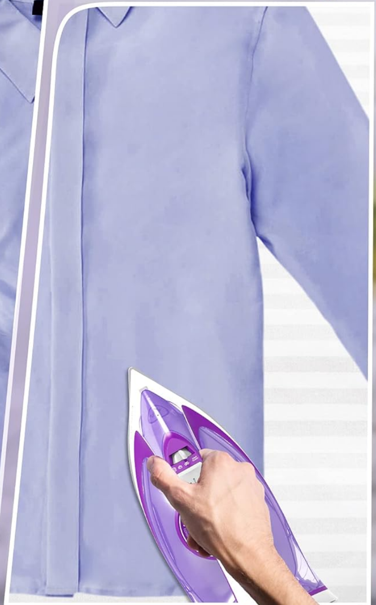
Image: Close-up of the OMAIGA Corded Steam Iron's steam distribution, showing 0.8g/press powerful water spray and 35g/min continuous steam output.