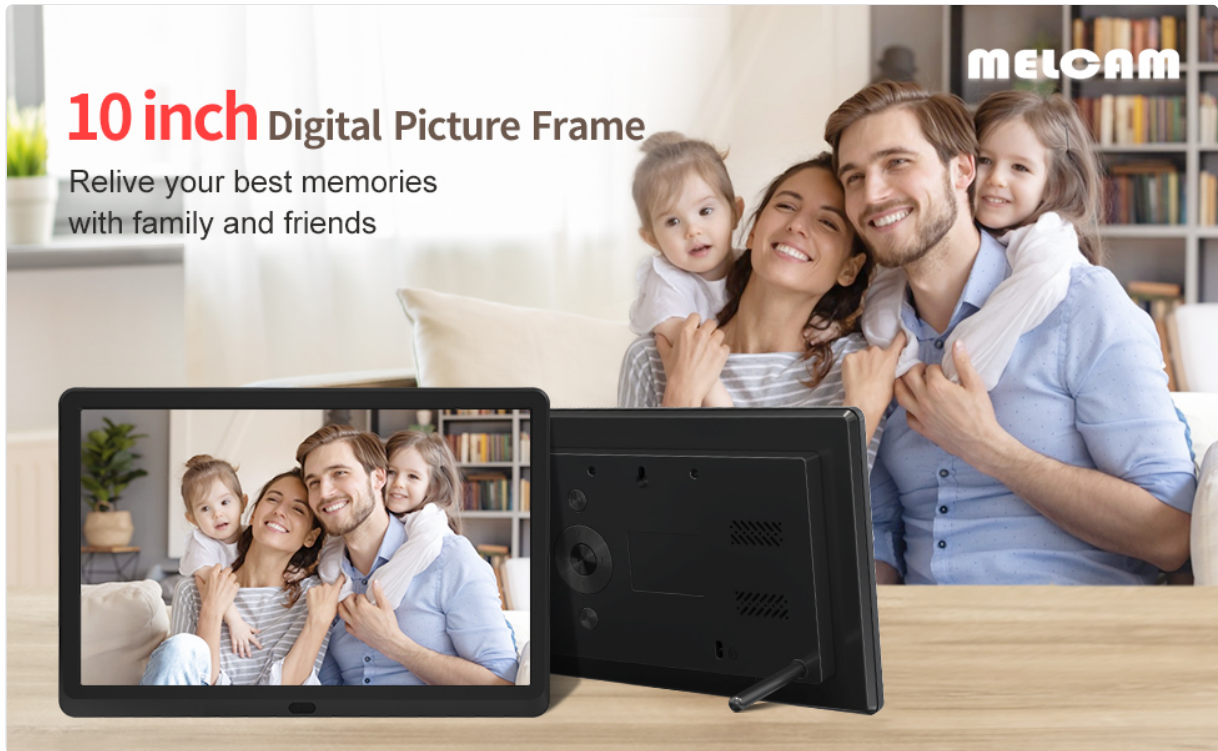
Image: The frame's 178° wide viewing angle ensures clear visibility from various positions.