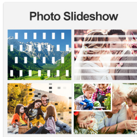
Image: Examples of photo slideshow transition effects.