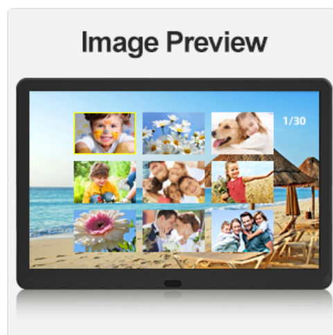
Image: The image preview function displays multiple photo thumbnails for easy selection.