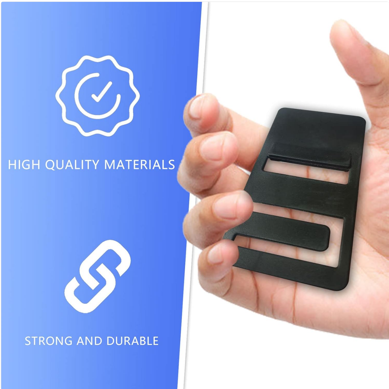
Image 5.1: An image emphasizing the quality of the product, showing an icon for "High Quality Materials" and another for "Strong and Durable" next to a hand holding the black airing device.