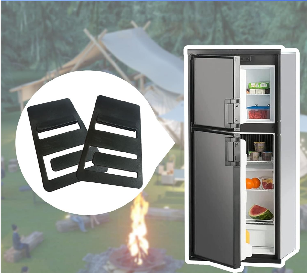
Image 2.2: The Carkio RV Refrigerator Airing Devices shown in context next to an open RV refrigerator, illustrating their intended use in a camping environment.