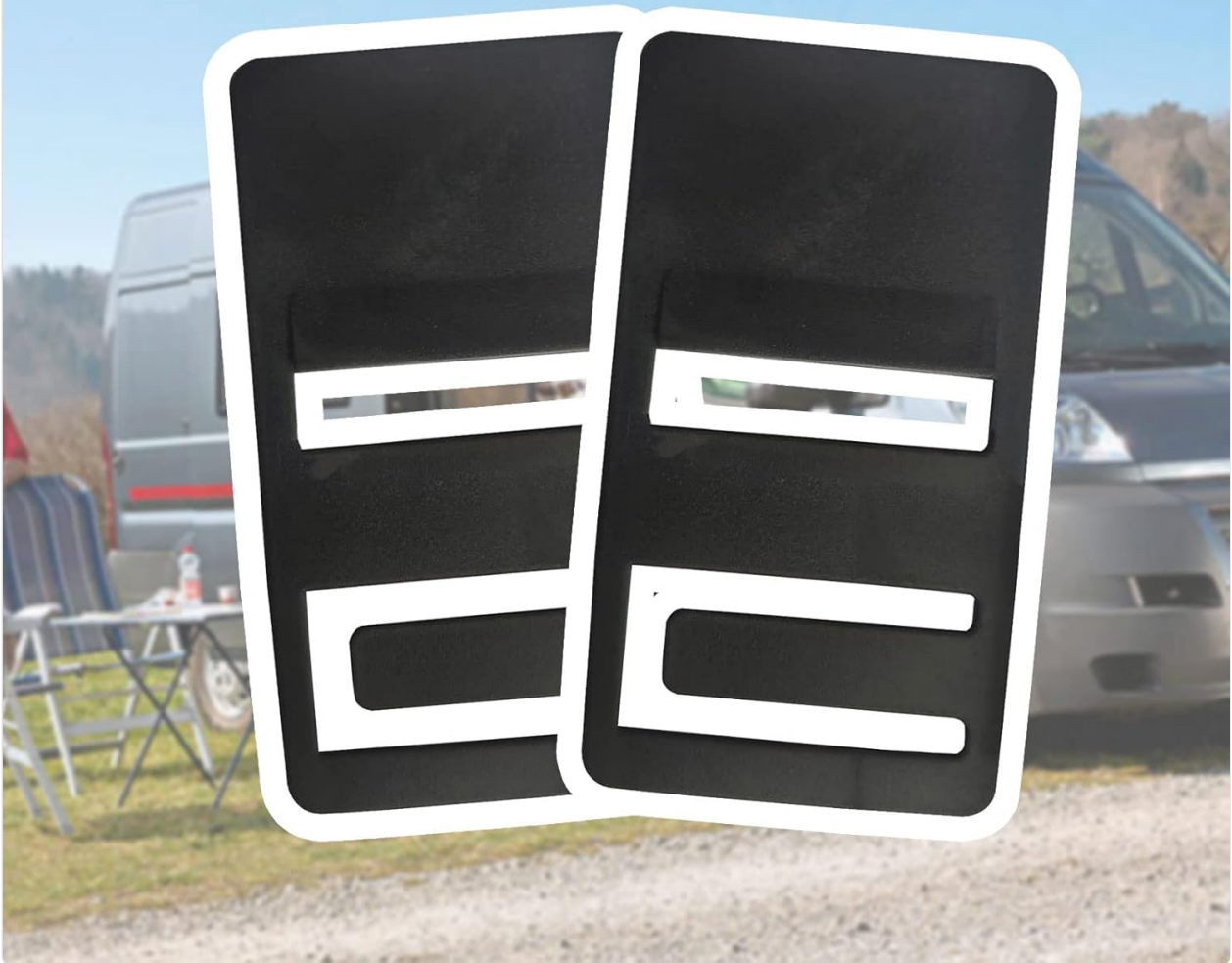
Image 3.2: A close-up view of the Carkio RV Refrigerator Airing Device installed on the side of an RV refrigerator door, holding it slightly open. The device is black and fits snugly into the door's edge.