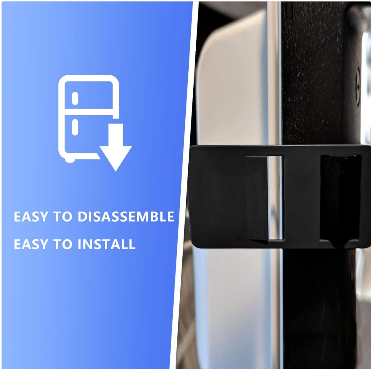
Image 3.1: An illustration demonstrating the ease of installation and disassembly of the Carkio RV Refrigerator Airing Device. It shows an icon of a refrigerator with a downward arrow, indicating simple setup.