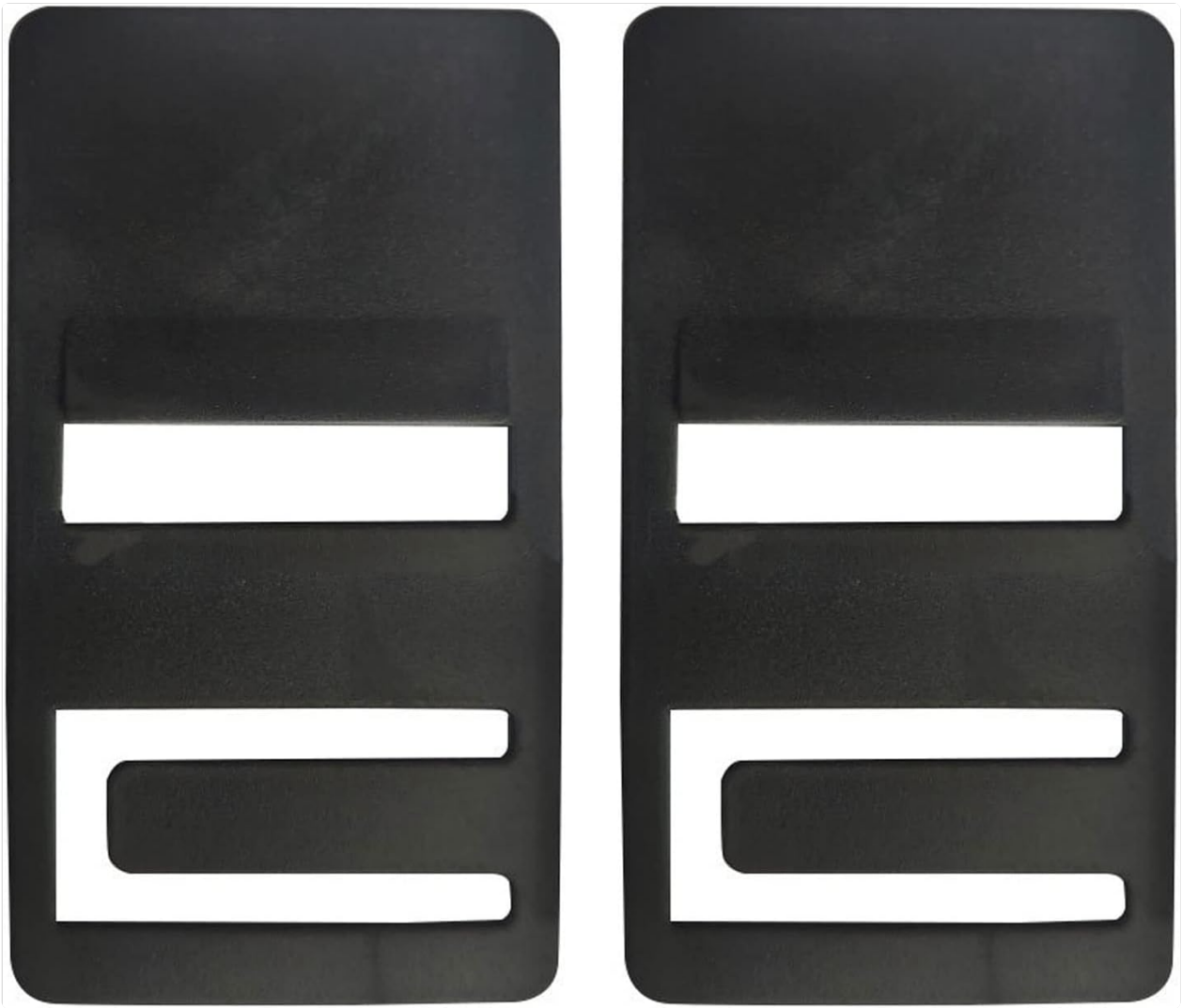
Image 2.1: Two Carkio RV Refrigerator Airing Devices. These black, rectangular devices feature cutouts designed to prop open an RV refrigerator door.