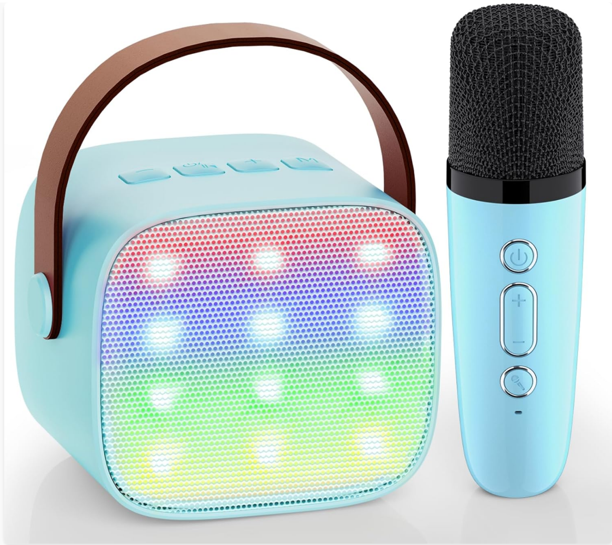
Image: The Wowstar Portable Karaoke Machine and Wireless Microphone, showcasing its compact design and blue color.