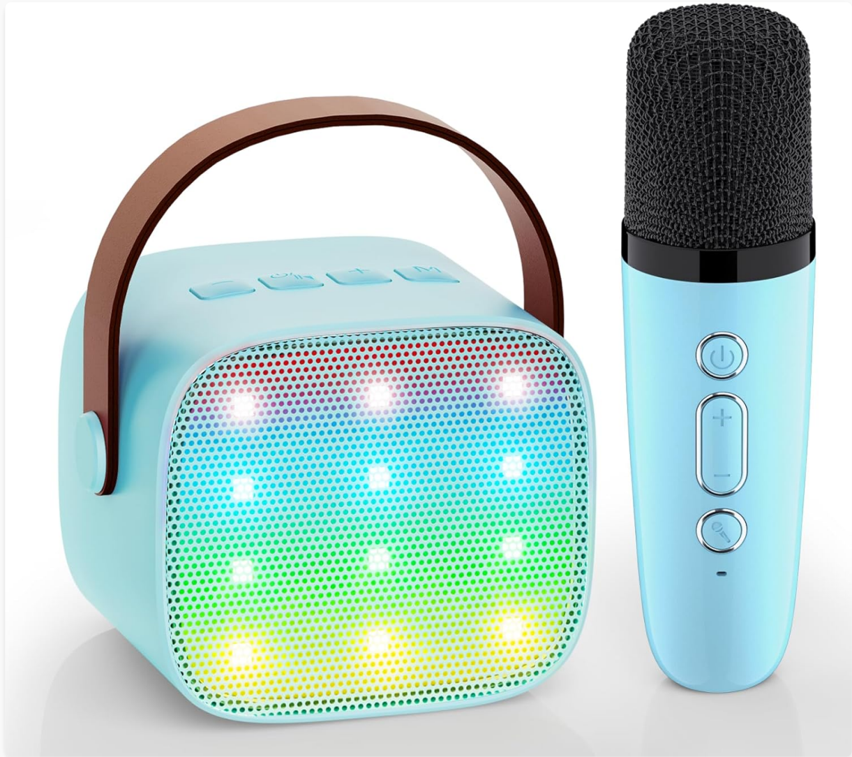
Image: The karaoke speaker with its multi-colored LED lights illuminated.

The speaker features dynamic LED lights that synchronize with the music, creating an engaging atmosphere. These lights can be turned on or off by long-pressing the 'M' button on the speaker.