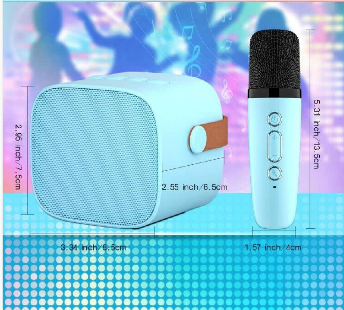
Image: Visual representation of the speaker and microphone dimensions.