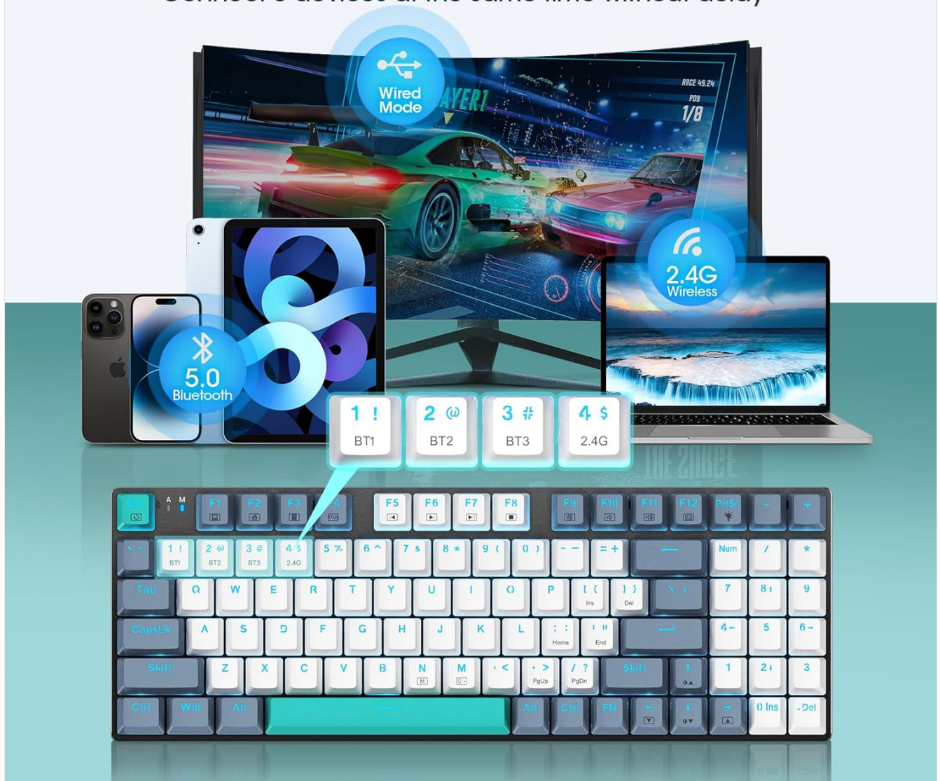
Image: Visual representation of the keyboard's triple-mode connectivity.

Connect 3 devices at the same time without delay