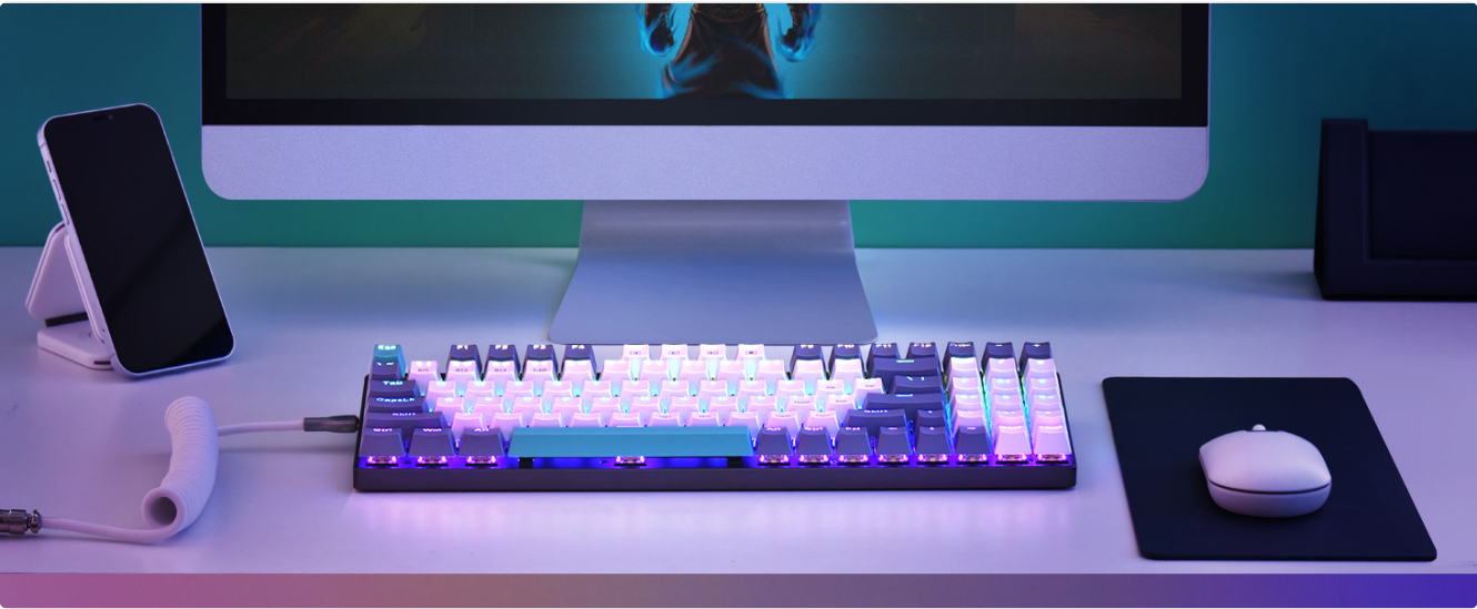
Image: Multimedia shortcuts for enhanced productivity.

The keyboard is designed for comfort during prolonged use: