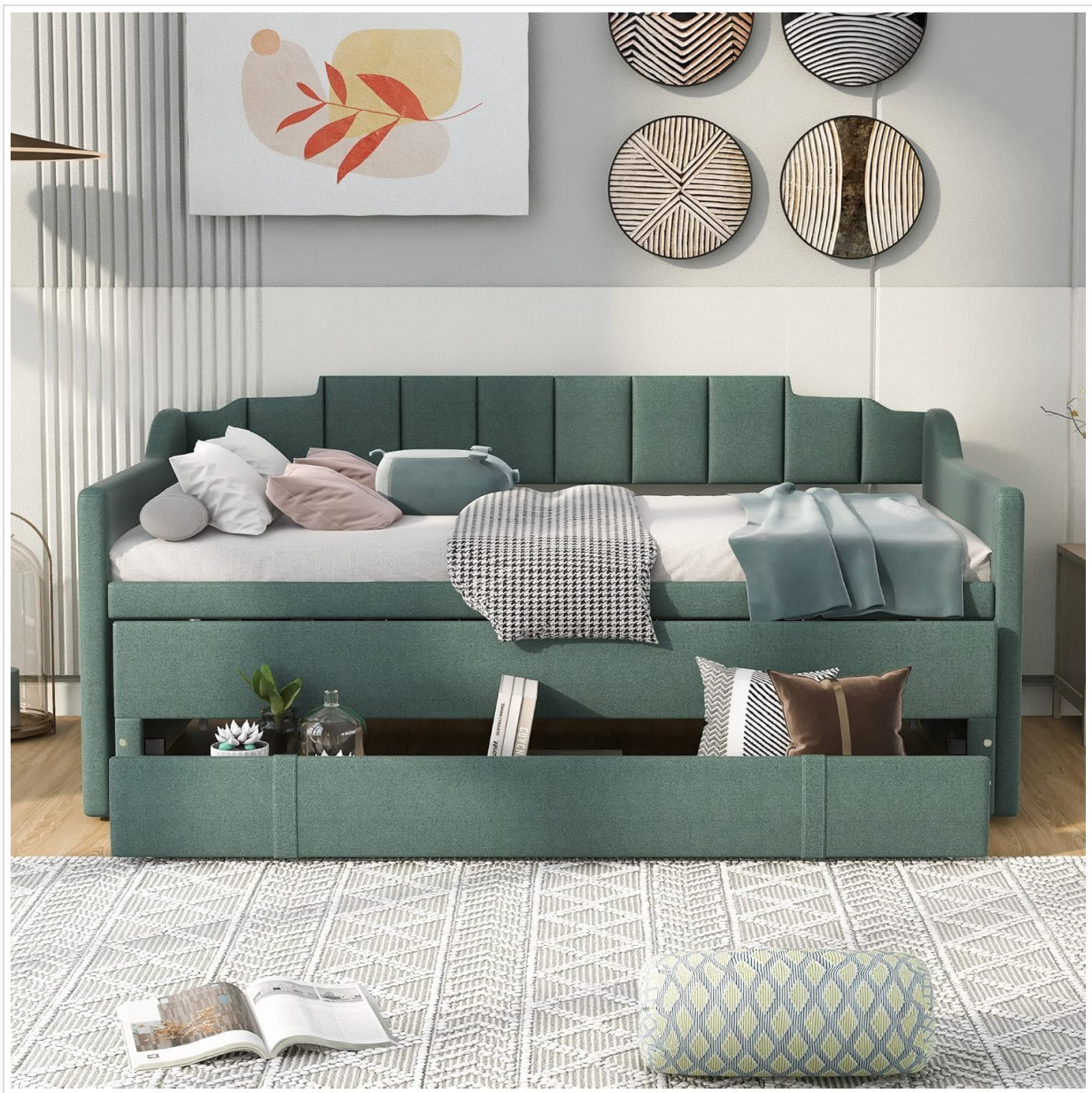
Image 1.1: Assembled Flieks Twin Upholstered Daybed with Trundle and 3 Drawers.

The Flieks Daybed is designed to offer versatile sleeping and seating solutions, featuring a main twin-size bed, a pull-out twin trundle, and three integrated storage drawers. Its upholstered design provides comfort and a modern aesthetic.