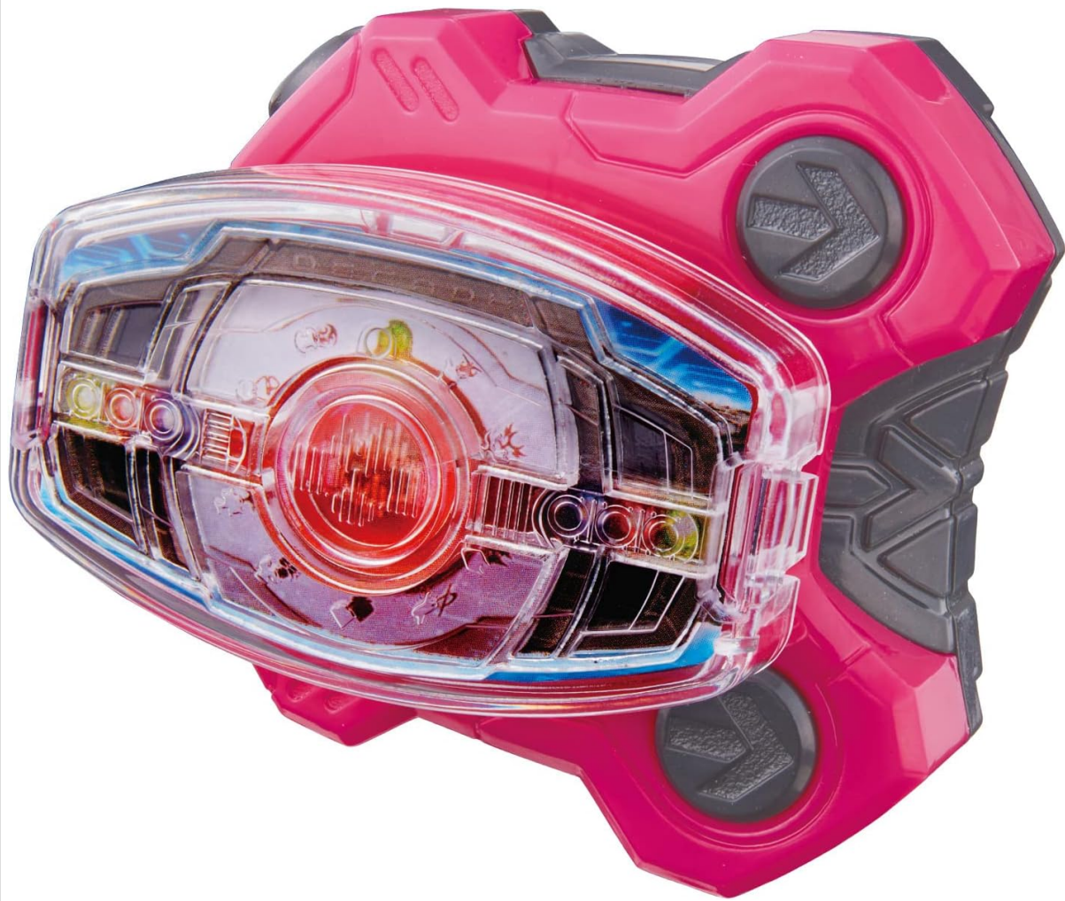
Image: A close-up view of the pink DecaDriver Raise Buckle, highlighting its intricate design.