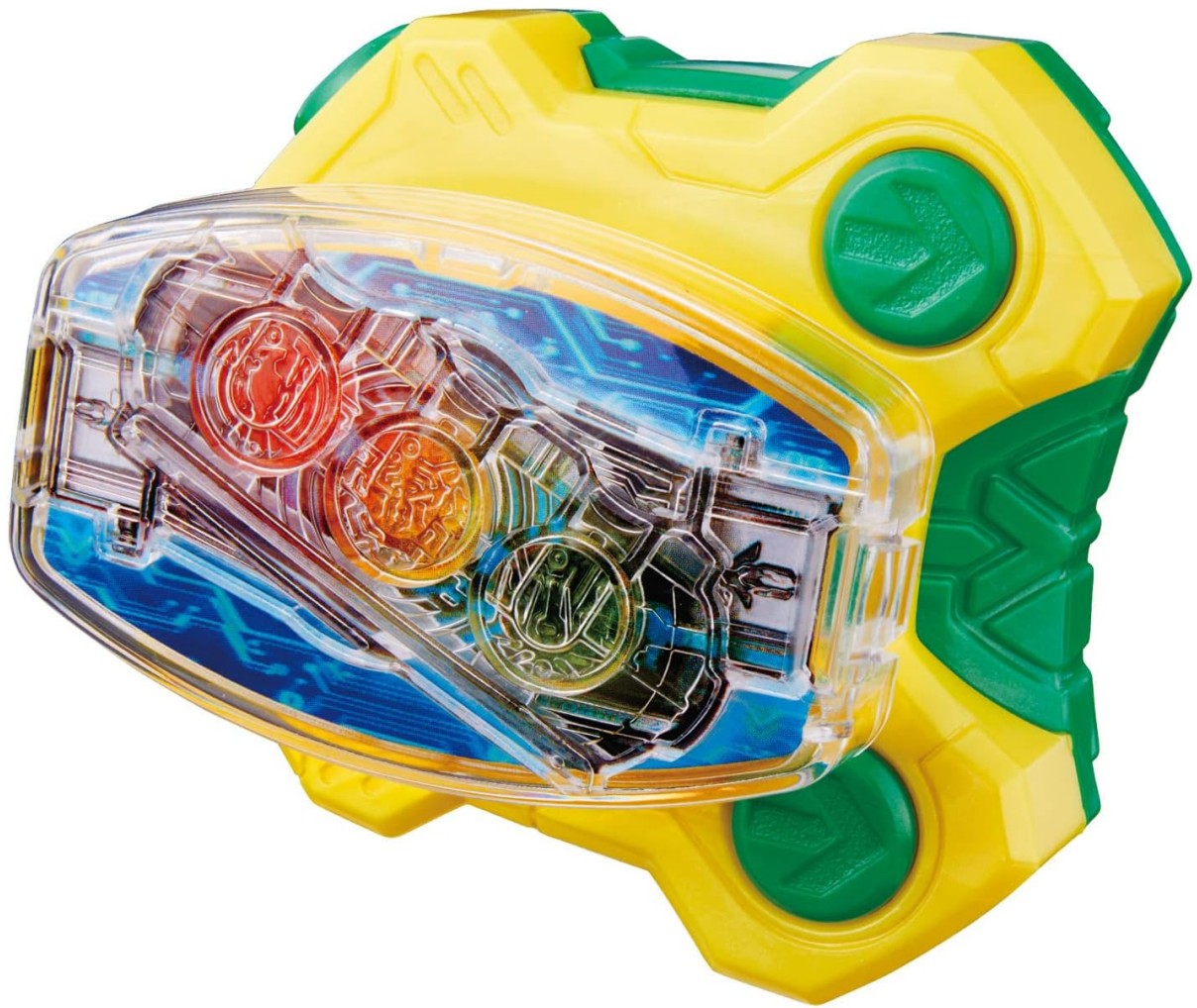
Image: A close-up view of the yellow OOO Driver Raise Buckle, showcasing its unique coin-like elements.