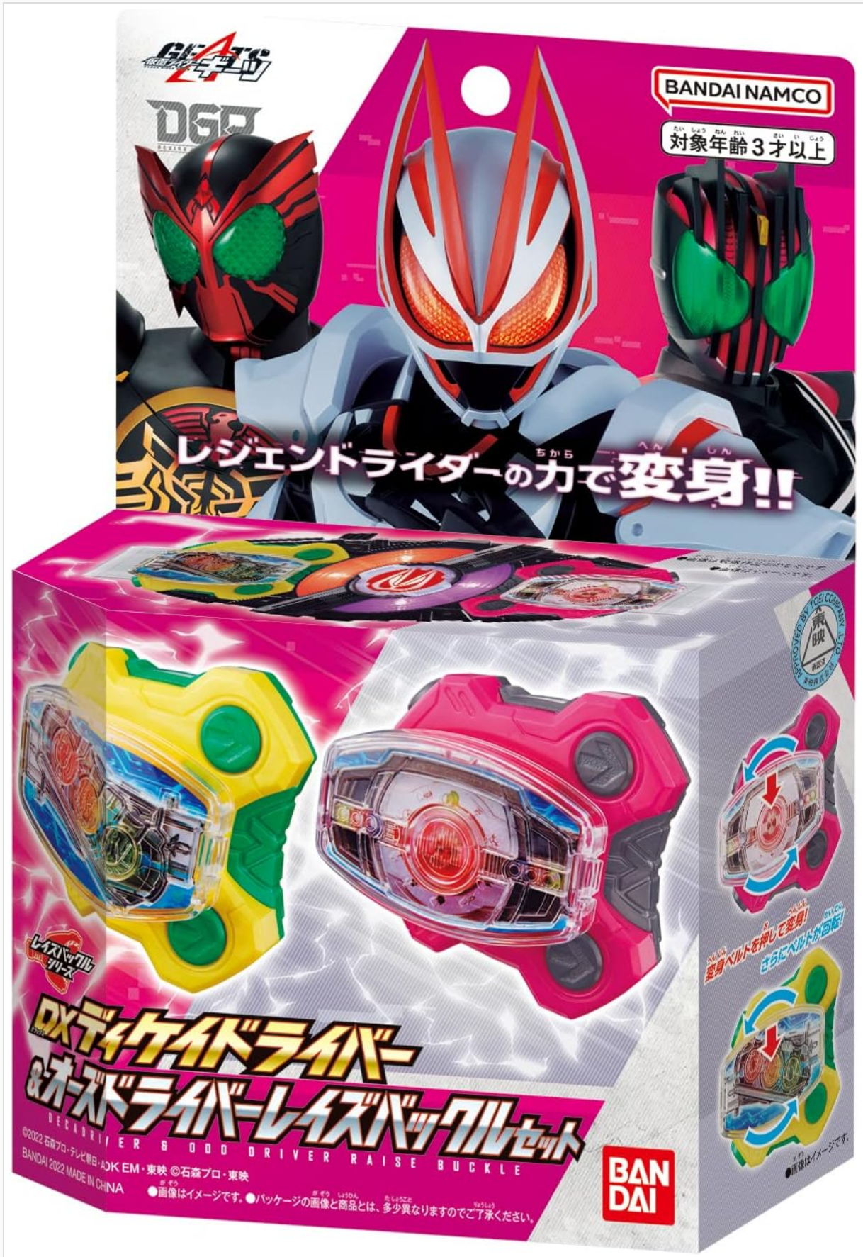
Image: The BANDAI Kamen Rider Geats DecaDriver & OOO Driver Raise Buckle Set in its retail packaging, showing both buckles.

To begin playing, you will need the Transformation Belt DX Designer Driver (sold separately).