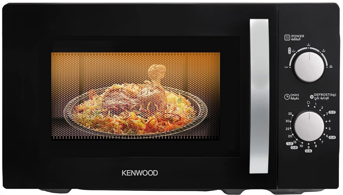
Front view of the KENWOOD 20L Microwave Oven, showing food being heated inside.