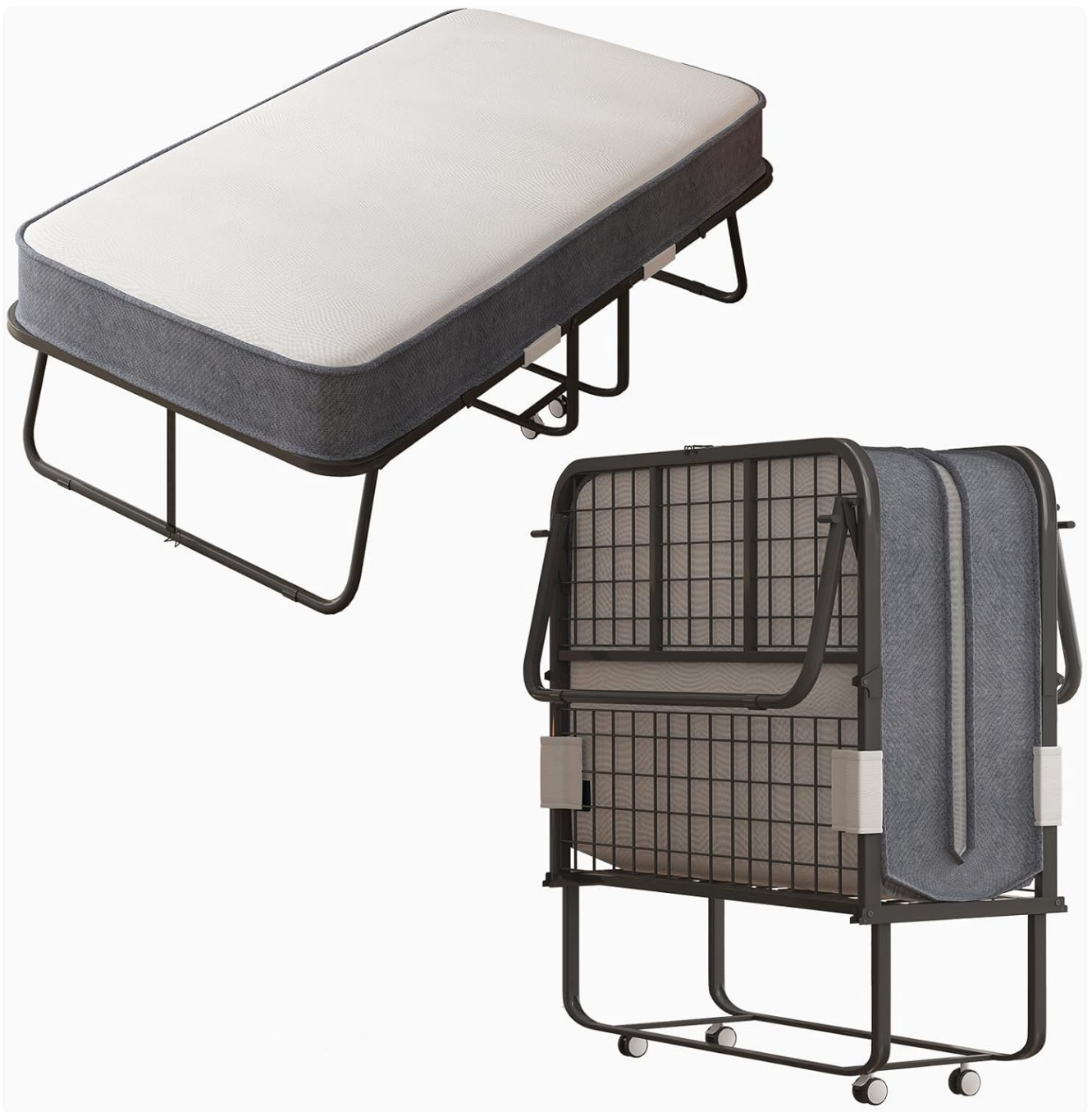
Image: The Mjkone Folding Bed shown both fully extended with mattress and compactly folded for storage.