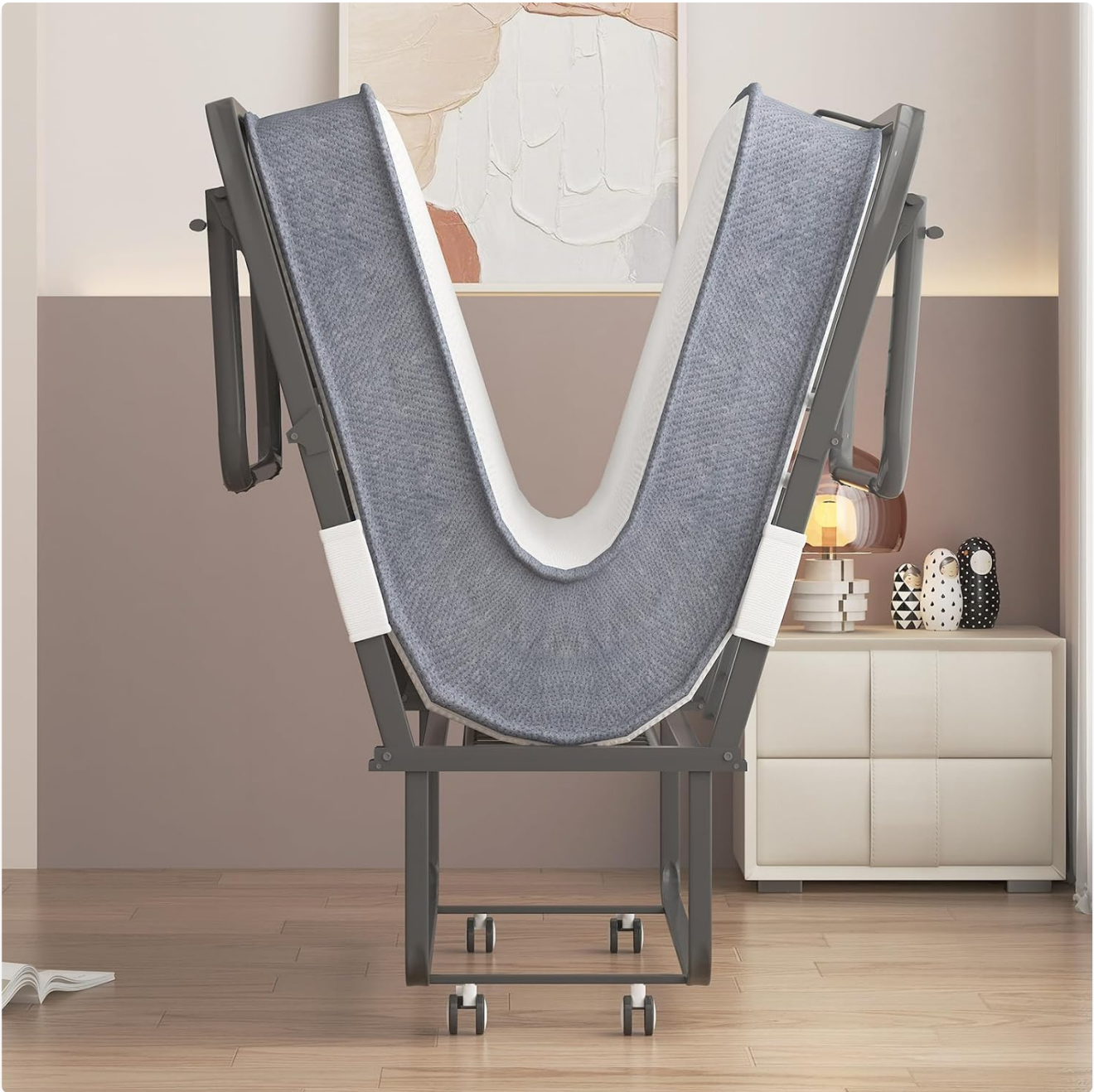
Image: The folding bed in its compact, upright storage position, ready to be rolled away.