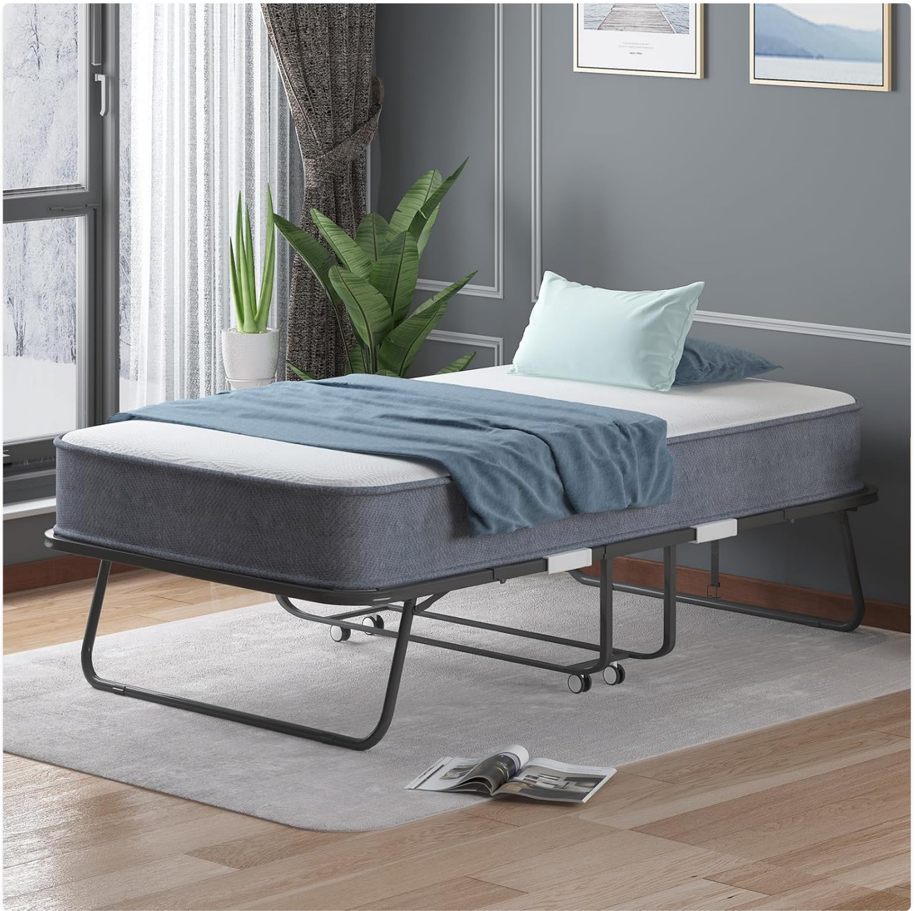
Image: The Mjkone Folding Bed unfolded and ready for use in a bedroom setting.