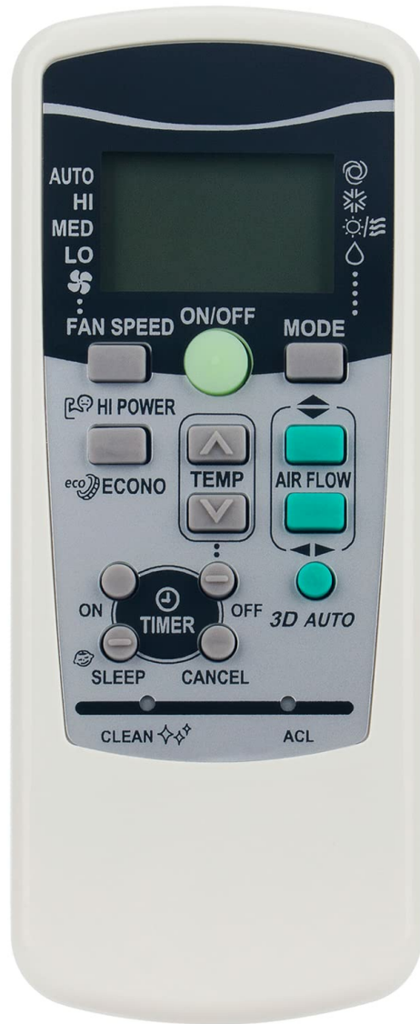
Image: Front view of the VINABTY RKX502A001 replacement remote control, showing its LCD screen and various function buttons.