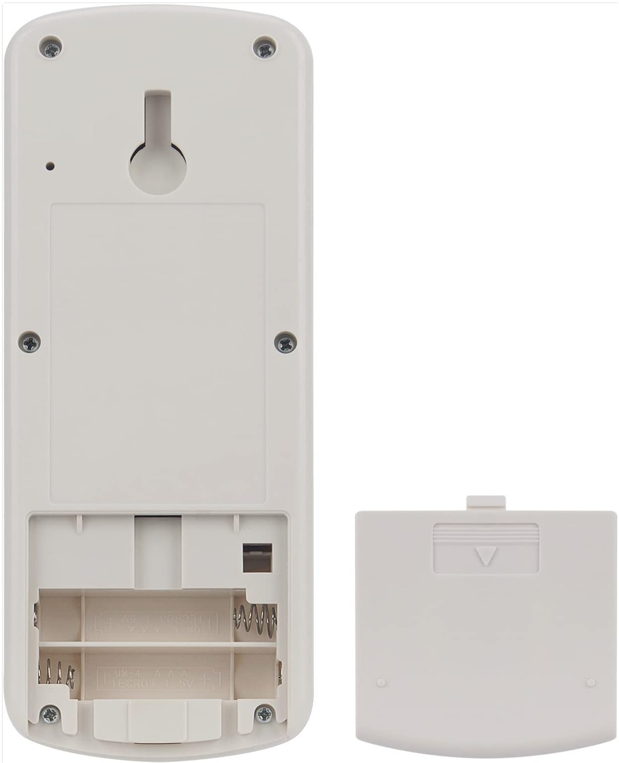
Image: Back view of the remote control with the battery cover removed, clearly showing the two AAA battery slots and polarity markings.