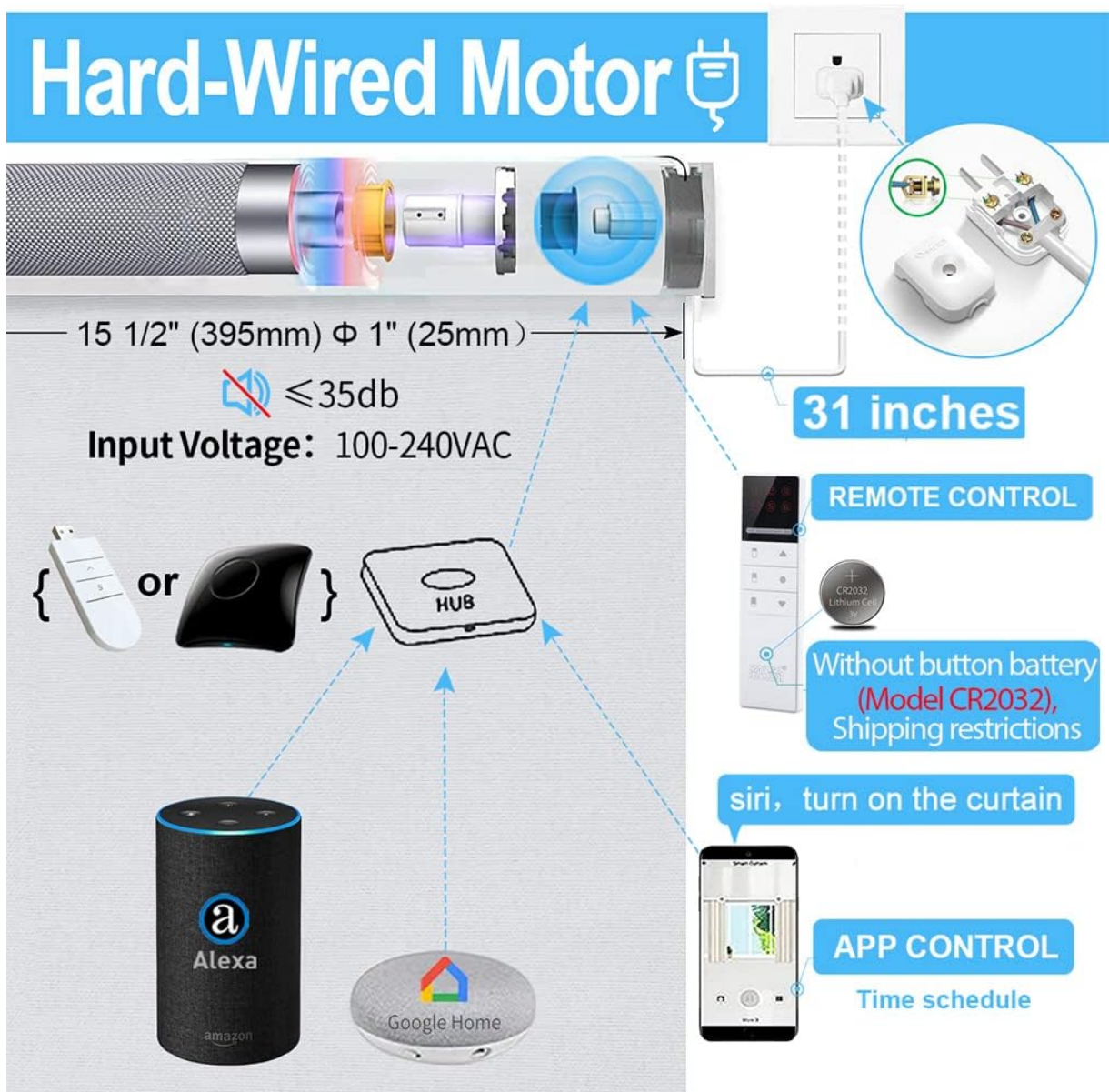
Figure 3: Hard-Wired Motor and Control System Overview