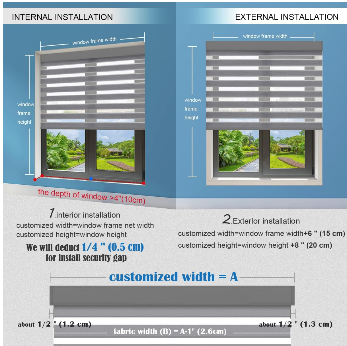
Figure 1: Internal and External Installation Measurement Guide

Proper installation is crucial for the optimal performance of your motorized blinds. Choose between inside or outside mounting based on your window frame and aesthetic preference.