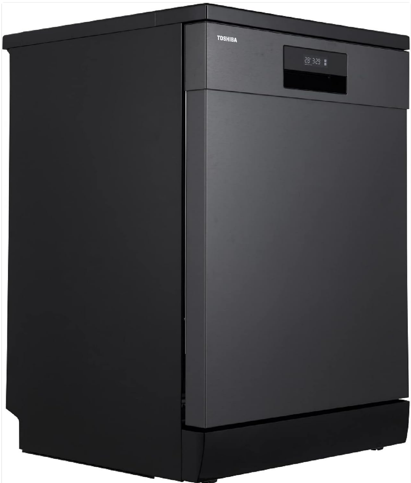
Figure 3.1: Side view of the Toshiba DW-15F3ME(BS) Dishwasher. This view helps in assessing placement requirements and clearances.