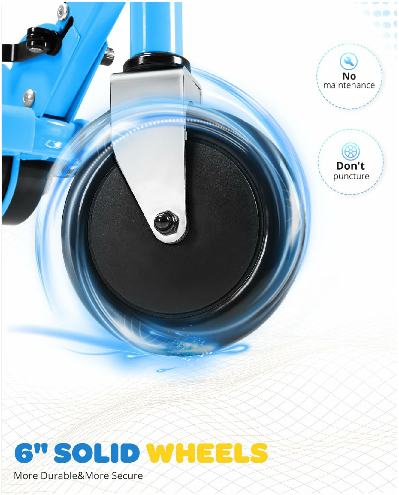
Image: A close-up view of the 6-inch solid wheel, highlighting its durable, maintenance-free, and puncture-resistant design.