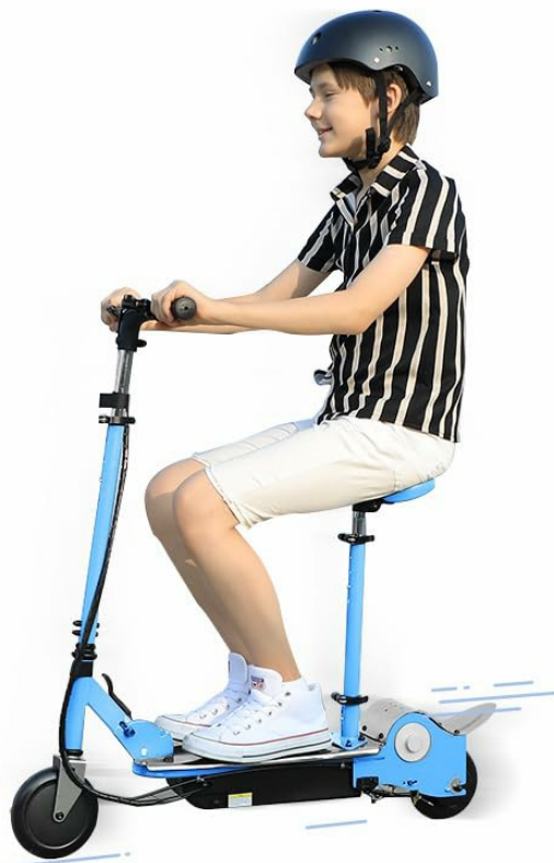
Image: Illustration of the two available riding styles for the MAXTRA E120 Electric Scooter: standing without the seat and seated with the seat attached.