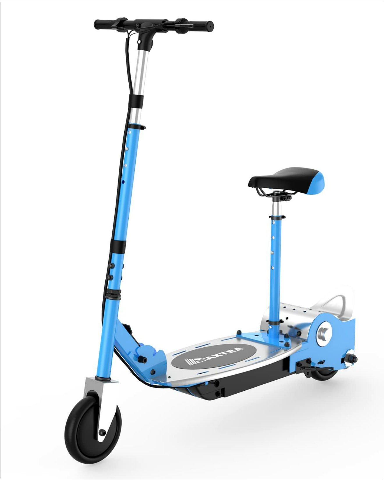
Image: The MAXTRA E120 Electric Scooter shown with the removable seat attached, ready for use.