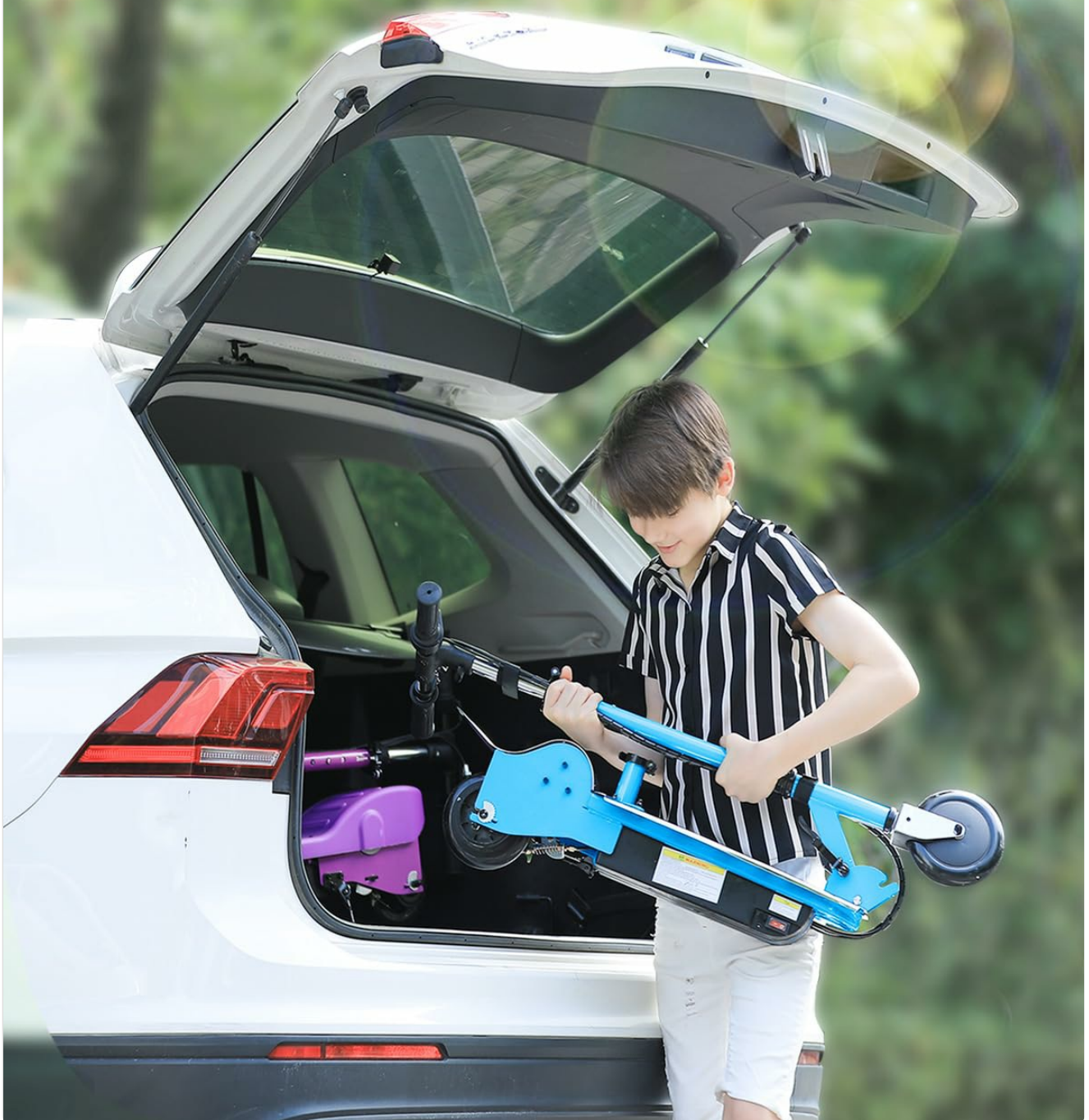
Image: A child demonstrating how the MAXTRA E120 Electric Scooter can be folded for easy storage and transport, fitting into a car trunk.