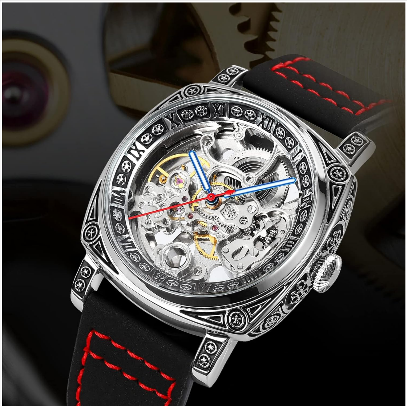
Figure 2: Watch crown for winding and setting time

The crown is used for both manual winding and setting the time. Ensure it is fully pushed in after setting to maintain water resistance.