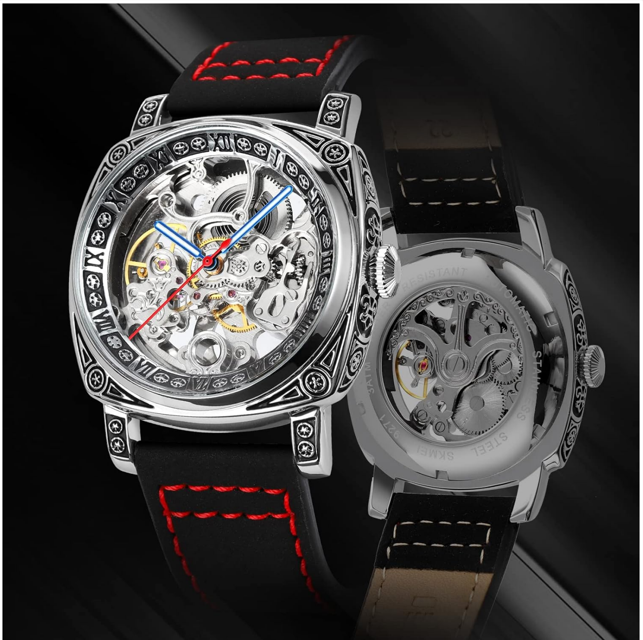
Figure 3: View of the watch's automatic movement through the transparent case back.

The transparent case back allows observation of the watch's intricate mechanical components, emphasizing the importance of proper care to maintain its functionality.