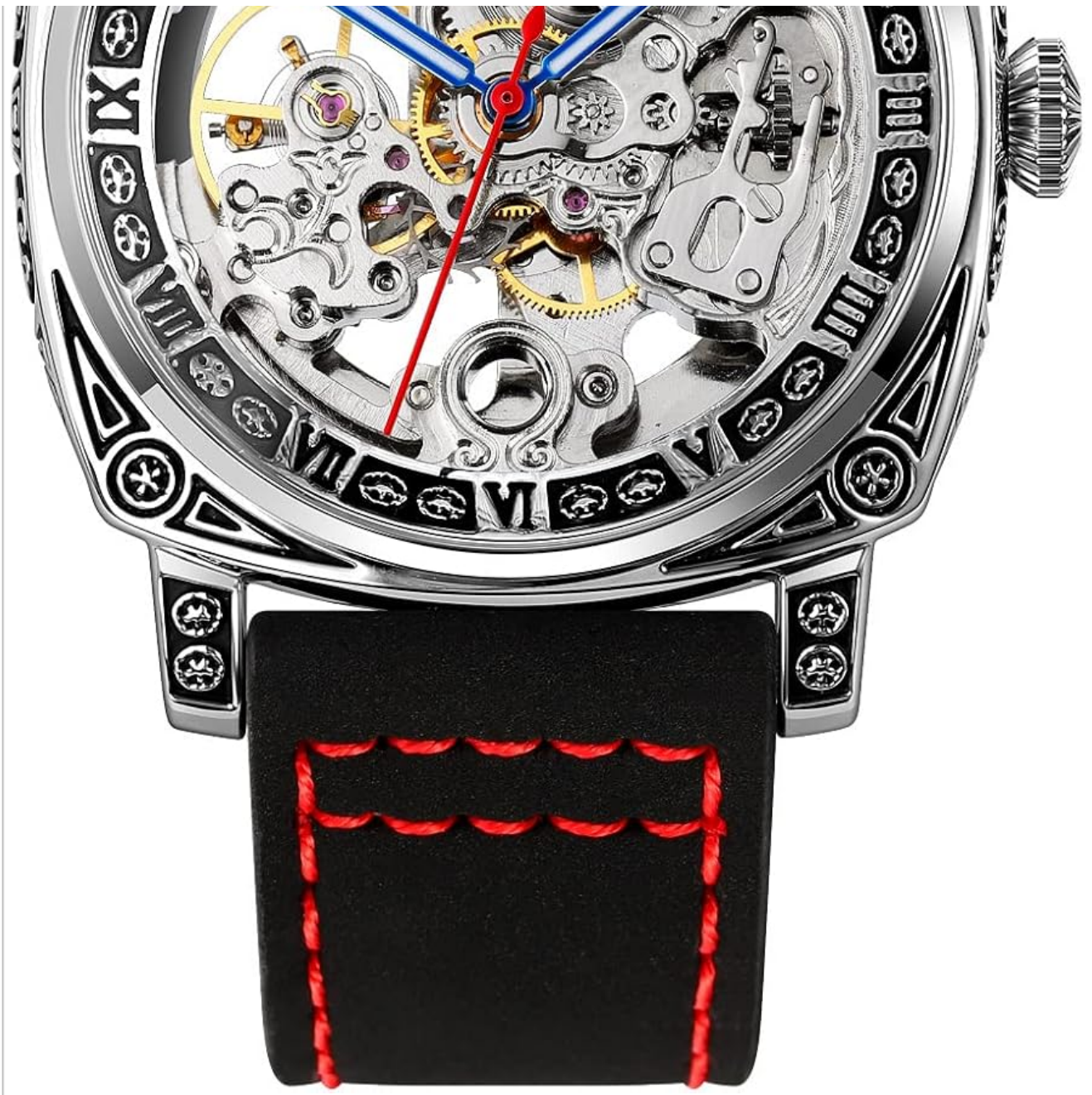
Figure 1: SKMEI Mechanical Wrist Watch (Red variant)

The SKMEI Mechanical Wrist Watch features a distinctive silver skeleton dial, allowing a clear view of its intricate automatic movement. It is complemented by a durable leather band with contrasting red stitching, and a robust zinc alloy case with detailed carvings.