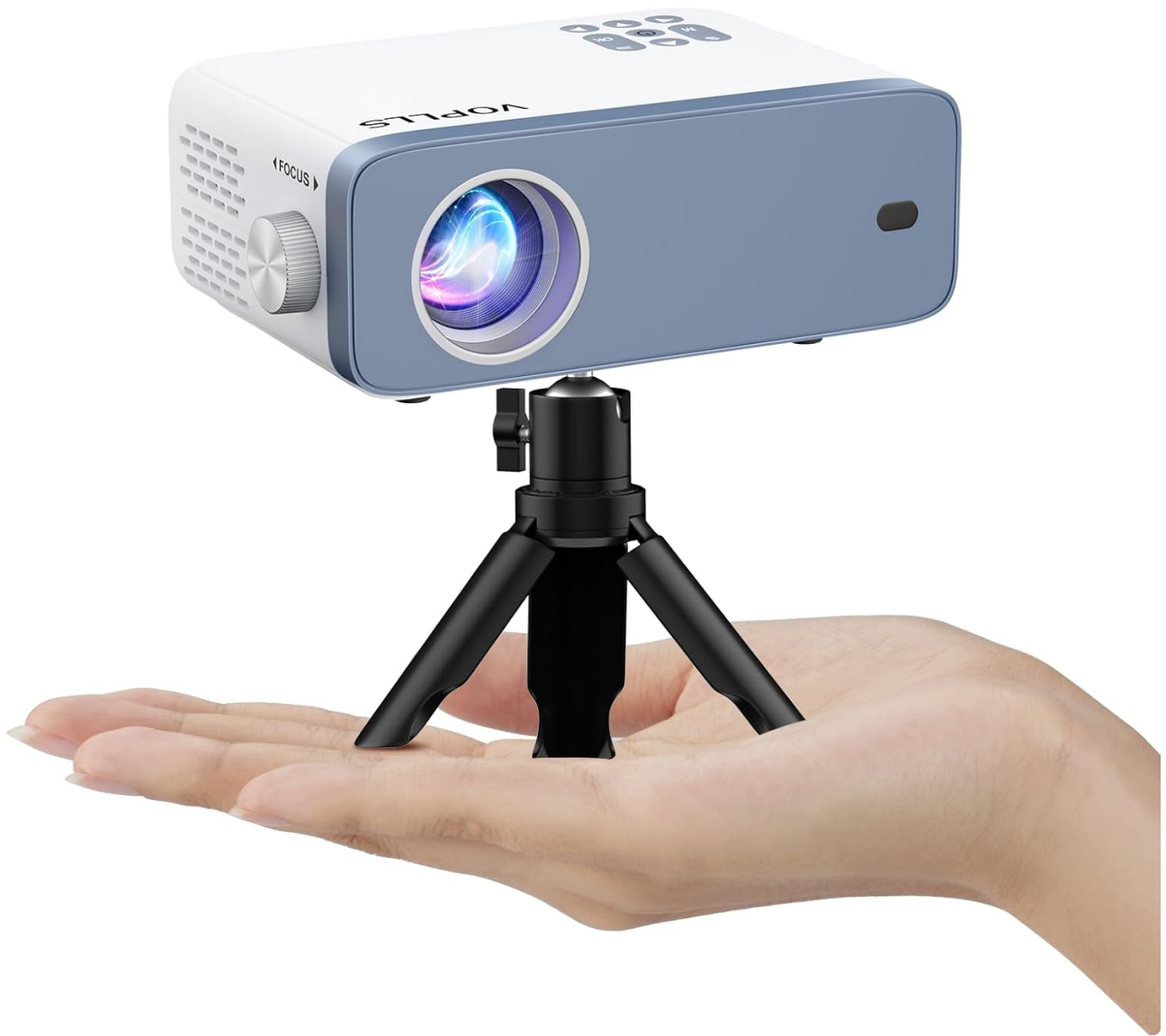
Figure 1: The compact VOPLLS Mini Projector with its included tripod.