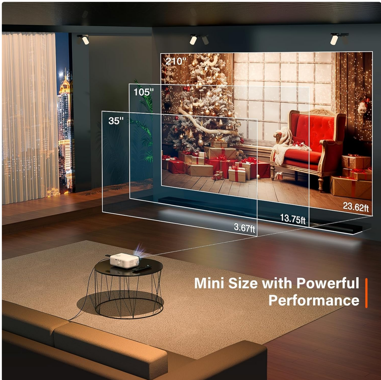
Figure 4: Illustrates the large projection size capabilities of the projector.

headsets or speakers to the audio output port.