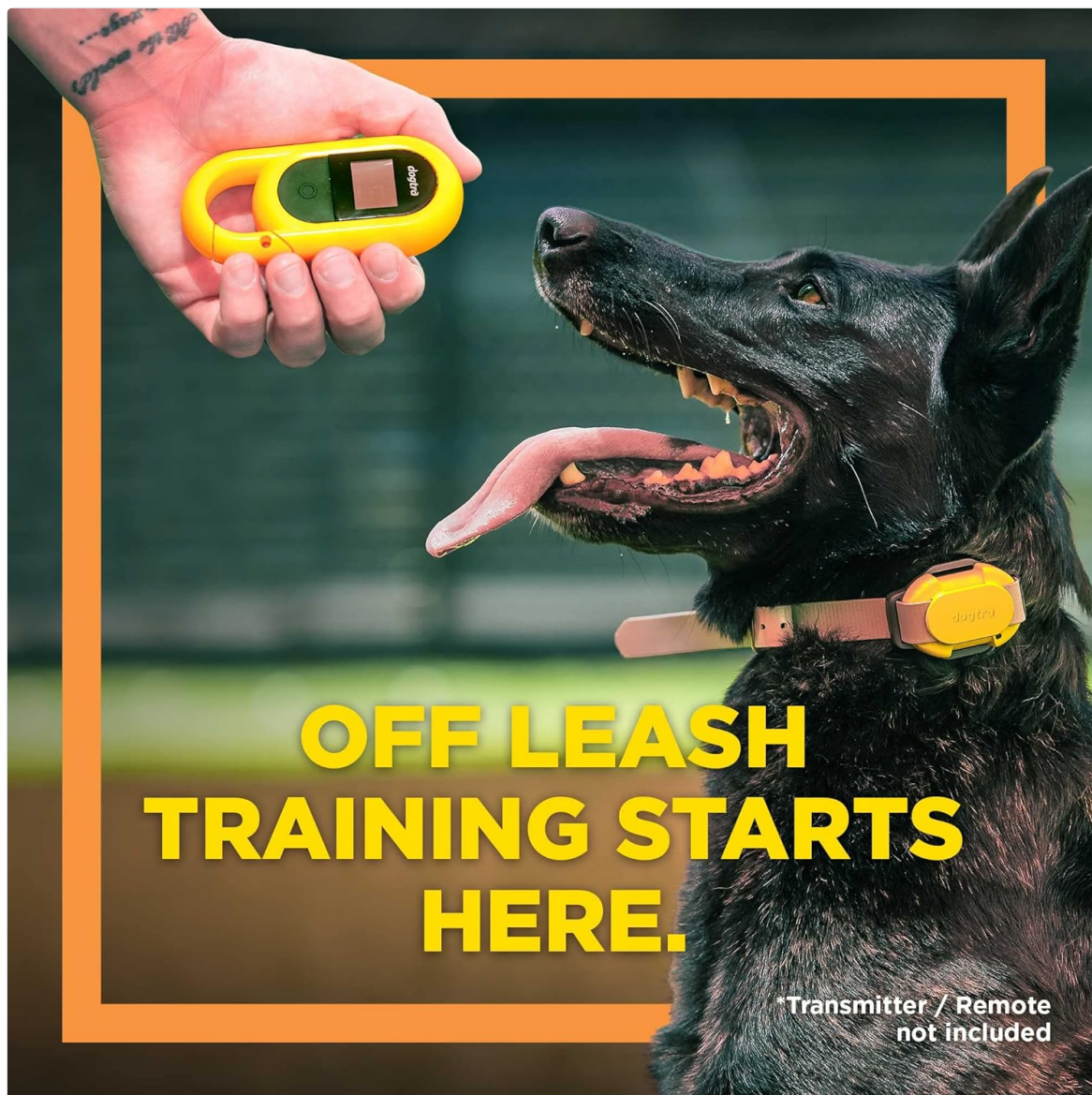
Image: The Dogtra CUE system is designed for individual dog needs, offering tailored training settings.