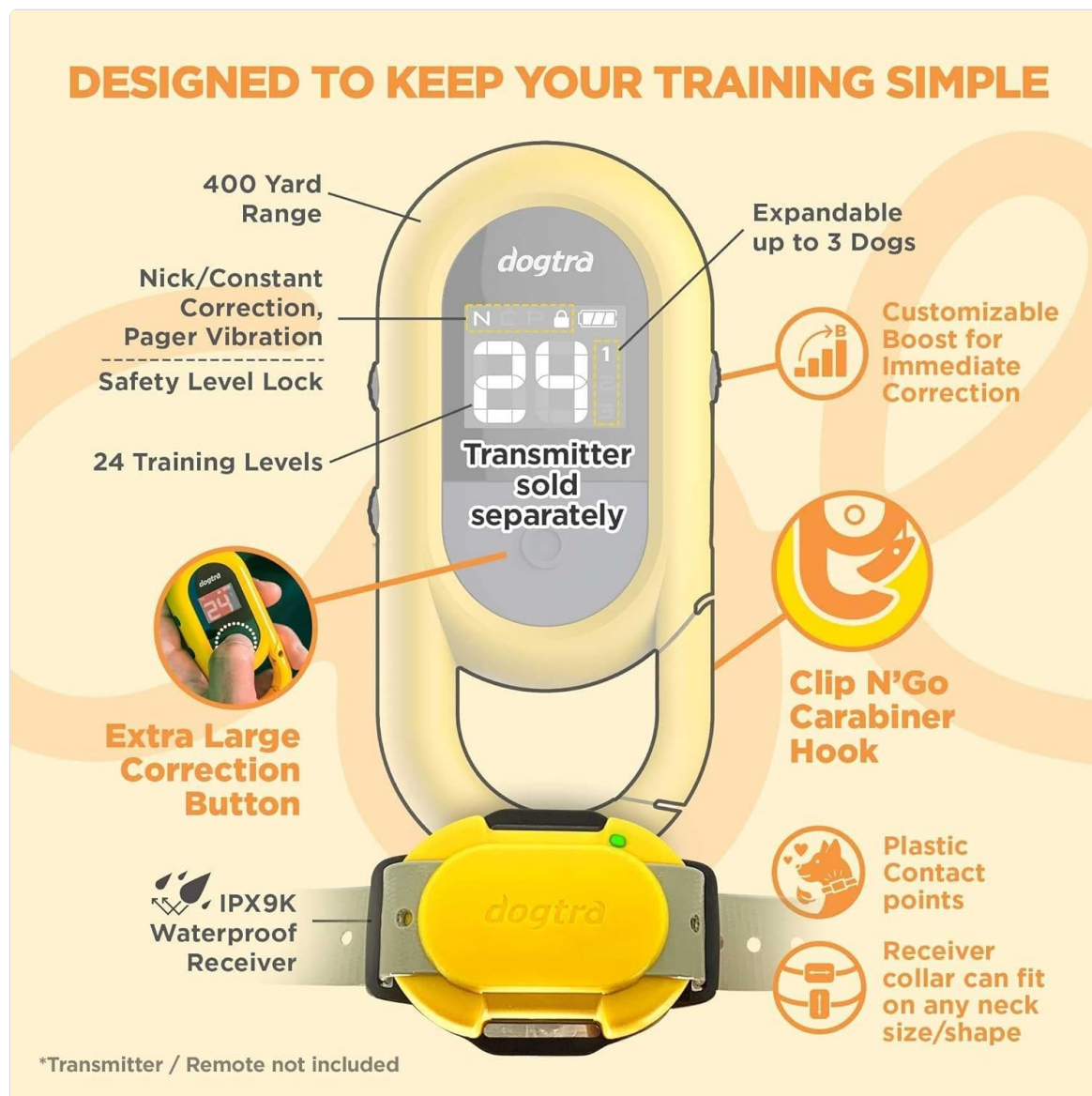
Image: Overview of Dogtra CUE system features.

receiver responds to commands from the CUE transmitter.