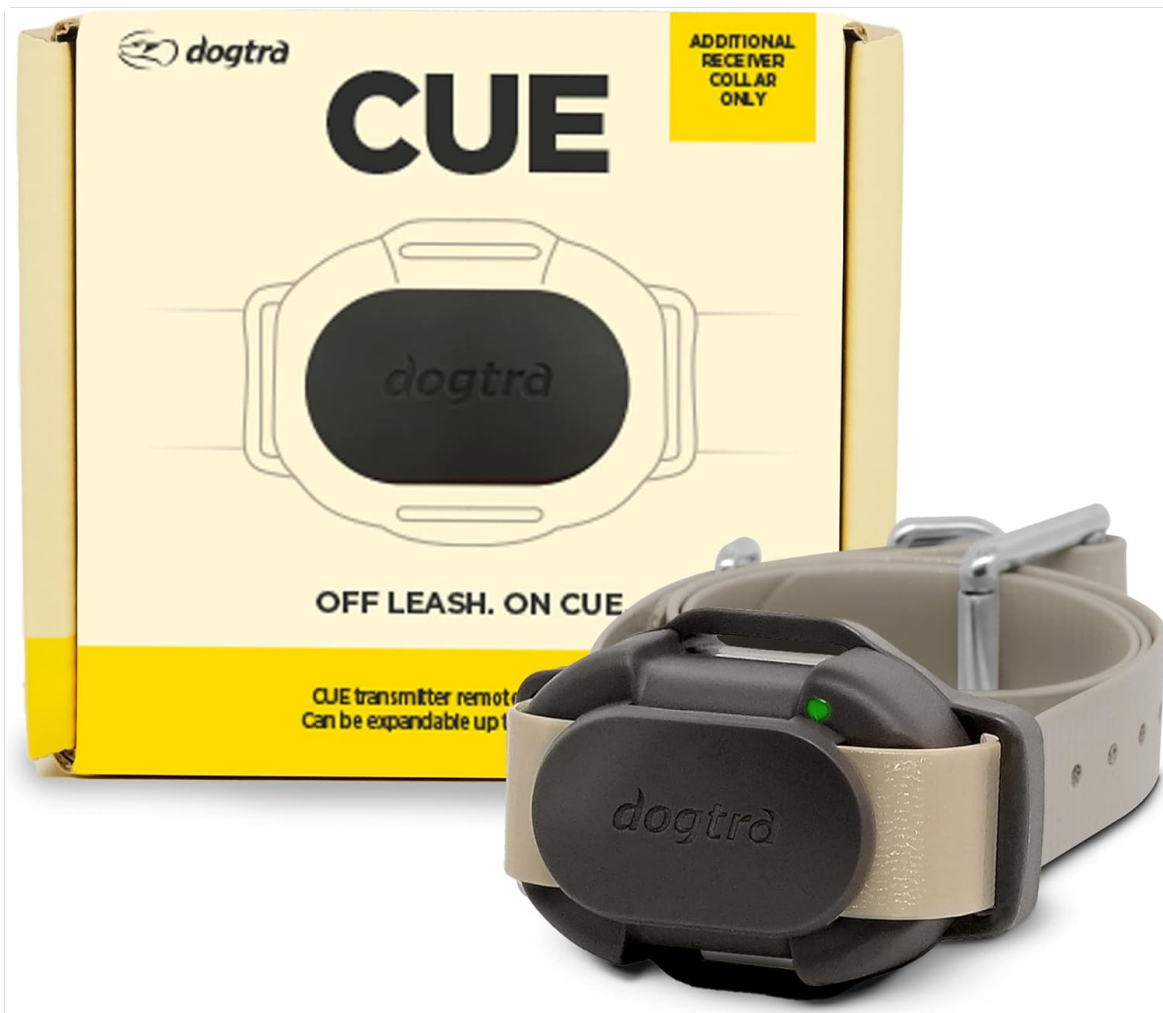
Image: The Dogtra CUE Add-On E-Collar receiver and its packaging, indicating it is an additional receiver collar only.