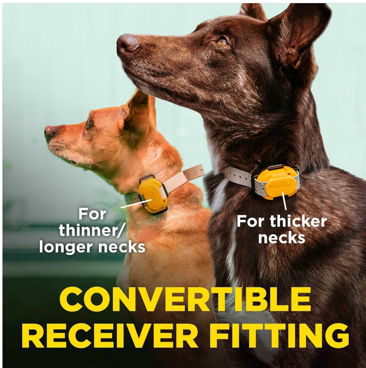
Image: Convertible receiver fitting options for different dog neck types.