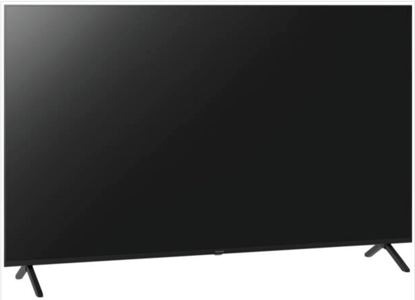
Image: Front view of the Panasonic TX-65LXW834 65-inch TV with its stand. The television is black with a slim bezel and two feet supporting it from below.