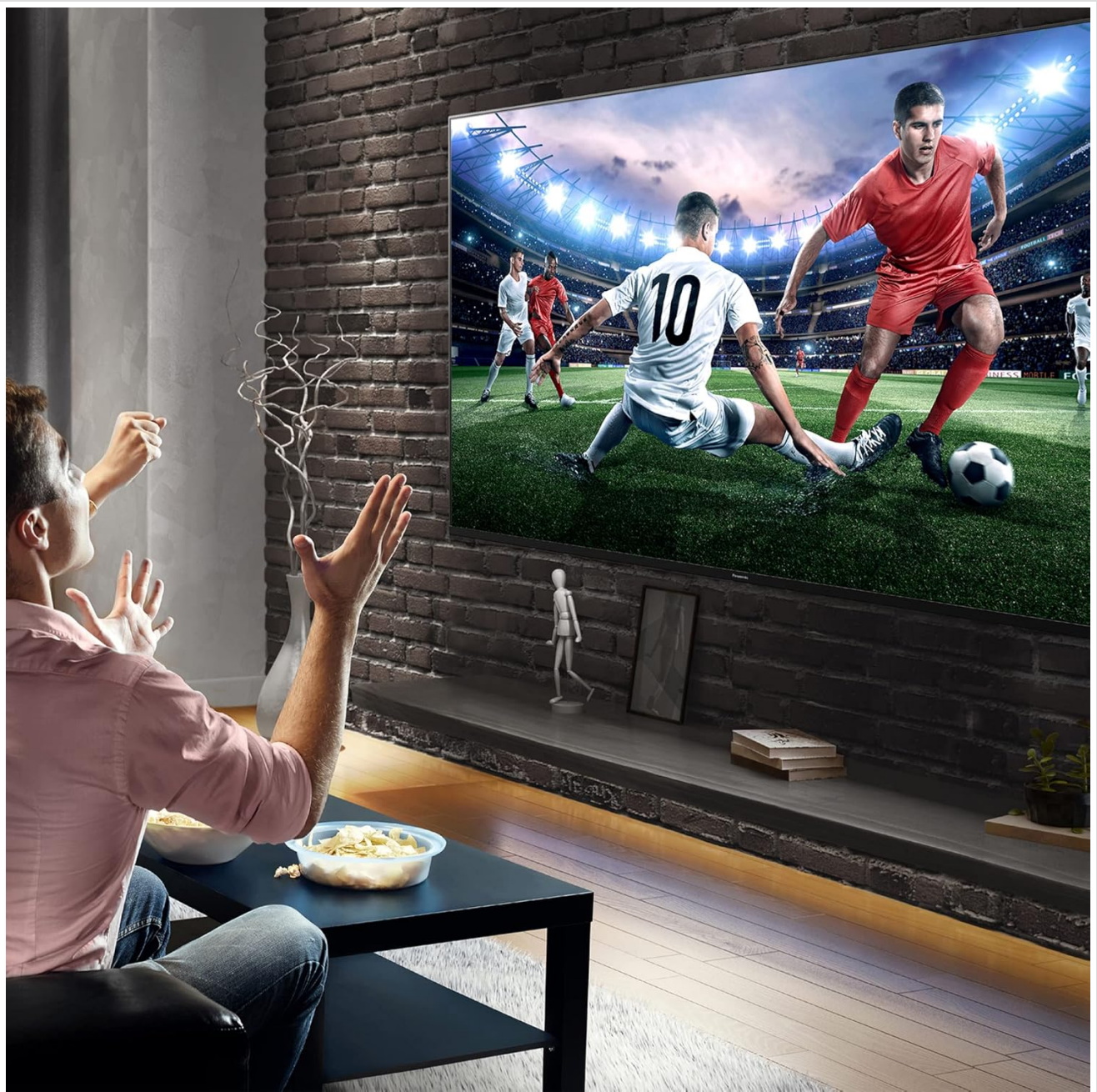
Image: A person watching a soccer game on the Panasonic TX-65LXW834 TV, illustrating the viewing experience.