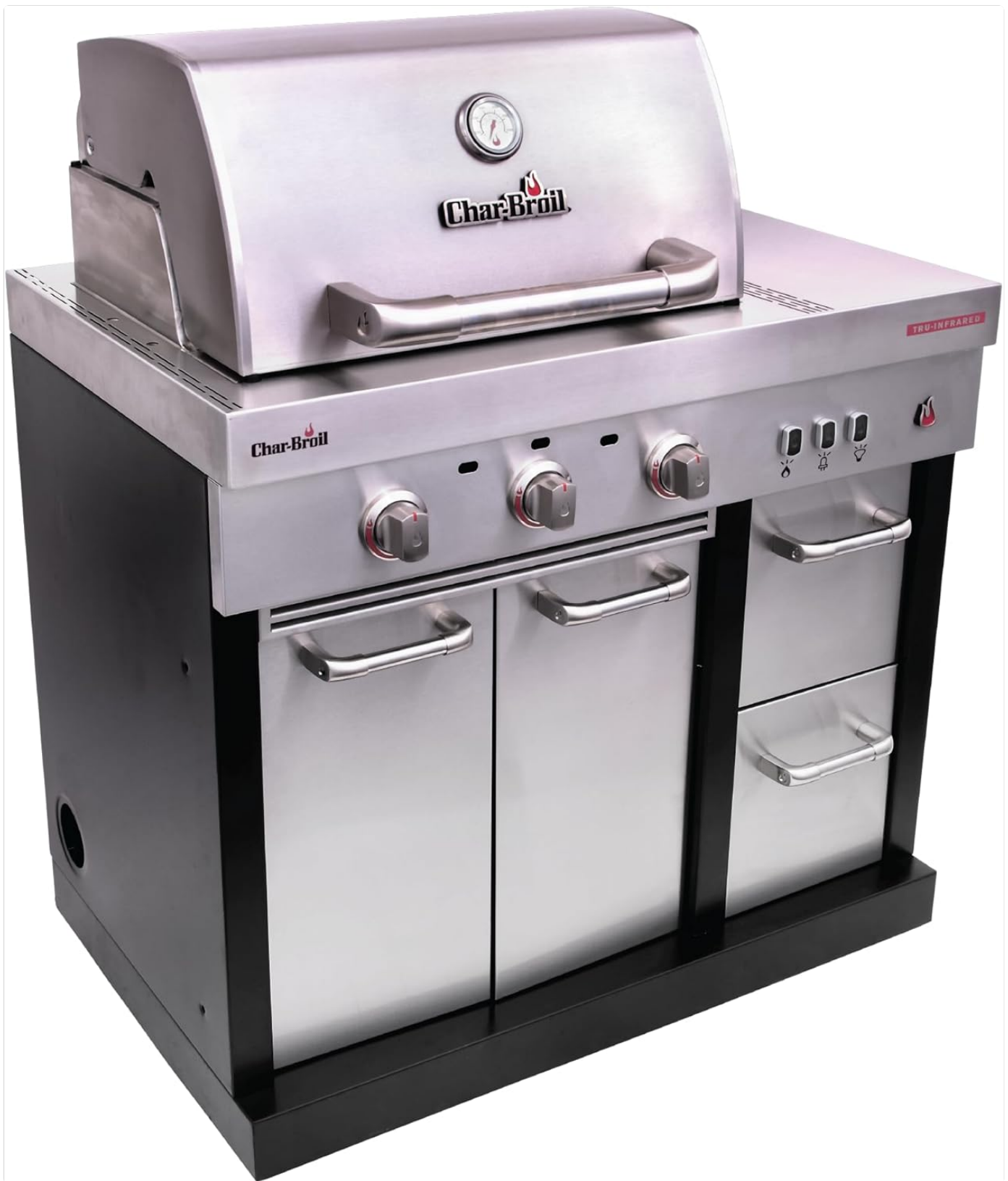
Figure 1.1: Front view of the Charbroil Medallion Series 3-Burner Gas Grill with lid closed.