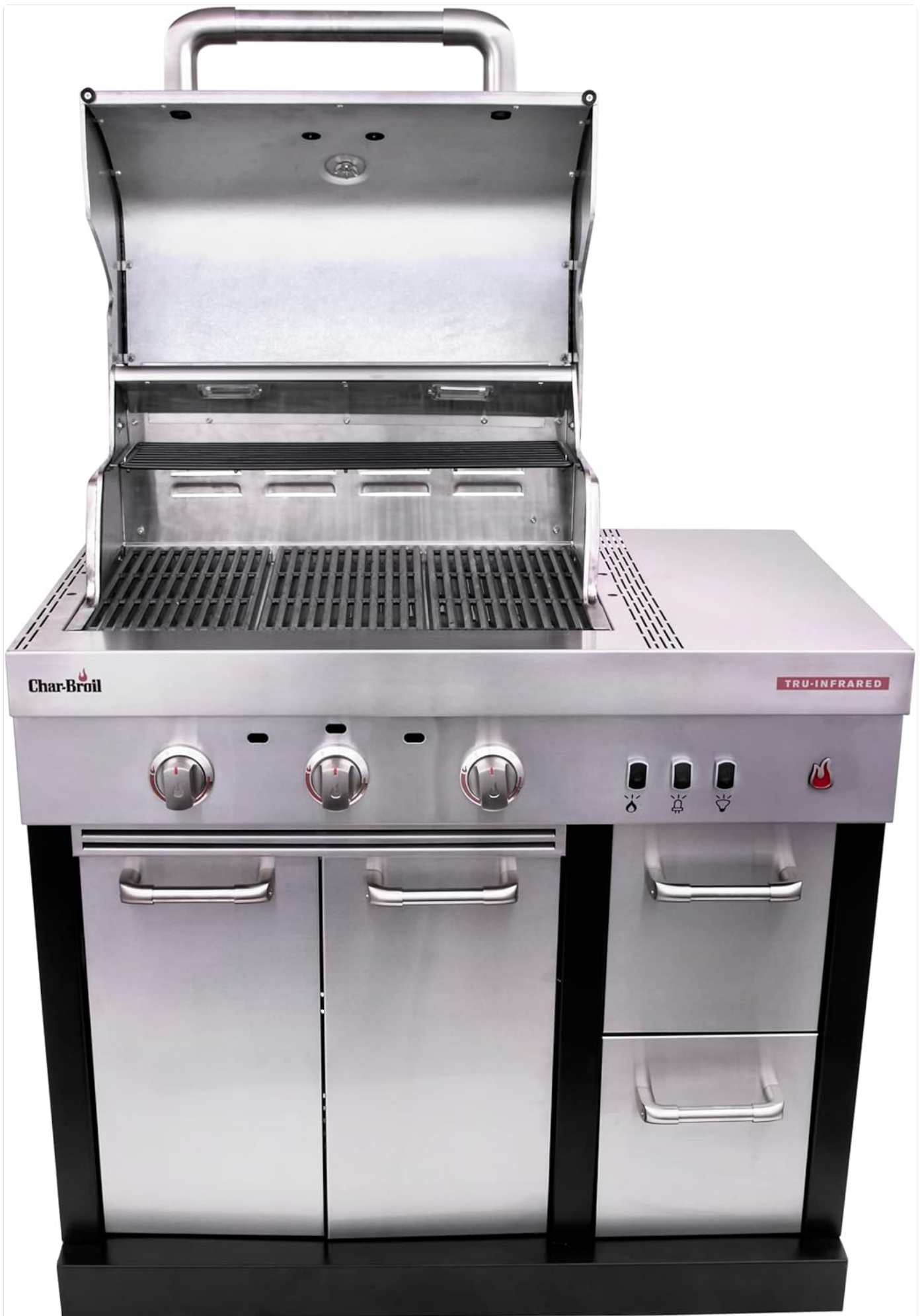
Figure 6.1: Storage drawers provide convenient space for cleaning tools and grilling accessories.