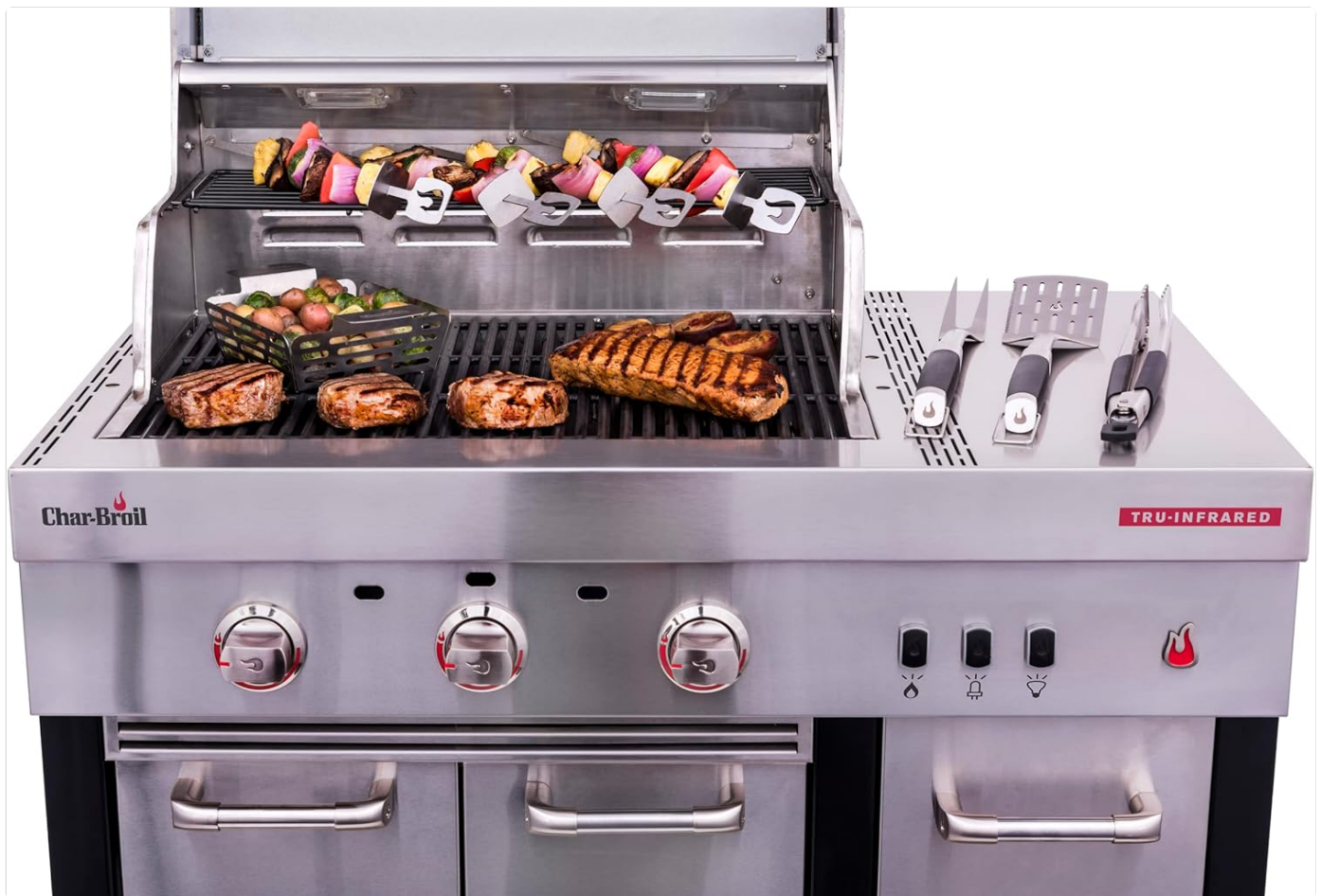
Figure 4.2: Example of a modular attachment bracket for integrating the grill into a larger outdoor kitchen setup.