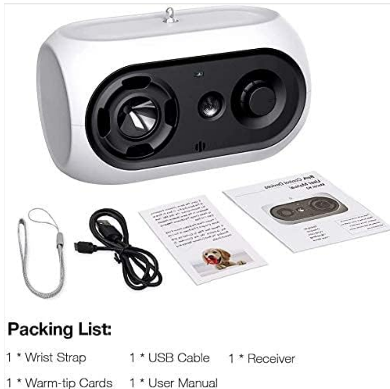
Image: The complete package contents of the bark control device.

Upon opening your package, you should find the following items: