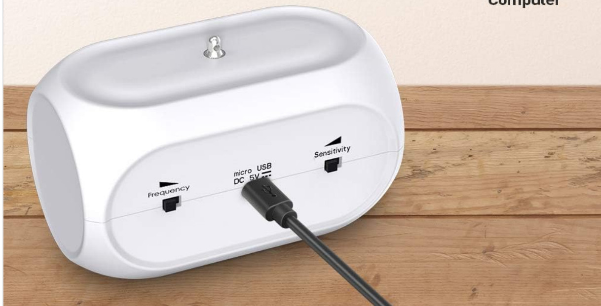
Image: The bark control device being charged via USB, illustrating compatible power sources.