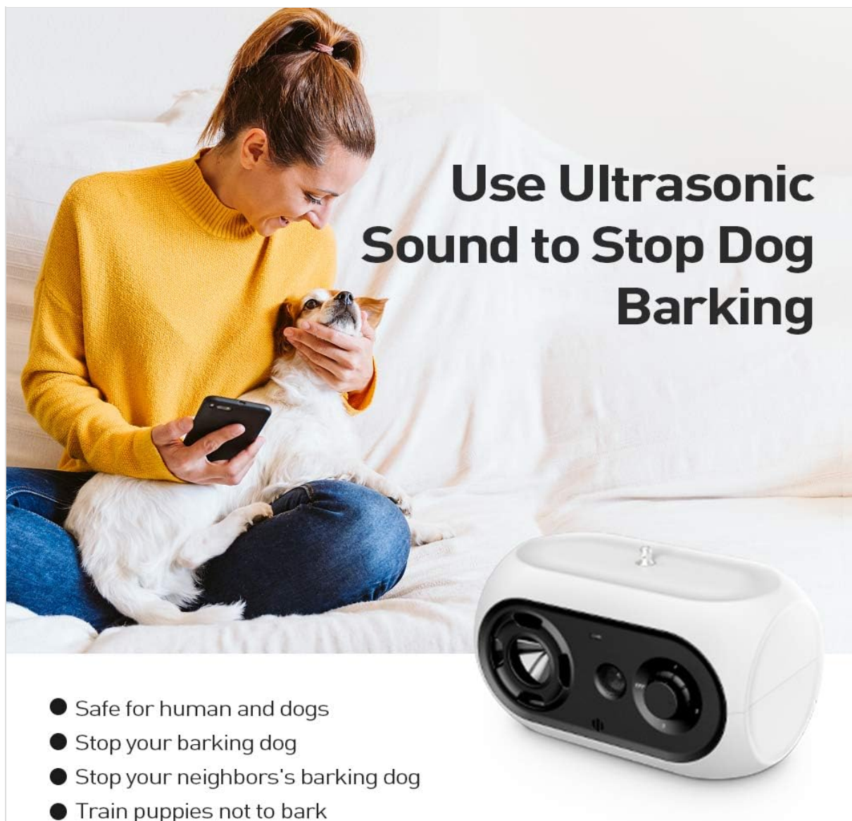
Image: A visual representation of the device's intended use, emphasizing its safety and effectiveness in a home environment.