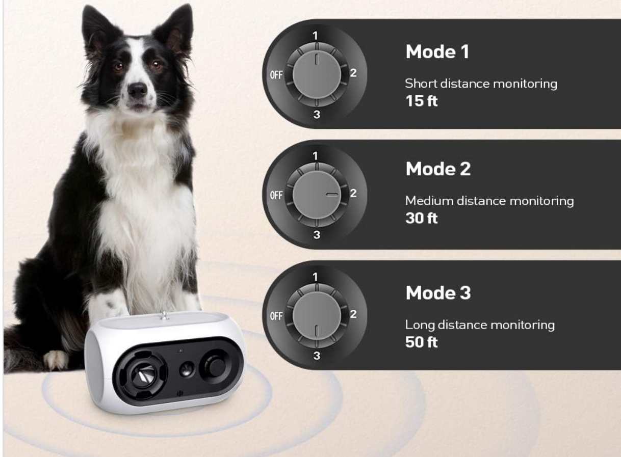
Image: The device's mode selection dial, showing the three distance settings for bark detection.