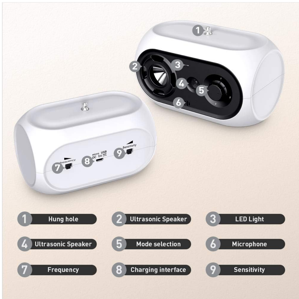
Image: Labeled diagram of the ULPEAK Queenmew Bark Control Device, highlighting its various parts.