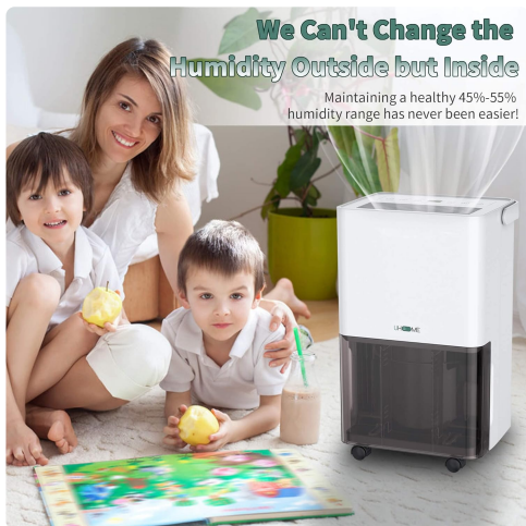
A family enjoying a comfortable indoor environment, emphasizing the dehumidifier's role in maintaining ideal humidity.