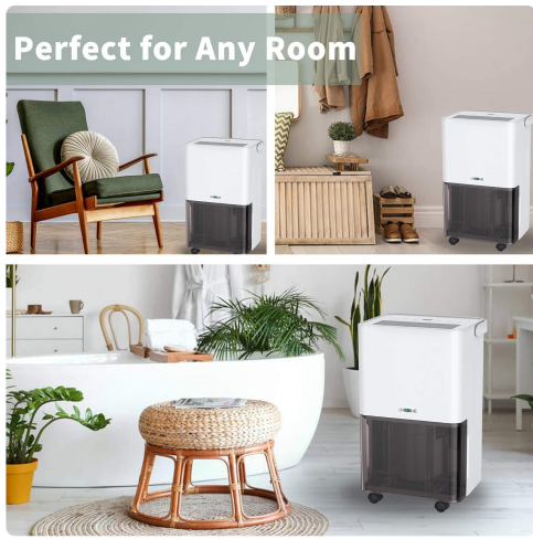
Collage showing the dehumidifier's versatility for use in different rooms like bedrooms, bathrooms, and living rooms.