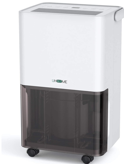
Front view of the Uhome 30 Pint Dehumidifier with its water tank.