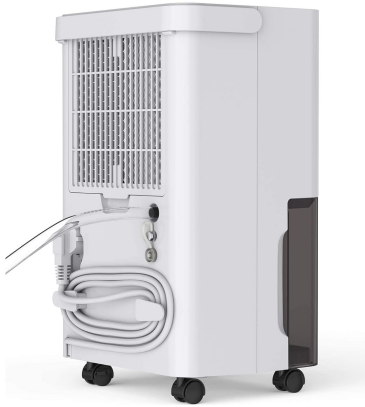
Rear view showing the continuous drainage port for gravity drainage.