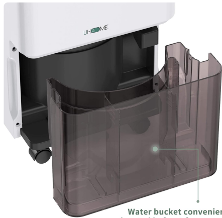
Water bucket conveniently located in front for easy access

Close-up of the light touch intelligent control panel with various function buttons.