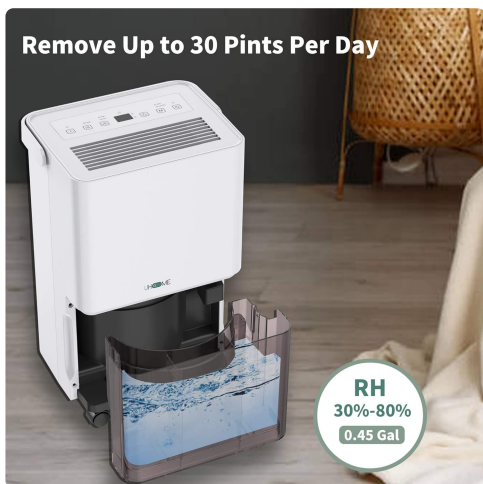
Illustration showing the dehumidifier's capacity to remove up to 30 pints of moisture daily.