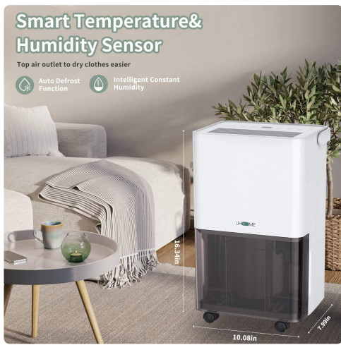
The dehumidifier in a living space, illustrating its compact size and smart features.