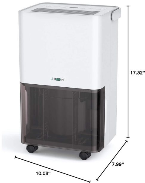
Detailed dimensions of the dehumidifier: 17.32 inches height, 10.08 inches width, 7.99 inches depth.