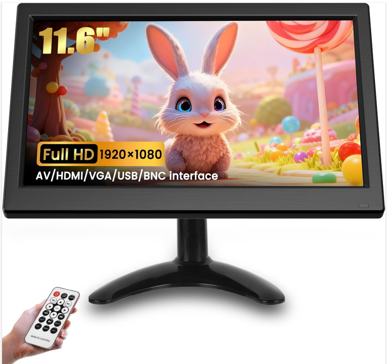
Image 1.1: CAMECHO 11.6-inch Portable Monitor with included remote control.