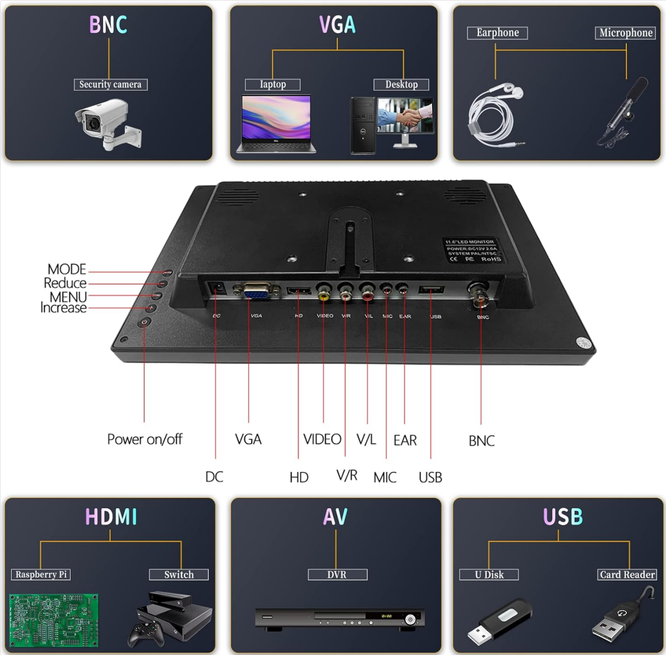
Image 4.2: Overview of monitor ports and their typical connections.