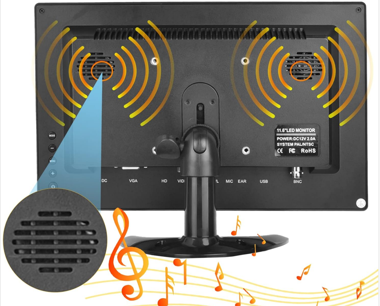
Image 3.1: Rear view of the monitor highlighting the built-in dual speakers.