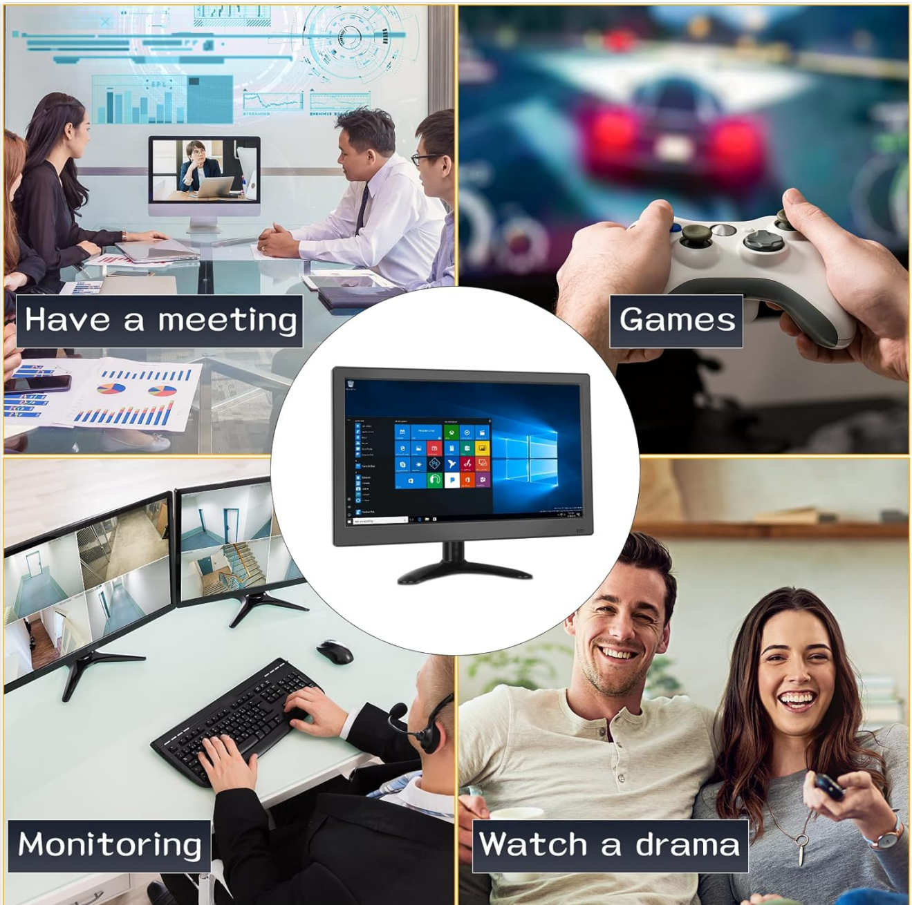
Image 5.2: Various application scenarios for the portable monitor.