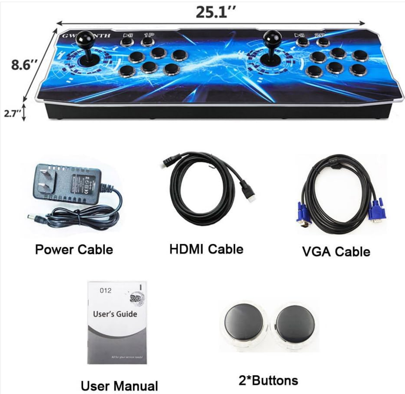
Image 2.1: All included accessories: the Pandora Box 60S Games Console, Power Adapter, HDMI Cable, VGA Cable, User Manual, and two replacement buttons.