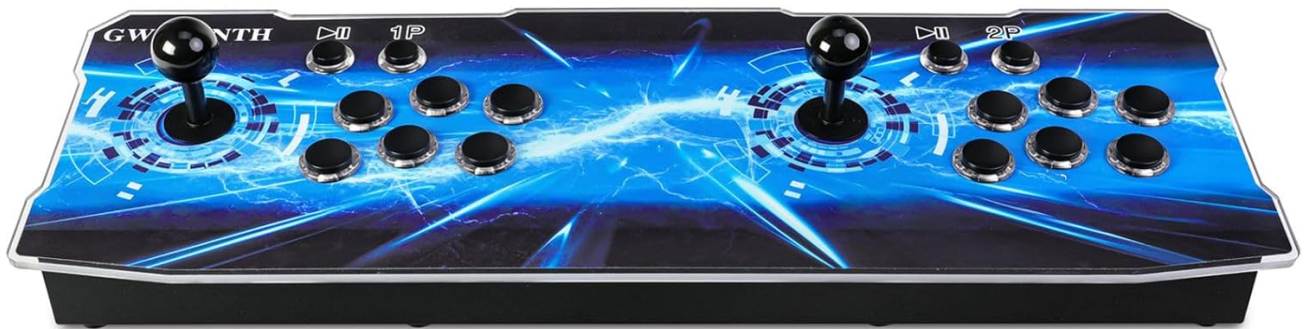
Image 1.1: The GWALSINTH Pandora Box 60S Arcade Games Console, featuring dual joysticks and multiple buttons, connected to a monitor displaying a fighting game.