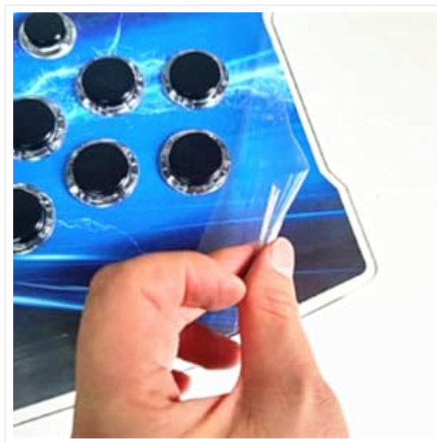
Image 4.1: A hand demonstrating the removal of the protective film from the console's surface, ensuring a pristine appearance.