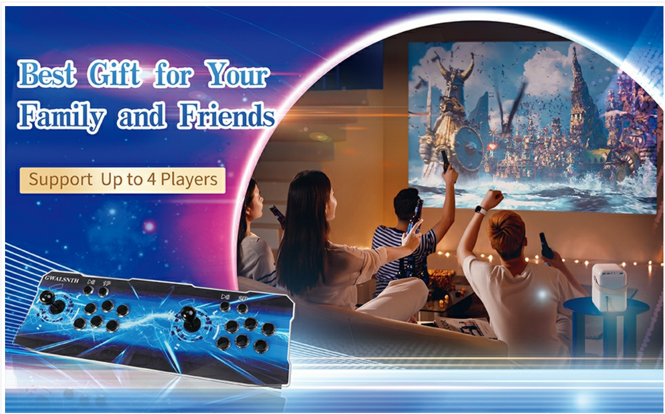
Image 3.4: A family enjoying multi-player gaming with the GWALSNTN console projected onto a large screen, demonstrating the console's ability to support up to 4 players.