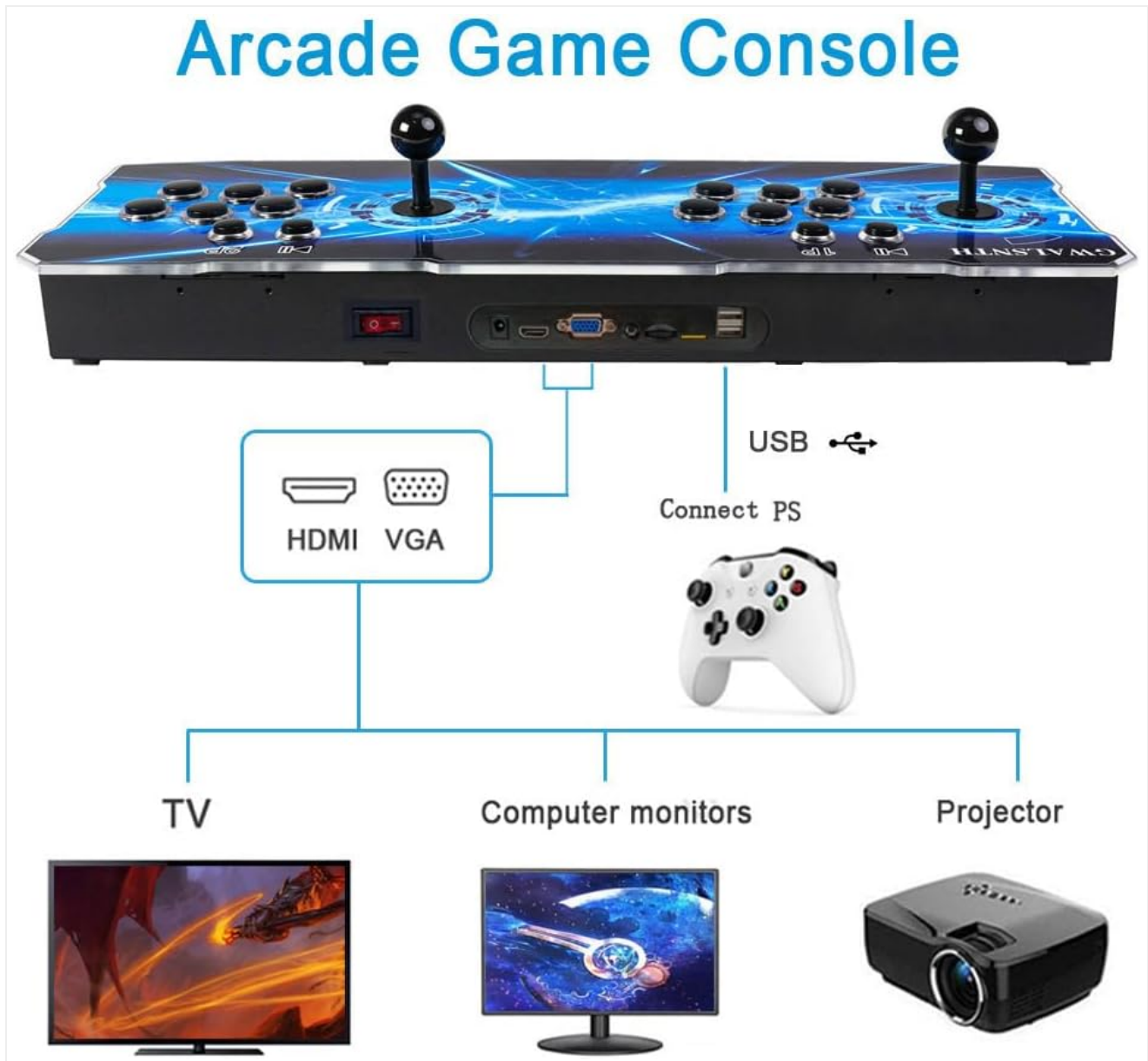
Image 2.2: Connection diagram illustrating how to connect the console via HDMI or VGA to a TV, computer monitor, or projector, and how to connect external USB controllers.