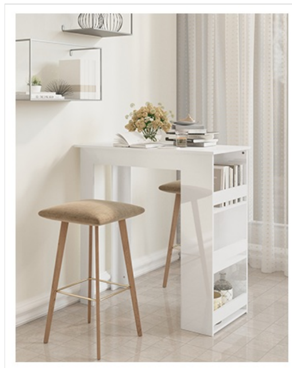
Figure 2: Illustration of the engineered wood material, emphasizing its layered structure for durability, smooth surface, stability, ease of cleaning, and quality finish.