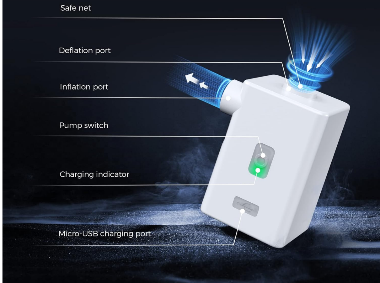
Image: The FLEXTAILGEAR Portable Air Pump demonstrating its ability to inflate sleeping pads, swimming rings, and air mattresses, and deflate vacuum bags. It also clearly indicates items not suitable for inflation, such as balloons, sports balls, and tires.