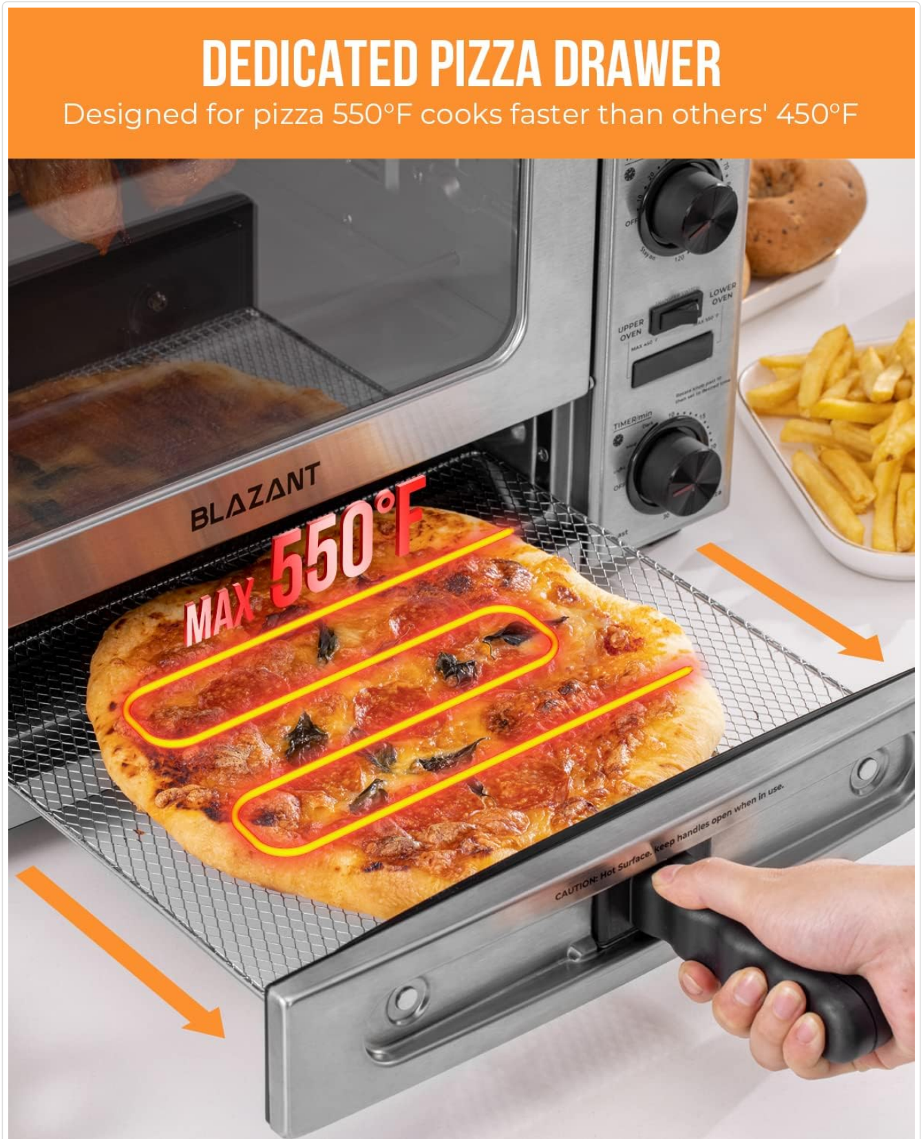
Image: The dedicated pizza drawer of the BLAZANT M-29, with a pizza being cooked. The image highlights the maximum temperature of 550°F for the lower oven, designed for faster cooking of pizzas and toast.

The lower oven features a dedicated pizza drawer for quick and crispy results.