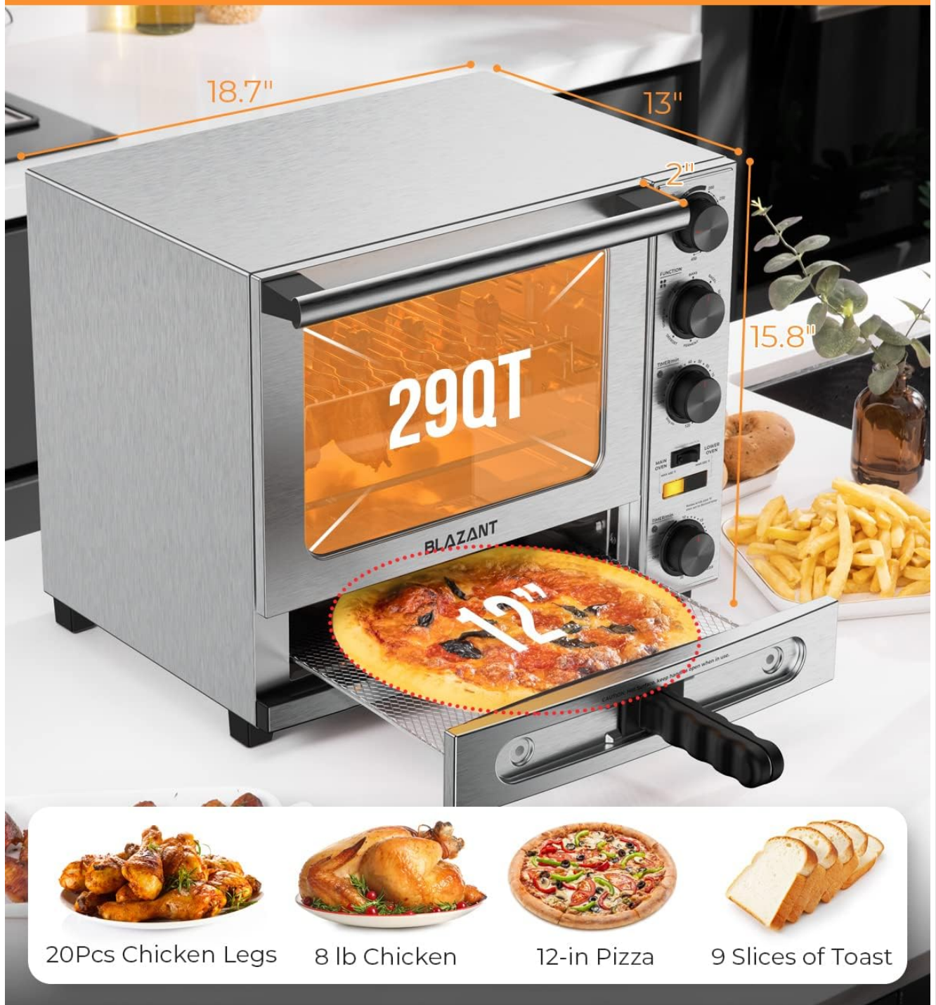
Image: Front view of the BLAZANT M-29 Toaster Oven, highlighting its dual-zone capacity and overall dimensions (18.7" W x 13" D x 15.8" H). The image also shows examples of food items that can be cooked, such as chicken legs, whole chicken, pizza, and toast.