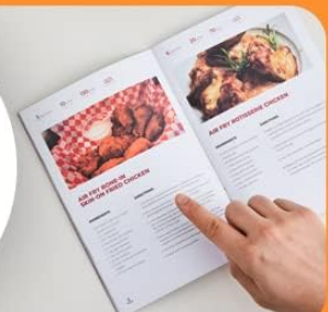
Image: A display of the included accessories: a drumstick grill rack (13.1" x 9.4"), an air fry basket (12.2" x 12.3"), a baking tray (13.1" x 12"), a crumb tray (13" x 12.4"), and an exclusive cookbook with 59 recipes.