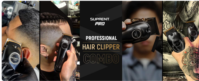
Image: Close-up of the SUPRENT PRO Hair Clipper's powerful motor, LED multi-function display, and metal guide comb.

The ultra-clear LED display on the clipper shows the remaining battery percentage, allowing you to monitor power levels during use.