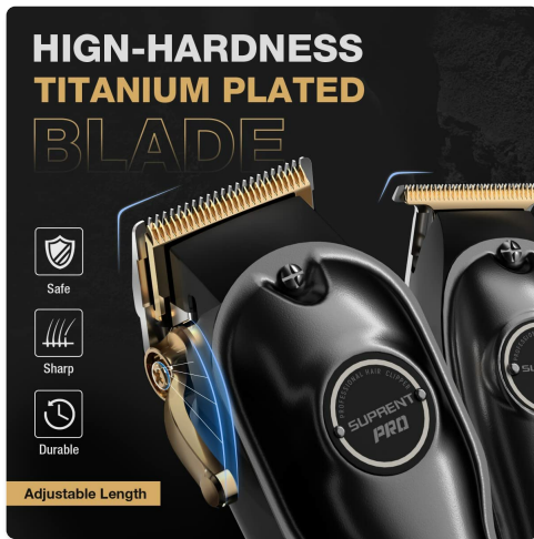
Image: The SUPRENT PRO Hair Clipper and T-Blade Trimmer shown with included metal guide combs.