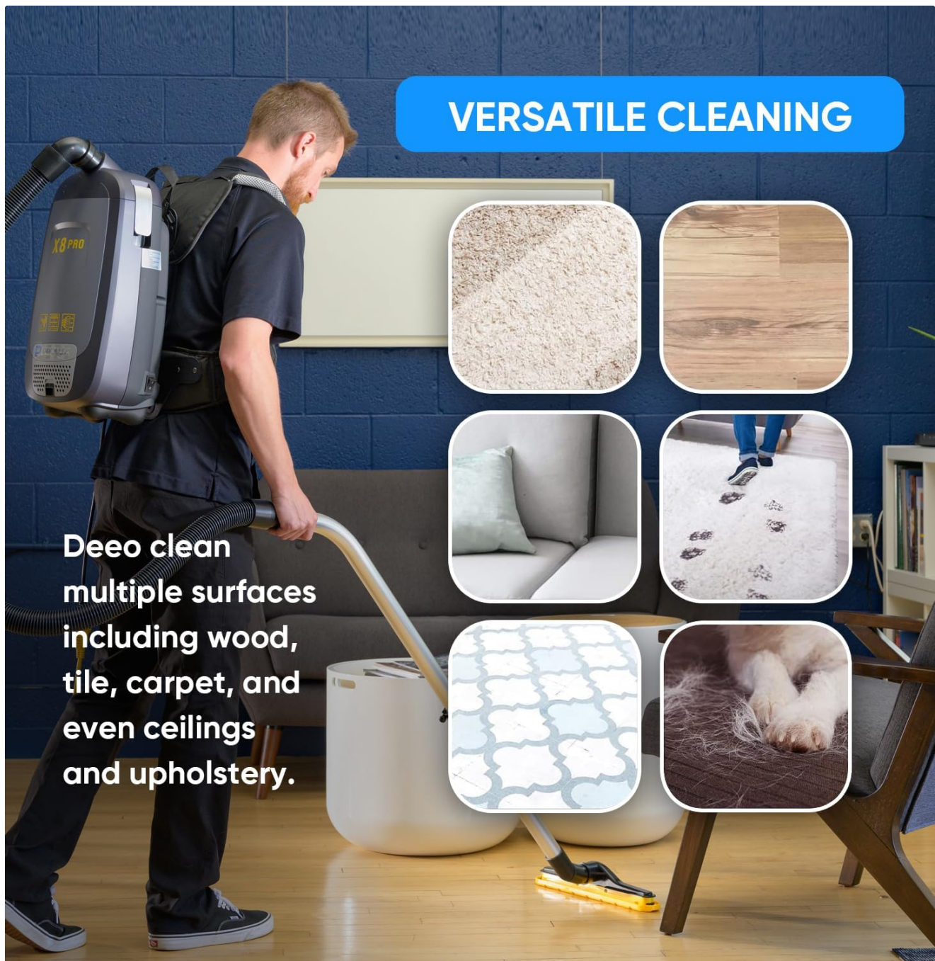
Figure 7: Demonstrates the versatility of the vacuum for cleaning multiple surfaces such as wood, tile, carpet, ceilings, and upholstery.