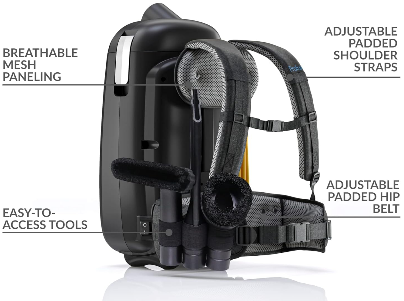
Figure 5: Detail of the adjustable padded shoulder straps and hip belt, designed for comfort and featuring convenient storage for accessory tools.

Clean every room, ceiling, nook, and cranny in comfort.