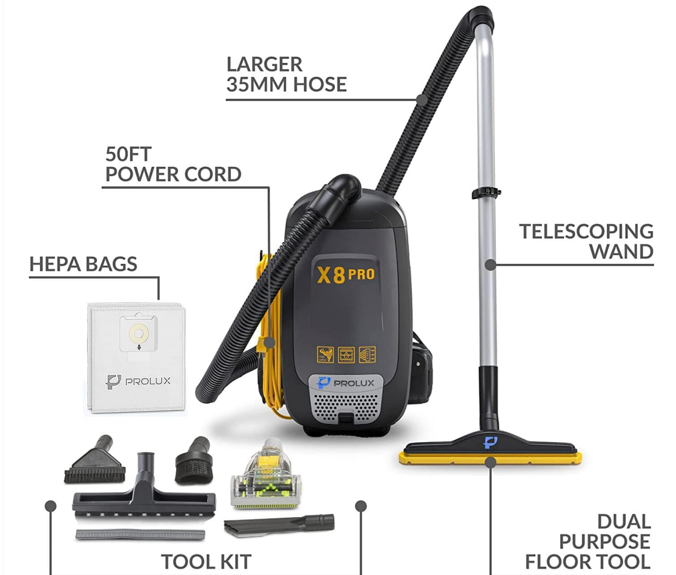
Figure 2: Overview of the Prolux X8 Pro Backpack Vacuum and its labeled components, including the 50ft power cord, telescoping wand, tool kit, and HEPA bags.