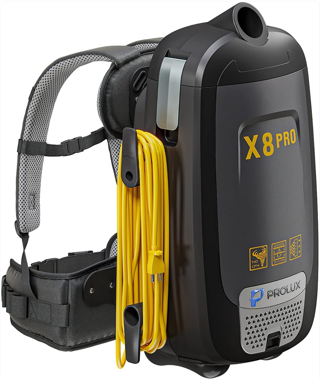
Figure 8: Side view of the Prolux X8 Pro Backpack Vacuum, illustrating the integrated cord wrap for convenient storage of the power cord.