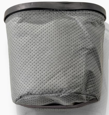
Figure 3: Components of the 4-stage HEPA filtration system: HEPA filter, cloth bag, HEPA bags, and carbon post filter.