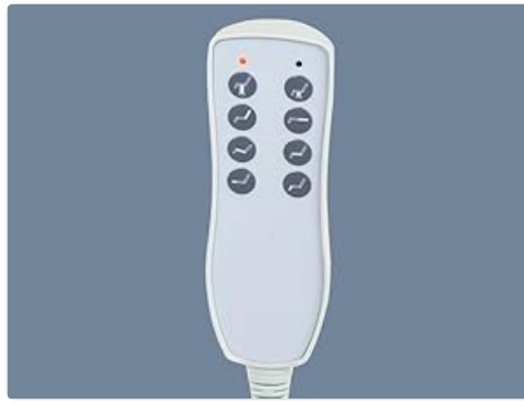
Figure 3: Wired Remote Control