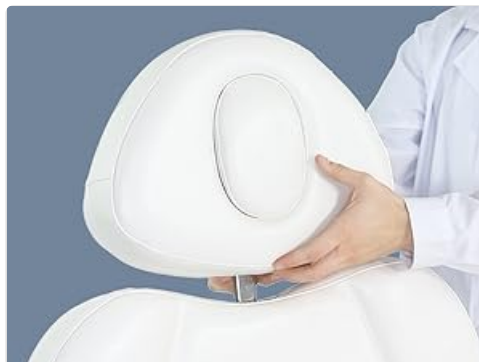
Figure 8: Headrest Removal