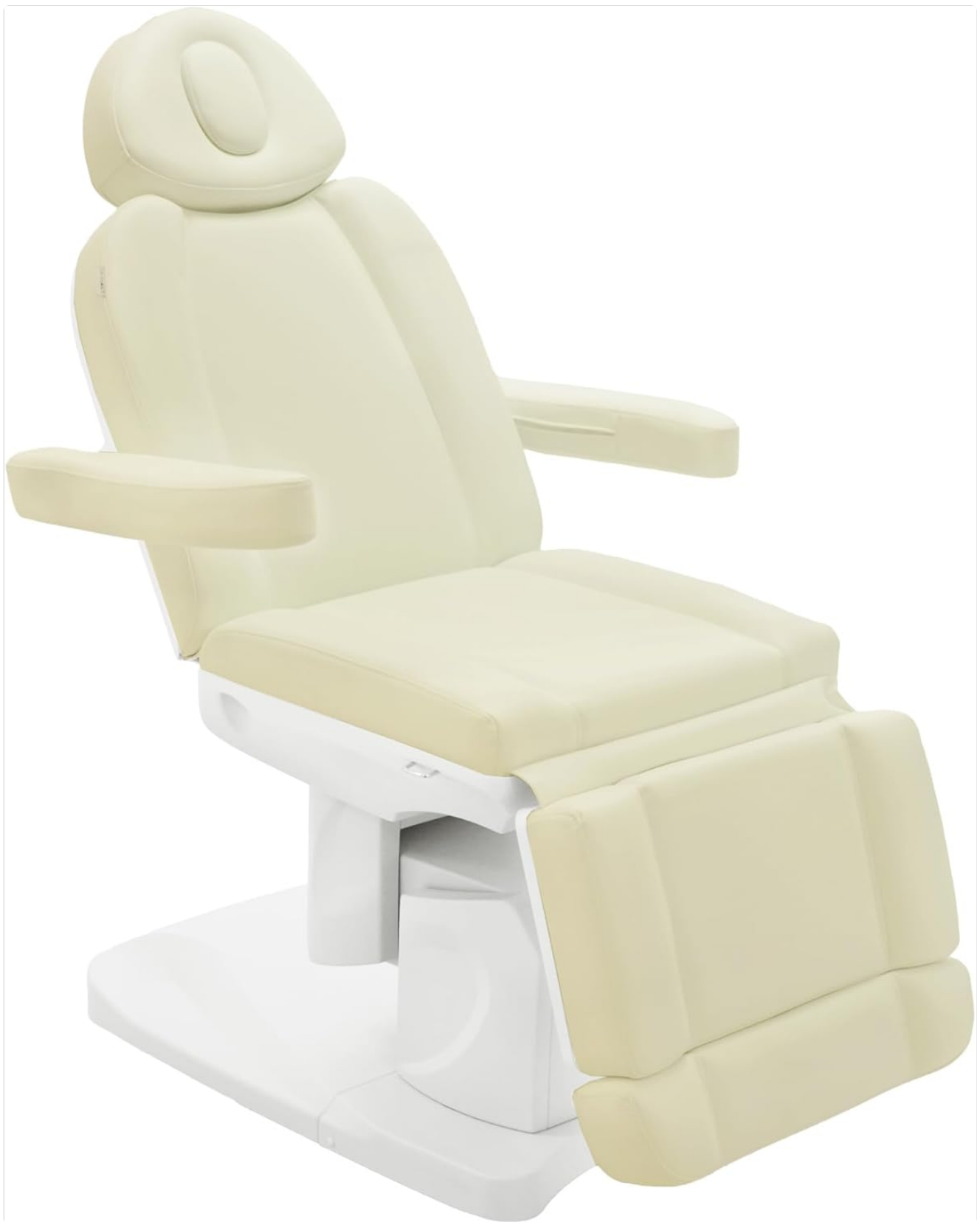
Figure 1: SKINACT Bellage Electric Treatment Table (Beige)