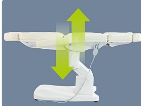
Figure 6: Height Adjustment