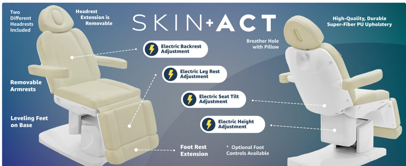
Figure 2: Key Features and Electric Adjustments