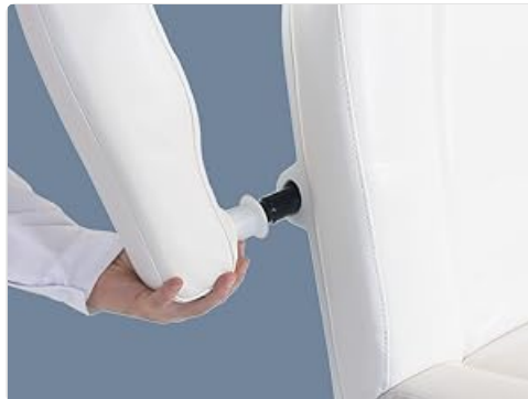
Figure 7: Armrest Removal