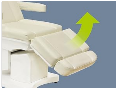
Figure 5: Leg Rest Adjustment