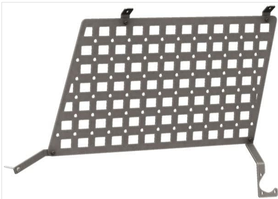
Figure 1.2: The Barnes 4WD Passenger Rear Window Molle Panel, showcasing its grid pattern for accessory attachment and pre-drilled mounting points.