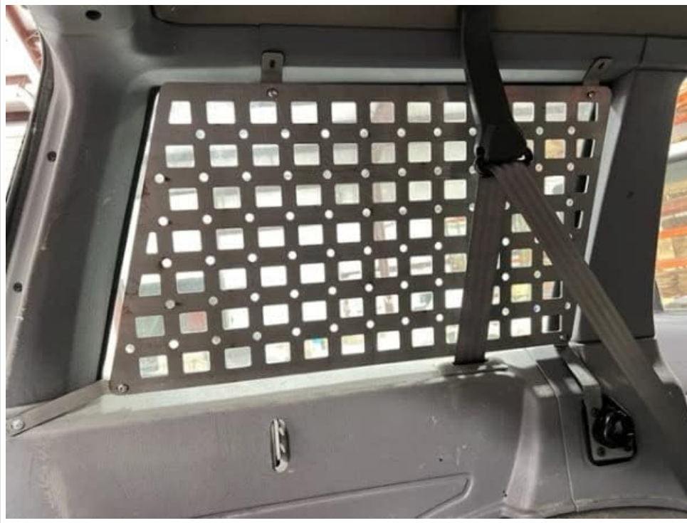
Figure 3.1: The Barnes 4WD Molle Panel installed in the rear passenger window of a Jeep Cherokee, demonstrating its secure fitment and integration with the vehicle's interior.