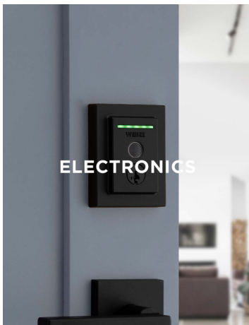
TABLE DES MATIÈRES Weiser Pricebook 2023 FR low res ca weiserlock assets resources price guide ||| TABLE DES MATIÈRES RENSEIGNEMENTS GNRAUX MODALITS Page En vigueur le 1 octobre 2022 2 Mise jour ... disponibles 15 Nickel satin 26D Chrome satin 514 Noir mat Prix courant Quantit par caisse GED 9260 9GED92600-003 9GED92600- 004 9GED92600-005 270 2 20 min. Pav tactile traditionnel Smartcode Fini... lang:fr score:30 filesize: 9.89 M page_count: 139 document date: 2023-02-08