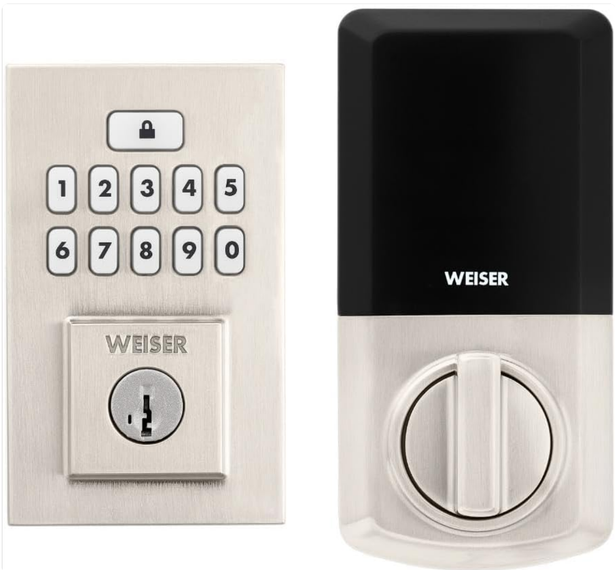
Image: Assembled Weiser SmartCode Keypad Electronic Deadbolt, showing both exterior and interior components.