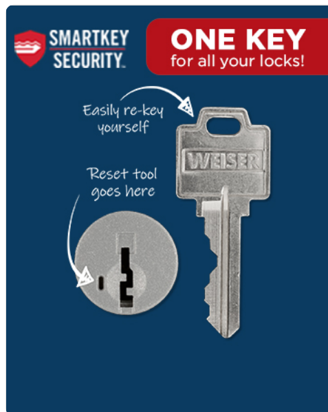
Image: SmartKey Security feature, demonstrating how to re-key the lock.

The SmartKey re-key technology allows you to re-key your lock in seconds, maintaining key control and protecting against lost, stolen, or unauthorized keys without removing the lock from your door. Use the provided SmartKey tool and follow the instructions carefully.