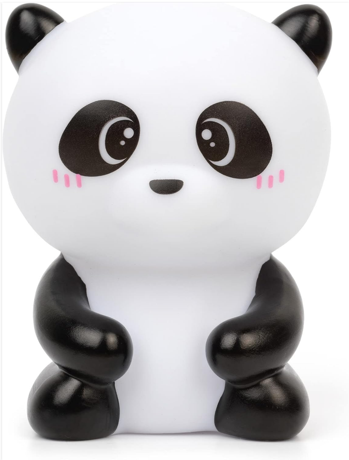
Image 1: The Legami Sweet Dreams Panda Night Light in its standard white appearance.