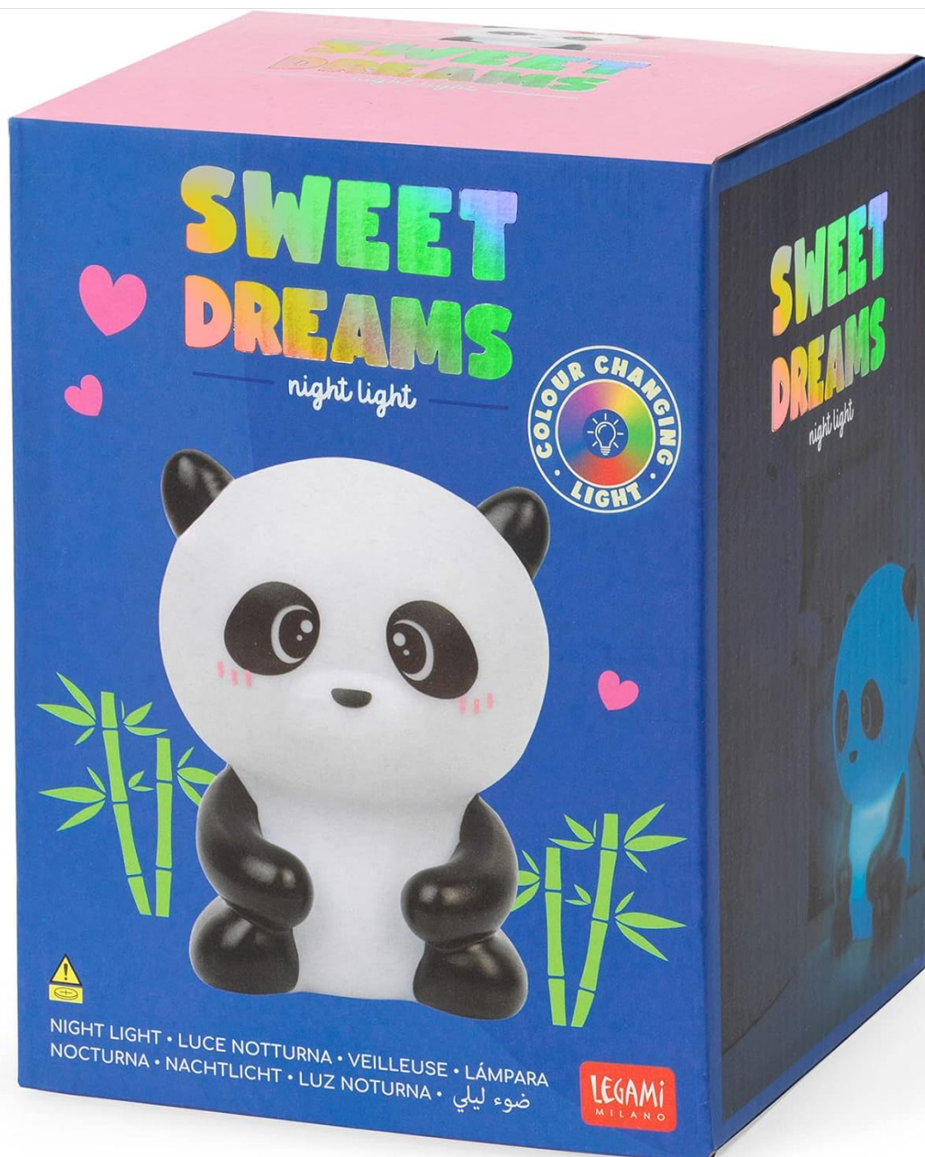
Image 2: The retail packaging for the Legami Sweet Dreams Panda Night Light.