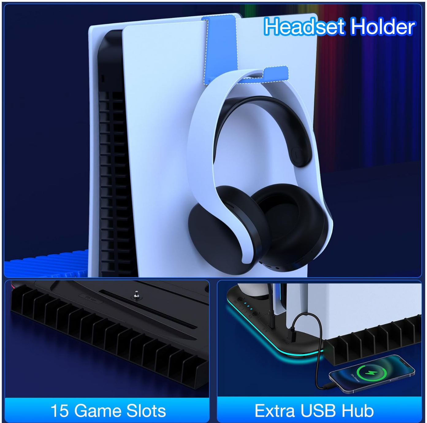
Image: The stand's features for organizing games, headsets, and other accessories.