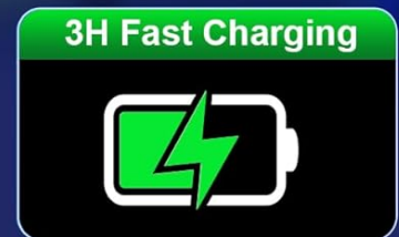
Image: The stand's controller charging functionality with status indicators.