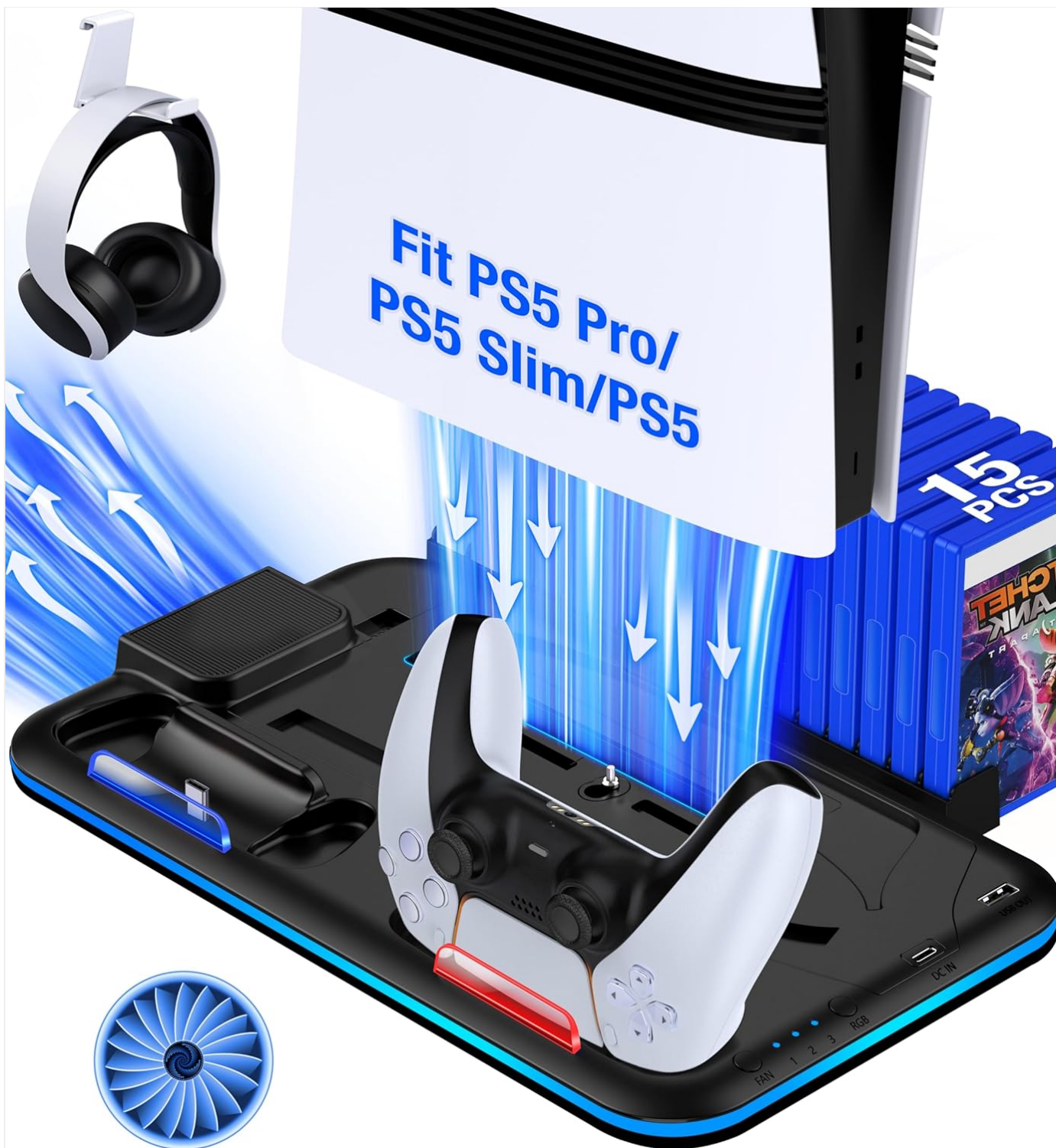
Image: The Kawaye multifunctional stand, showcasing its features including console support, controller charging, headset storage, and game slots.