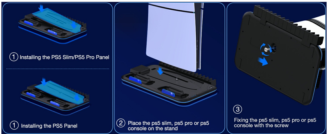
Image: Step-by-step visual guide for assembling and connecting the stand with a PS5 console.