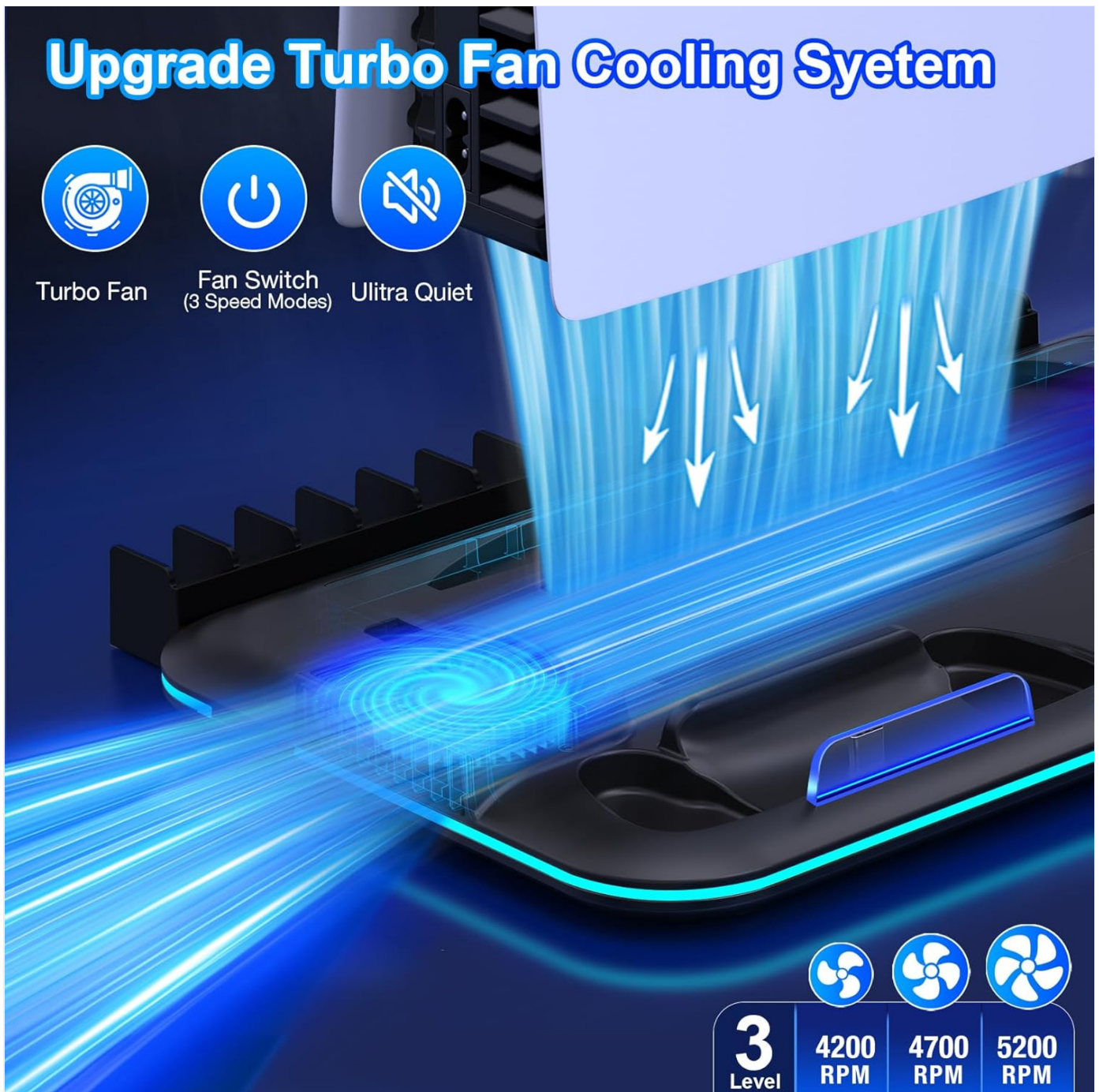
Image: Illustration of the cooling fan's airflow and speed settings.