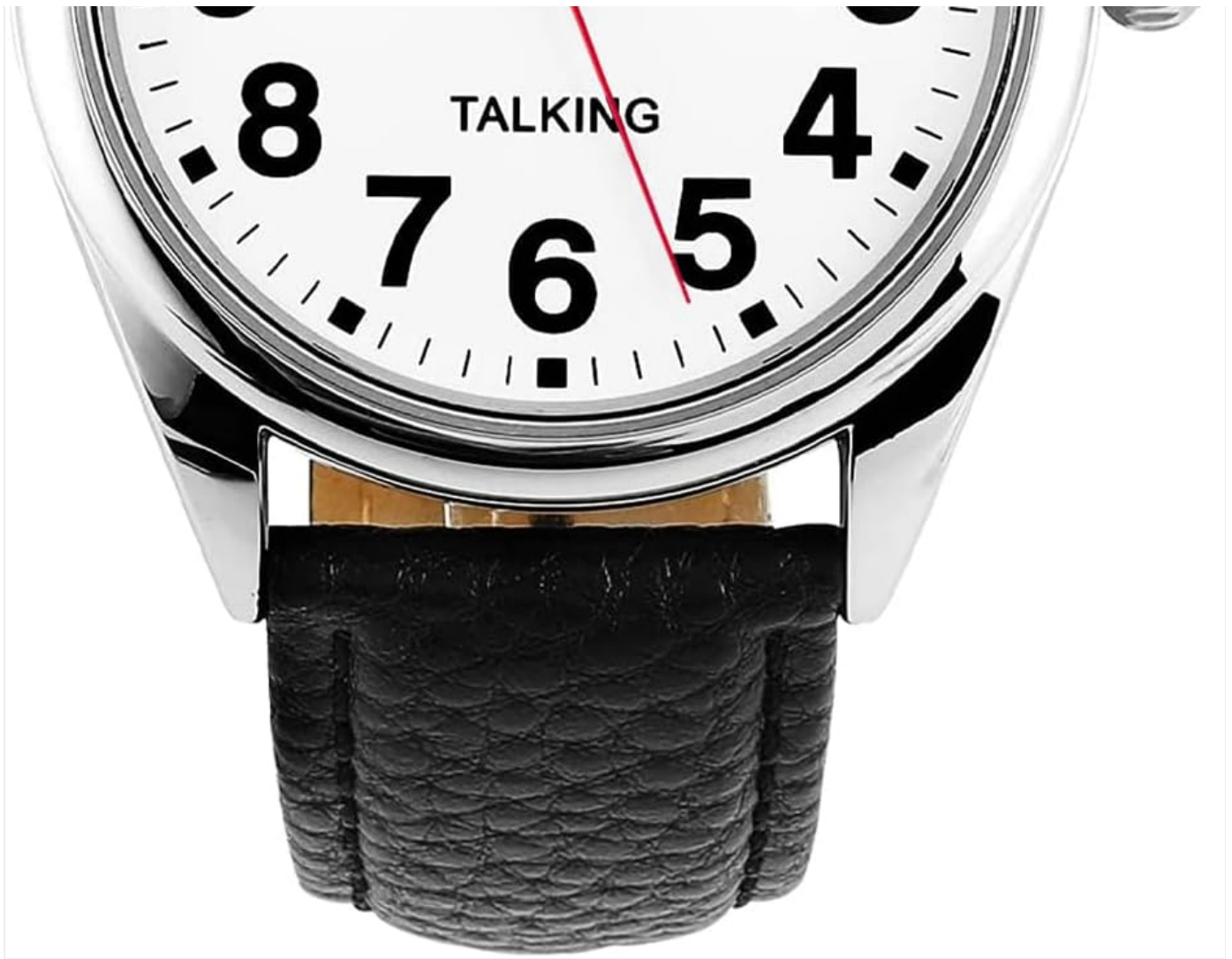
Image: Front view of the ViLoSa Talking Watch, showcasing its white dial with large, easy-to-read Arabic numerals and a black leather strap.