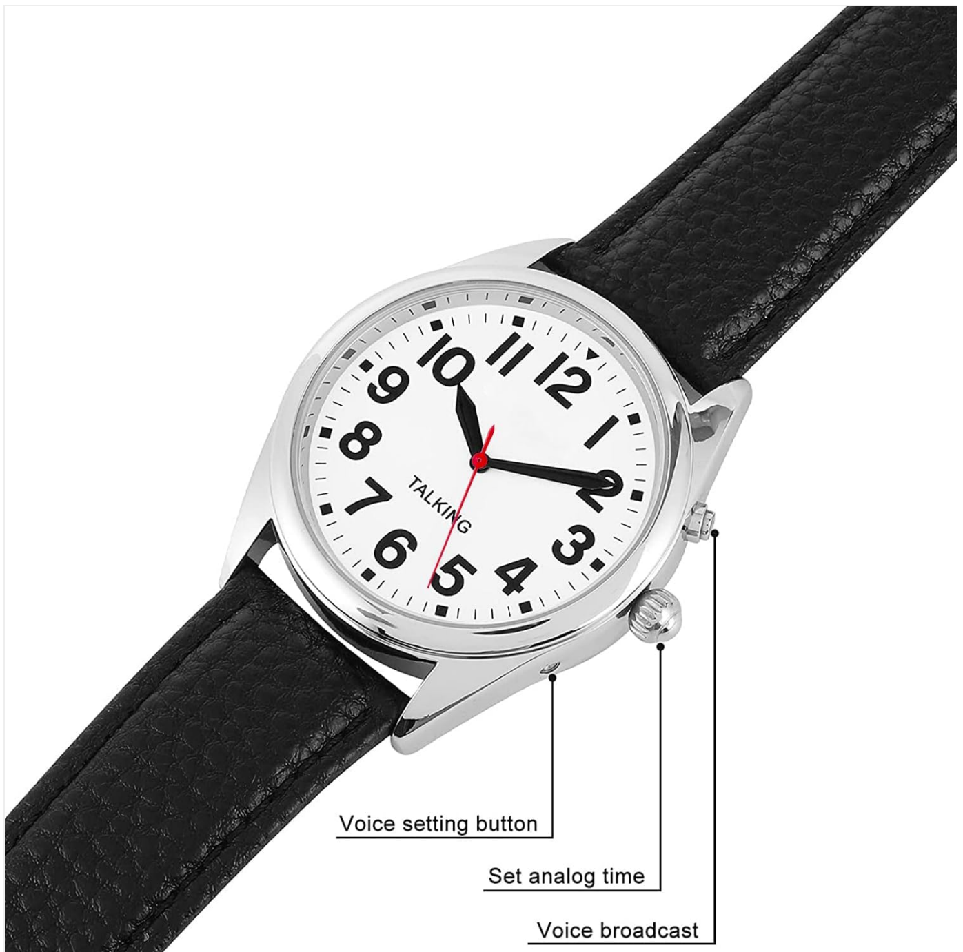
Image: A diagram illustrating the location and function of the two buttons on the side of the watch: the Voice Setting Button and the Set Analog Time/Voice Broadcast Button.